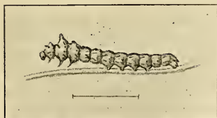
Agdistis salsolae (98418).

This larva differs in structure from others of the genus, and especially by its much higher metathoracic humps from that of frankeniae Z., although in