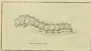
Atucita hesperidella (98829).