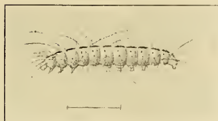
Gypsochares olbiadactyla (98902).