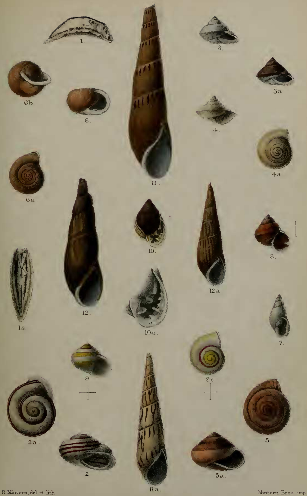
NEW TERRESTRIAL AND FLUVIATILE MOLLUSCA FROM THE "CHALLENGER" EXPEDITION.