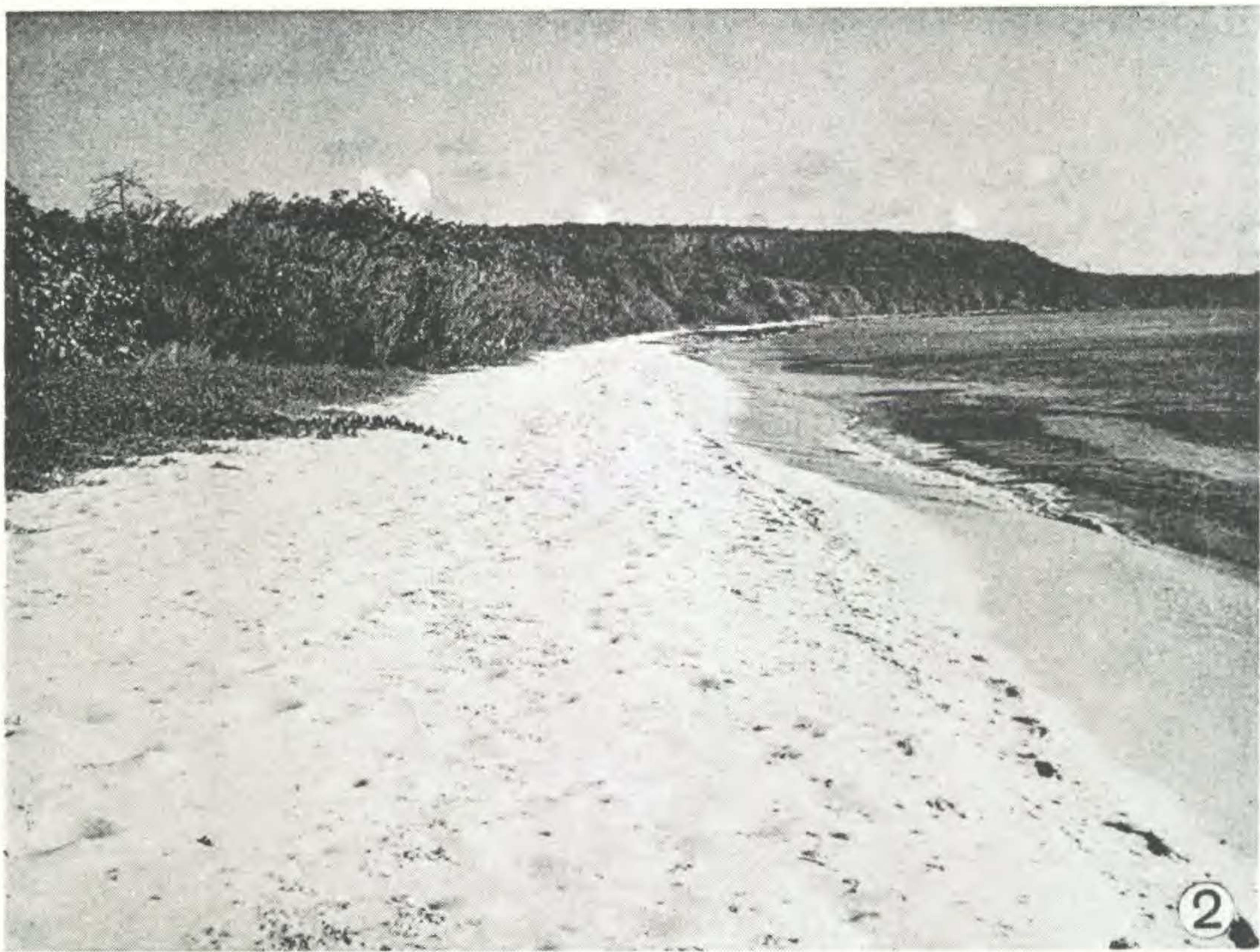
HOWARD, VEGETATION OF BEATA AND ALTA VELA