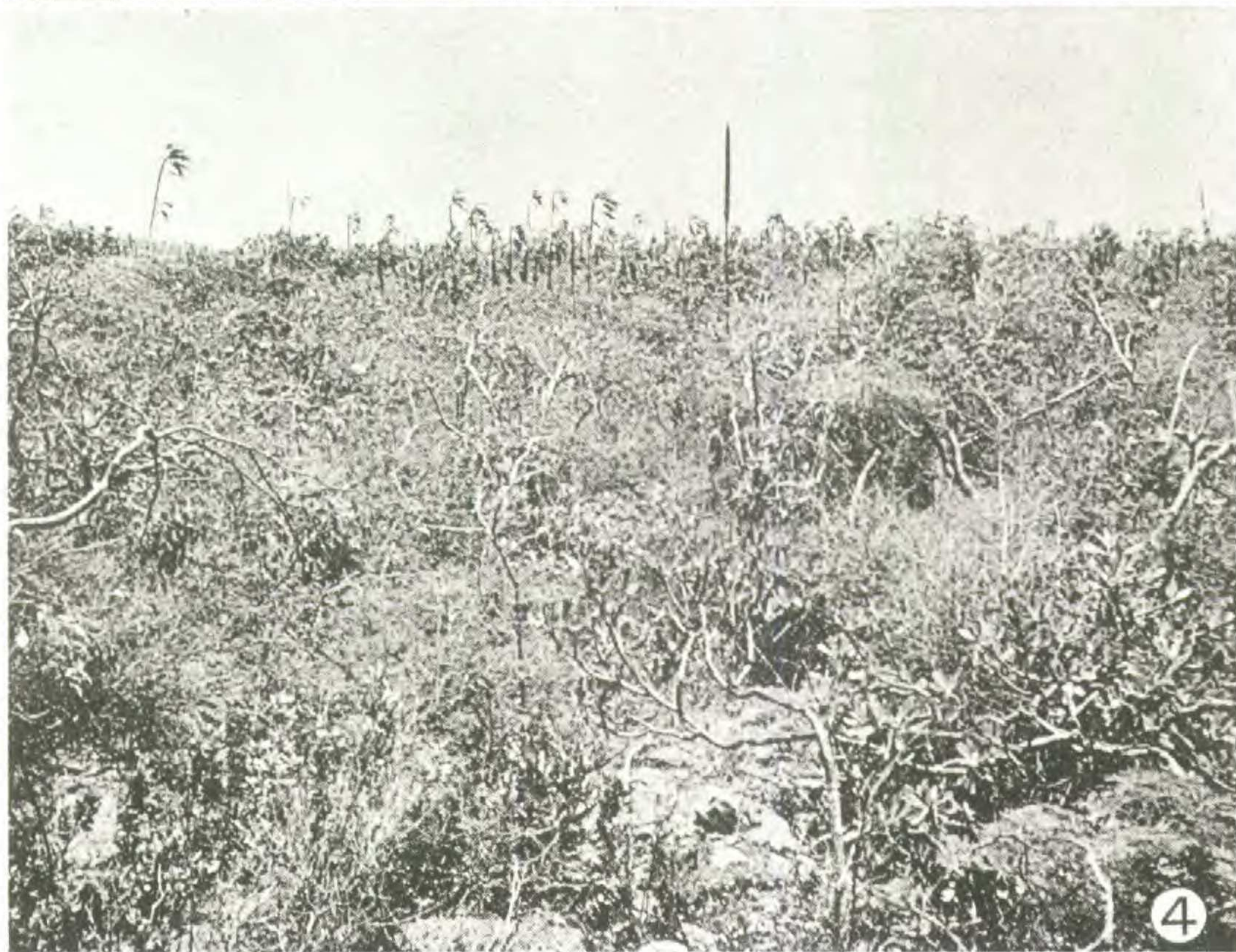
HOWARD, VEGETATION OF BEATA AND ALTA VELA