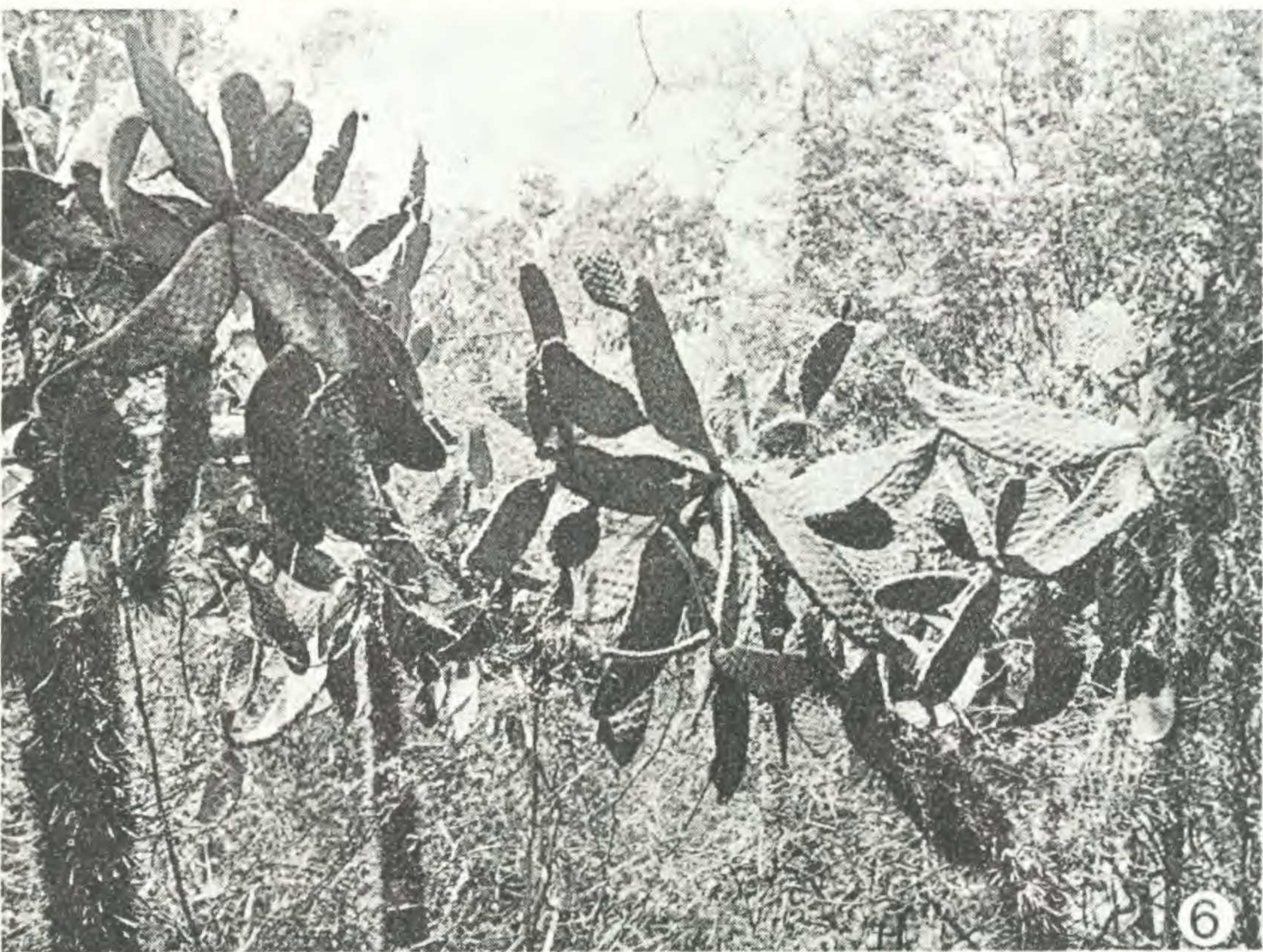
HOWARD, VEGETATION OF BEATA AND ALTA VELA