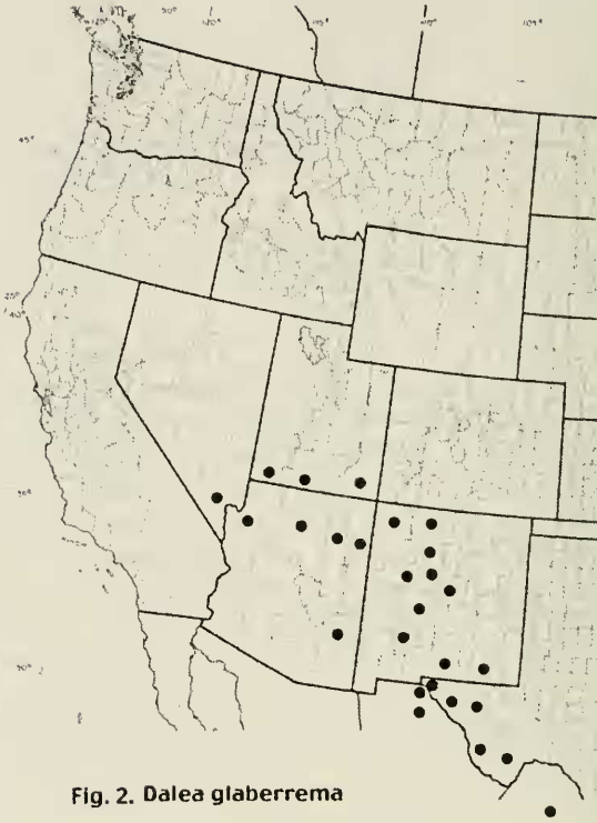
Fig. 2. Dalea glaberrema