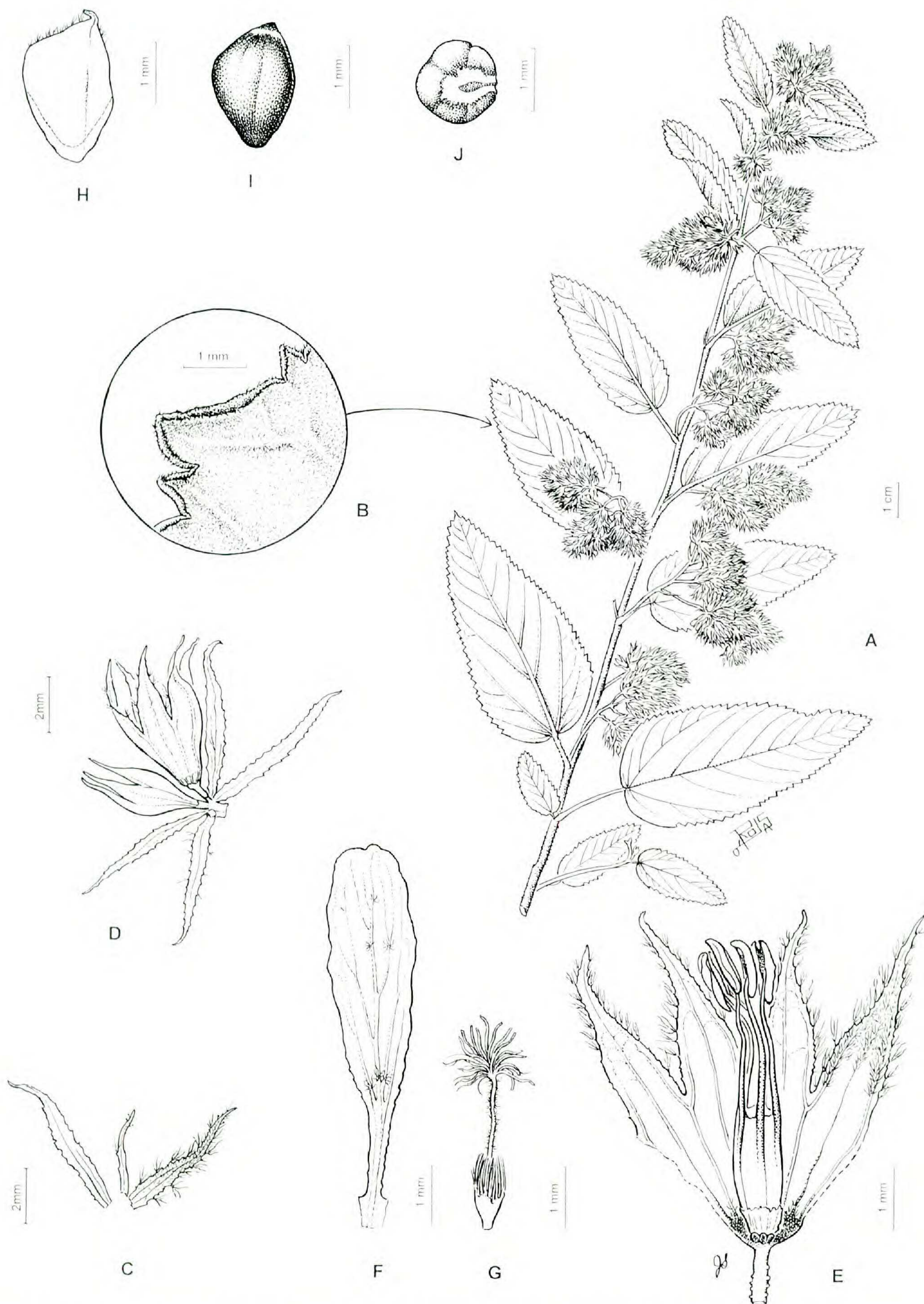
Figure 1. Waltheria belizensis J. G. Saunders. —A. Flowering branch. —B. Detail of revolute abaxial leaf margin. —C. Involucre, two stipules, and bradytelic leaf, from node below D. —D. Primary sympodial cyme with flower pair and two bracts above and below, developing cyme buds removed. —E. Thrum-like flower, opened, minus one calyx lobe, minus petals above base, minus pistil, with androecium and connate, adnate petal bases not removable, as irregular ring at base above lobed receptacle. —F. Petal, abaxial, missing base drawn in. —G. Pistil. —H. Capsule halved, interior view, showing extent of corneous endocarp from apex to lower broken line. —I. Seed, lateral view. —J. Seed, apical view. Based on the holotype, Dwyer & Liesner 12292 (MO); B–J drawn by camera lucida by Saunders; A drawn and A–J inked by Francisco Rojas.