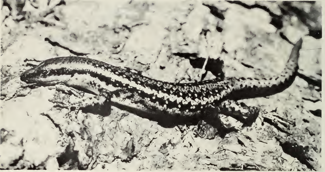
Fig. 3.—Photograph to show pigment pattern of Emoia parkeri .

from the fore limbs to the hind limbs. In other individuals this cannot be distinguished and is just a collection of black markings. On all specimens there is a clear line of basic greenish-bronze coloring along the spine. The basal half of the tail is more nearly turquoise-green, very conspicuously so in young specimens. The limbs are all bronze-olive on the dorsal surface, strongly speckled with dark and pale scutes. The tail is also speckled, but has a less granular appearance than the body or the limbs. The ventral surface is a pale yellow-green (Fig. 3a).