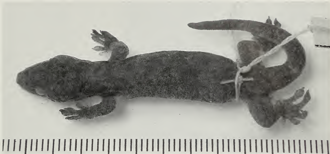
Fig. 1. The holotype of Lepidodactylus tepukapili , USNM 531712.