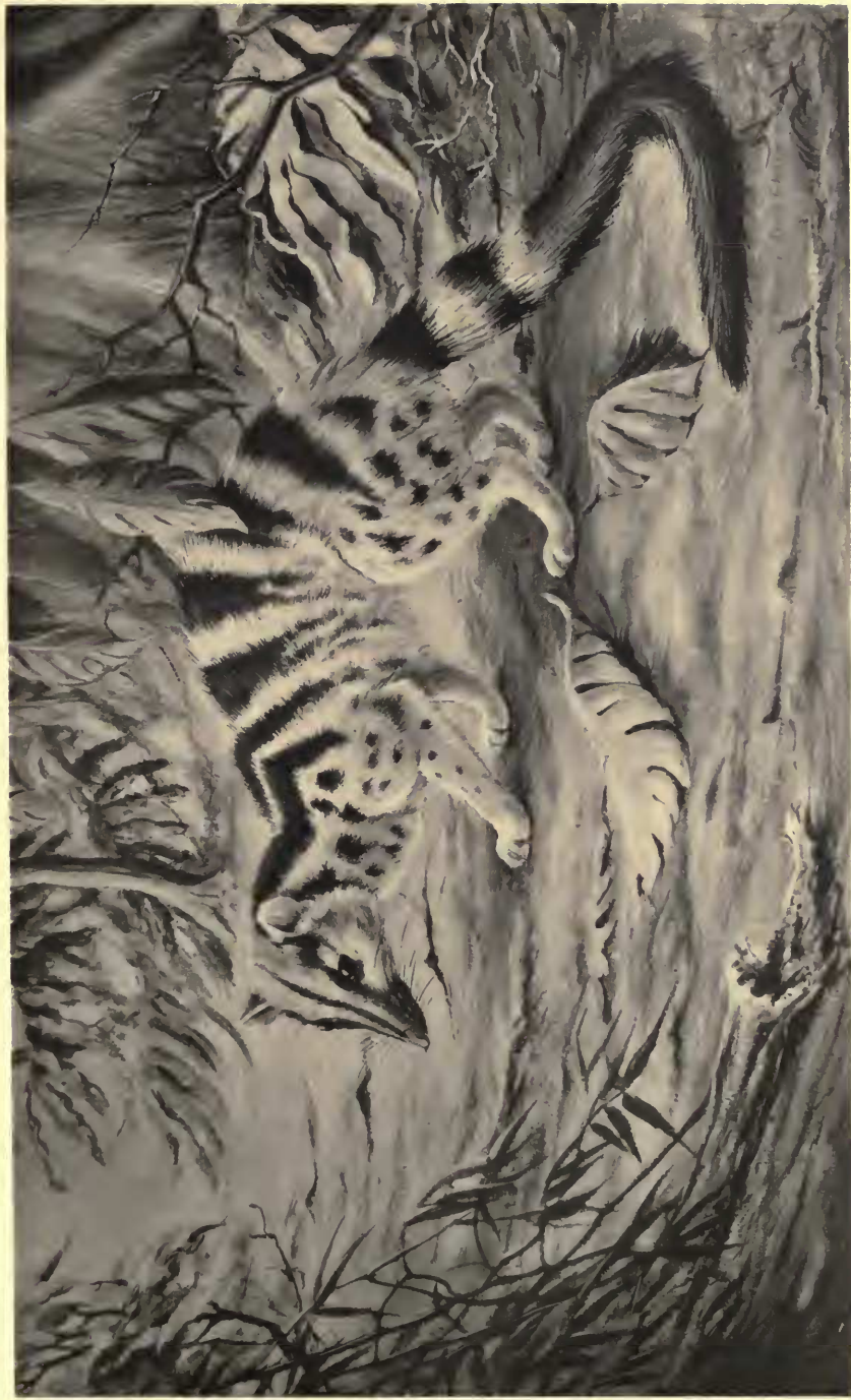
OWSTON'S CIVET ( Chrotogale owstoni Thomas)