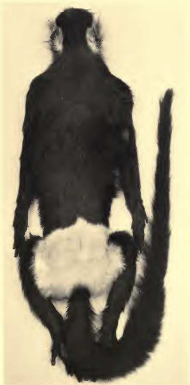
DELACOUR'S LANGUR ( Pithecus delacouri sp. nov.) Type specimen