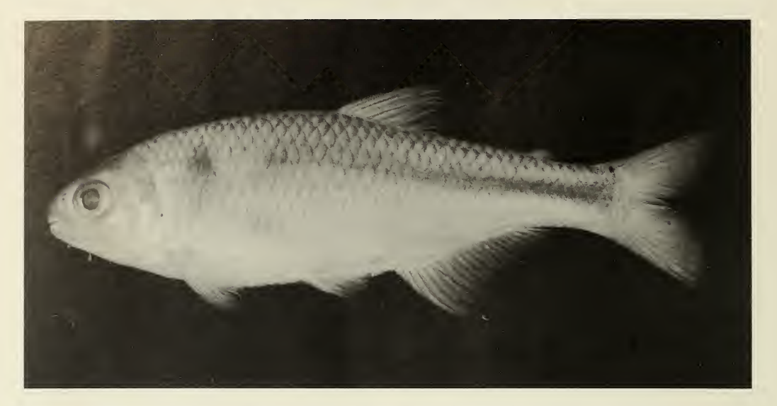
Fig. 1. Holotype of Bryconamericus lambari, new species (MCP 15448, male, 55.9 mm SL).

Four teeth in the inner row, all with 5 cusps, except medial tooth with 4 cusps. Maxilla with 3 or 4 teeth with 3–5 cusps; teeth grad-ually becoming smaller posteriorly. All maxillary teeth with median cusp distinctly larger.