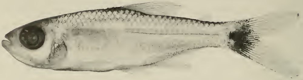
Fig. 1. Serrabrycon magoi , new species, holotype, MBUCV 14270, 27.5 mm SL.

counterstained for cartilage and bone); MBUCV 14271, 10 specimens, 21.3–25.4 mm SL; MZUSP 28749, 3 specimens, 23.5–24.6 mm SL; and BMNH 1985.4.9:4–6, 3 specimens, 21.3–23.5 mm SL. Venezuela, Territorio Federal Amazonas, Departamento Río Negro, drying lagoon northeast of airport at San Carlos de Río Negro (approx. 01°55'N, 67°02'W); collected by A. Machado-Allison, R. P. Vari, C. J. Ferraris, Jr., J. Fernandez and O. Castillo; 4 Dec 1984; 10 specimens: USNM 270259, 5 specimens, 24.9–31.8 mm SL; and MBUCV 14272, 5 specimens, 24.7–26.5 mm SL.