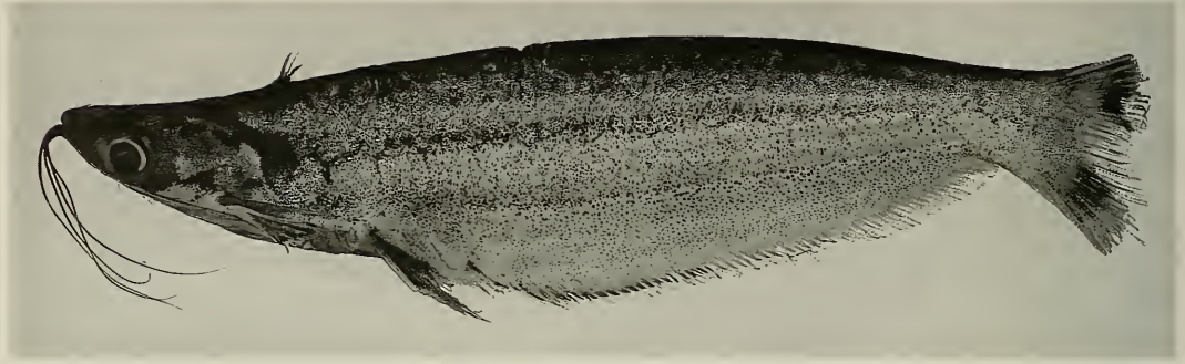
Fig. 2. Epapterus dispilurus , female, USNM 305651, 102 mm SL; showing form of dorsal-fin spine and maxillary barbel in females and immature individuals.

gin distinctly rounded from that view. Head length 18.3–21.6 [18.9] of SL. Lower jaw slightly shorter than upper jaw in females and immature specimens, difference in jaw lengths slightly more pronounced in mature males; no teeth present on premaxillae, dentaries, vomer, and palatines. Lower pharyngeal tooth plates large and round with short conical teeth; convex fourth upper pharyngeal tooth plate with short conical teeth. Snout length 36.2–40.9 [40.7] of HL. Orbital margin not free, horizontal width of orbit 26.7–30.2 [29.2] of HL. Length of postorbital portion of head 41.5–46.7 [41.5] of HL. Interorbital region gently convex. Nares of each side of head separated by distance approximately equal to 4.5–5.0 times diameter of posterior nostril; anterior nostril somewhat tubular, located on anterodorsal surface of snout, above lip; posterior nostril larger, oval.