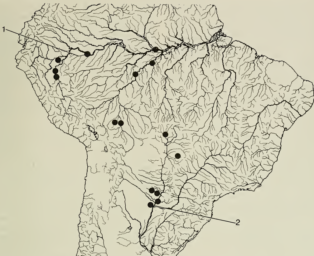
Fig. 3. Map of central portions of South America showing known distribution of Epapterus dispilurus (type locality of E. dispilurus inexact = Peruvian Amazon; 1 = type locality of Euanemus longipinnis ; 2 = type locality of Epapterus chaquensis ; some symbols represent more than one locality or lot of specimens).

cussion, that author (Fowler 1941:468, fig. 26 repeated in Fowler 1945:66, fig. 26) provided a cryptic, but valid, lectotype designation by the statement "tipo, largo 125 mm" which accompanied his line drawing of the species. The cited length corresponds with the total length of the larger of the two syntypes of E. dispilurus which we consequently consider to be the lectotype (ANSP 21353). This obscure lectotype designation was overlooked in Böhlke (1984).