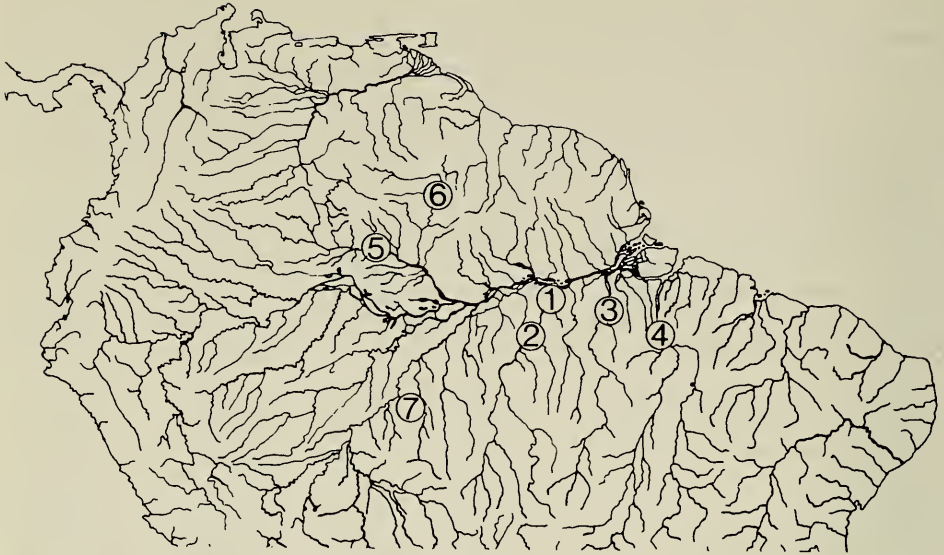
Fig. 2. Map of northern South America showing the distribution of Amazonian Bivibranchia specimens cited in this paper: Bivibranchia notata , new species, localities 1 (MZUSP 28657 holotype and USNM 268049 paratype), and 2 (USNM 268562 and MZUSP 23712 paratypes); Bivibranchia velox (Eigenmann and Myers), locality 3; Bivibranchia protractila Eigenmann, localities 1, and 3 to 7. Localities: 1, Alter do Chão; 2, Barreirinha near São Luís, and Itaituba; 3, Belo Monte; 4, Tucuruí; 5, Rio Marauia; 6, Bem Querer; 7, Rio Machado. See "Comparative Material Examined" and listing of holotype and paratypes for further locality and collection data.

similar to those from the Essequibo system, to specimens with distinct midlateral markings. In its most developed condition the latter pigmentation pattern consists of two patches of chromatophores with irregular borders. The larger, anterior spot occurs on the midlateral surface of the body and is centered distinctly posterior of the vertical through the insertion of the posteriormost dorsal-fin ray. A second smaller elongate pigmentation patch is located on the caudal peduncle and extends posteriorly onto those scales covering the base of the middle rays of the caudal fin. Within a single sample of B. protractila from the Rio Tapajós at Itaituba (USNM 268048) there is found a continuum from plain bodied specimens, through individuals with faint midlateral marks, to those specimens with distinct pigmentation patches. Faint markings in comparable positions are evident on specimens captured in the Rio Negro and Rio Tocantins systems, but no pigmentation patches were obvious in individuals from the Rio Xingu. The factors contributing to this pigmentary variability within and between populations of this species are unknown.