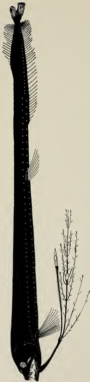
FIG. 1. Eustomias decoratus new species, Holotype, USNM 205494, 255.5 mm SL.