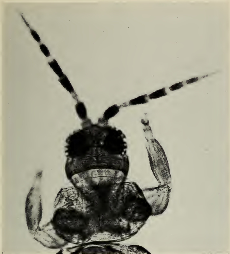
FIG. 3. Heterothrips bolivianus , female. Photograph of head and prothorax.

than transverse sculpture in the triangular metascutum, and in having antennal segment IV entirely brown, not yellowish brown basally.