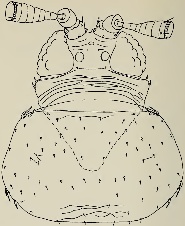
FIG. 1. Scutothrips incaensis , female. Head and prothorax, dorsal aspect.