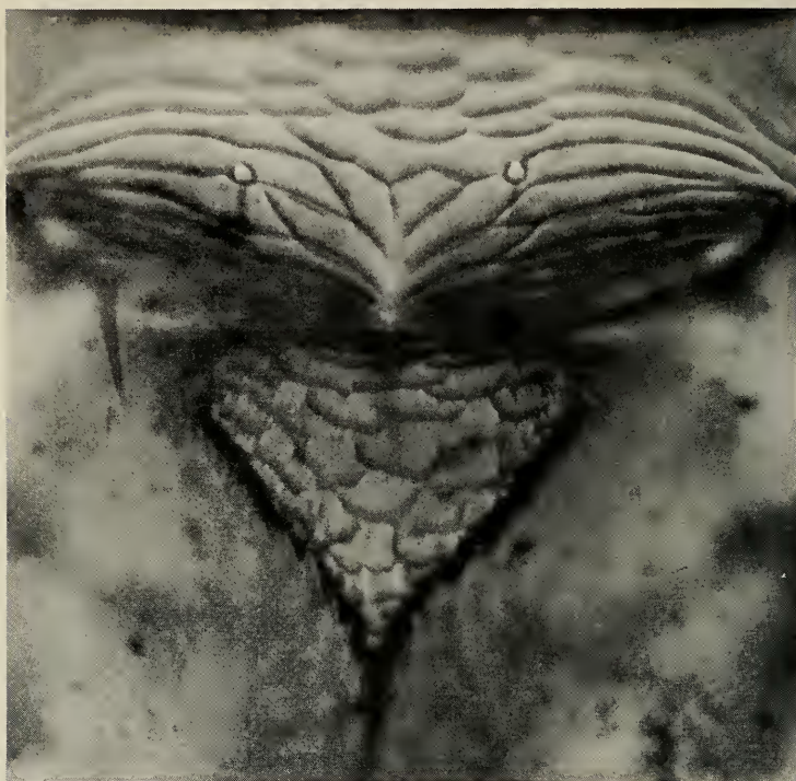
FIG. 2. Scutothrips incaensis , female. Photograph of the metascutum showing scalelike sculpture.

Abdominal tergites I to VII with lateral posterior microtrichia coalesced into platelets. Tergite I lacking median setae, tergites II to V each with a separate group of median microtrichia, tergites VI and VII with median microtrichia extending to lateral plates, tergite VIII with entire posterior margin composed of simple, closely-spaced trichia. Tergites II to VIII with a pair of closely-spaced median setae, becoming wider apart in VII and VIII. Lateral regions of abdominal tergites, except posterior margin, lacking microtrichia. Abdominal sternites II to VI posteriorly with complete row of microtrichia which are fused at base. Abdominal tergite IX with numerous small setae, tergite X with a median posterior slit that is slightly shorter than unsplit basal portion.