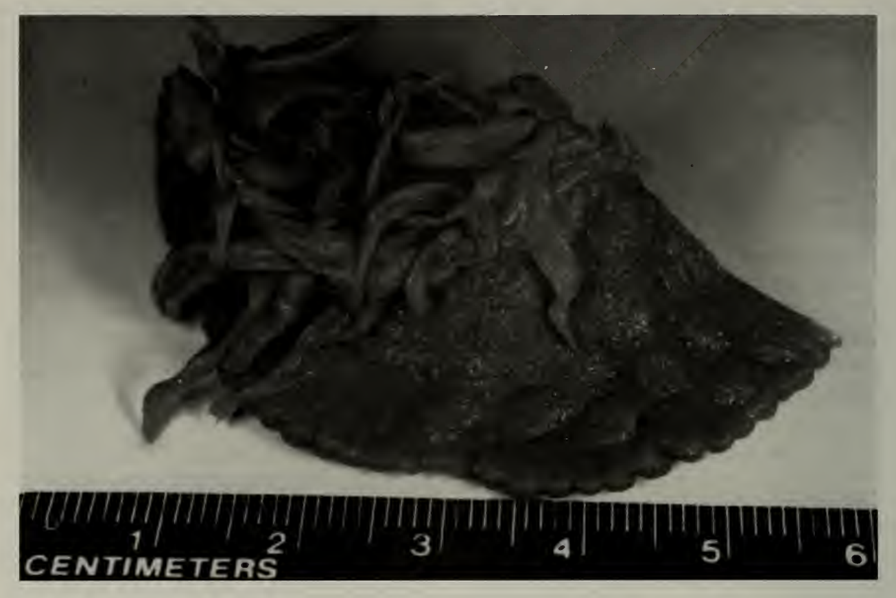
Fig. 1. Maractis rimicarivora : portion of holotype (KUNHM 01149). Note scalloped edge of pedal disc and long, longitudinally-furrowed tentacles. Raised circular spots are inferred to be artifacts—impressions of the perforations in a collecting device or storage container.

20 mm. P. A. Tyler (pers. comm.) remarked in life "the column looks very short" but was difficult to see because animals "always appear to have the [tentacle] crown [directed] to the camera."