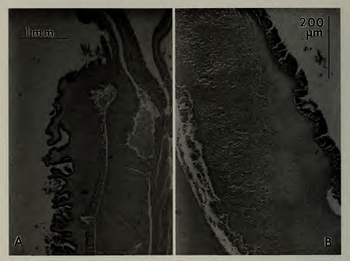
Fig. 2. Mesogleal sphincter muscle of Maractis rimicarivora . A: Longitudinal section at margin of paratype KUNHM 01150. Tentacles have ectodermal longitudinal musculature; outermost tentacle arises at margin. The surface of the animal is thrown into short, complex folds. B: Proximal end of sphincter muscle of holotype (KUNHM 01149).

determinate sex and 5 microscope slides made from it.