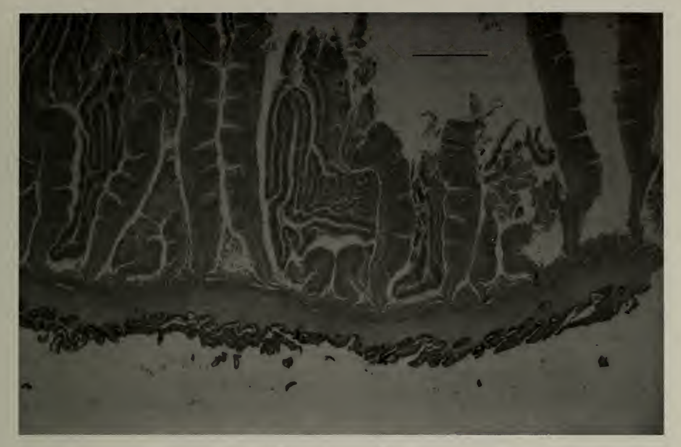
Fig. 3. Cross-section at mid-column level of the holotype (KUNHM 01149). Spermaries associated with mesenteries of the third and fourth (highest) orders are visible. Well-developed retractor muscles are diffuse. Scale bar = 1 mm.