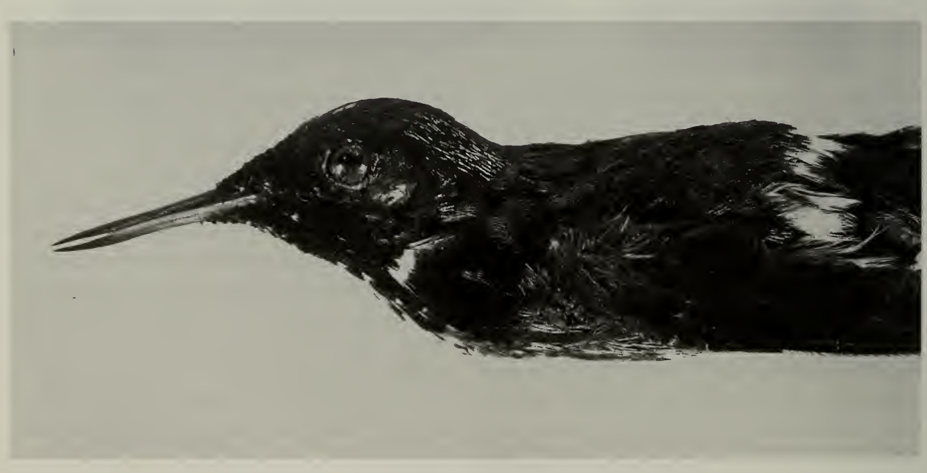
Fig. 3. Lateral view of Elliot's specimen of Popelairia letitiae (AMNH 38060).