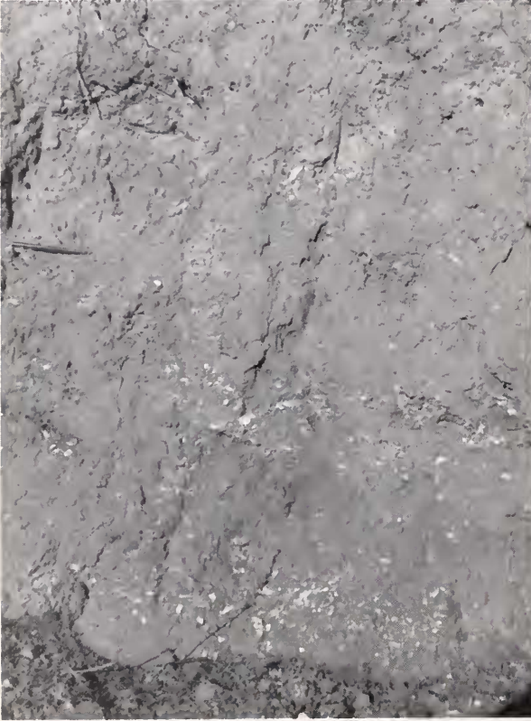
Figure 3. Exposure A at San Diego State College locality 2276. The lower part of the excavation has been covered since the collections were made, and the basal conglomerate and bed 1 are no longer exposed. The abundant fossils in the lower part of the exposure are in bed 2, and the small lens of fossils higher in the exposure is in bed 3. The irregularity and discontinuity of these beds is evident. The pencil is 13 cm long.

near high tide level where few other marine species live, and Cerithidea californica is most common on middle intertidal mud and sand flats where few other species are abundant. Yet at this locality these species are part of a rather diverse assemblage of invertebrates, most of which extend from the lower part of the intertidal zone into deeper water. Because of the relative turbulence of the intertidal zone, even in sheltered environments, such mixing of species from different intertidal levels is not unexpected.