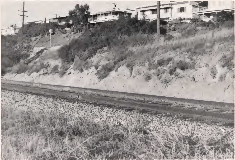
Figure 2. San Diego State College locality 2276 viewed from the southwest. The tracks of the Santa Fe Railroad are in the foreground, and the houses in the background are east of Morena Boulevard. Exposure A is the excavation in the bank directly below the street sign near the left edge of the view; exposure B is the smaller excavation at the right edge of the view. The lower parts of both excavations were filled in after the collections were made and before this photograph was taken. Fossils that have weathered out on the bank are visible between the two exposures.

Fossils are distributed irregularly throughout the section above the lower part of the conglomerate. Collections were made from three rather arbitrarily defined stratigraphic intervals in order to evaluate temporal changes in the fauna. Bed 1 is a highly fossiliferous stratum in the upper 15 to 30 cm of the conglomerate (Fig. 3). Bed 2 is a poorly defined fossiliferous interval from 30 to 45 cm thick directly overlying bed 1. Bed 3 is an irregular stratum 30 cm thick and 15 cm above the top of bed 2.