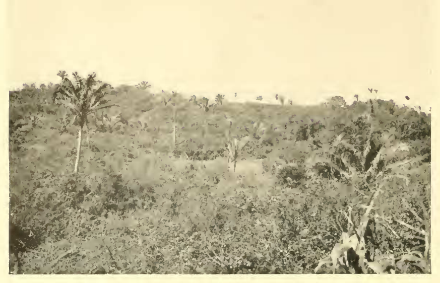
Abandoned fields or milpas grown with scrub that will eventually become second-growth forest. Tres Zapotes. March 25, 1939.