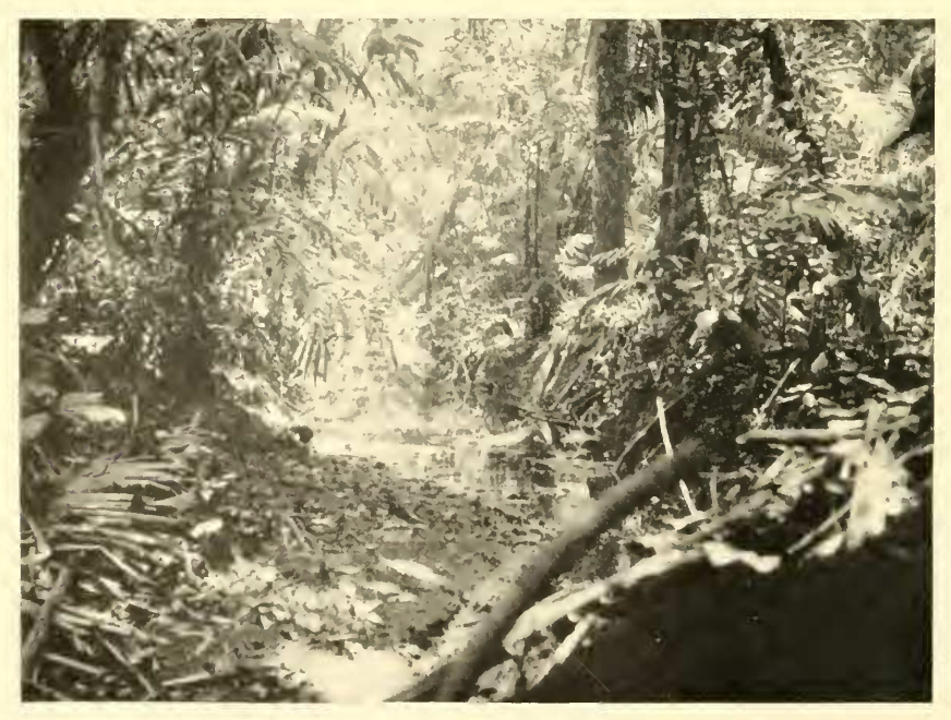
2. Primitive forest along the Arroyo Corredor, near Tres Zapotes. April 4, 1939.