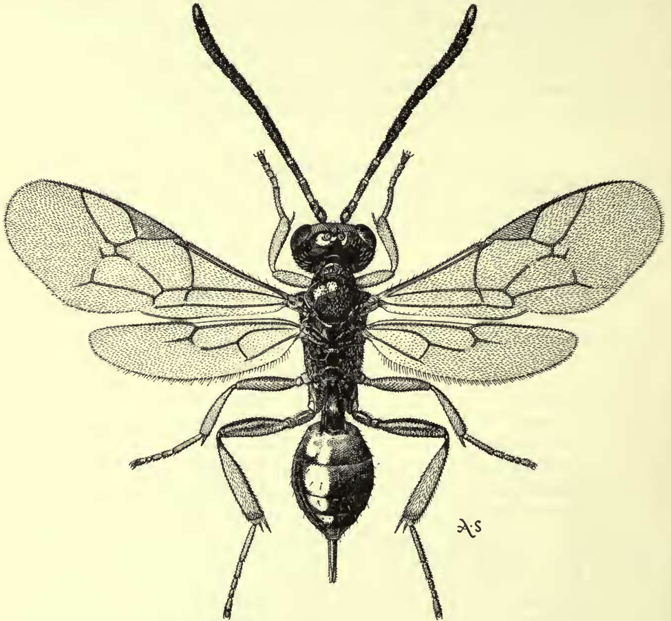
FIG. 1. Gunopaches crassus sp. n. ♀

Head: temples roundly narrowed behind the eyes; POL: OOL 2:0.6; malar space long, length of malar space: breadth of base of mandible = 6:5; genal sulcus not impressed, represented by a line of coriaceous sculpture; genal carina meeting the hypostomal carina far behind