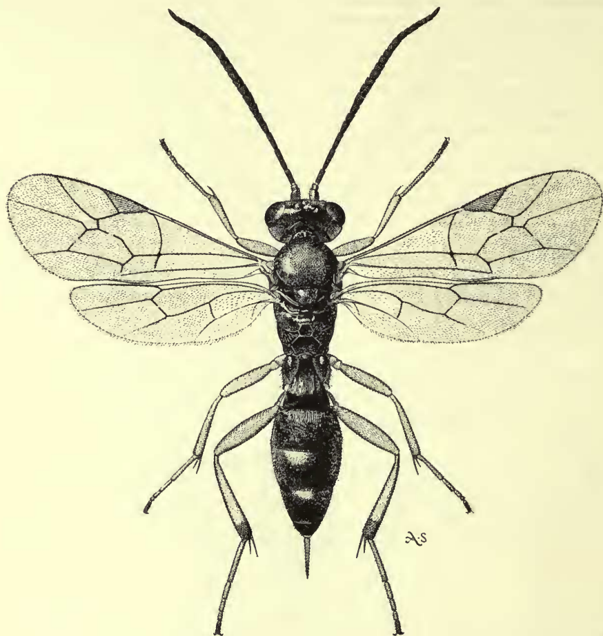
FIG. 2. Pemon proximum sp. n. ♀.

Gaster shining, with tergite 1 subapically striate punctate, rather broadly smooth and polished apically; tergite 2 with a crenulate, transverse furrow at two-thirds the distance from the base, polished behind this, coarsely punctate basally, the punctures in part fusing into striae, the punctures becoming sparser towards the furrow; tergite 3 with a weak transverse impression, sparsely, finely punctate basally; the following segments without clear punctures.