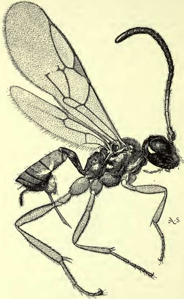
FIG. 3. Stygera rufipes sp. n. ♀.

scattered hairs laterally; tergite 2 rather broad, faintly, coarsely coriaceous, sparsely hairy laterally, with one or two hairs subbasally, a row of sparse hairs centrally and a row of sparse hairs at the apical two-thirds; laterotergites of segment 2 somewhat narrow; rest of the gaster narrowing from the apex of tergite 2 to the apex of the gaster, polished; tergite 3 with sparse