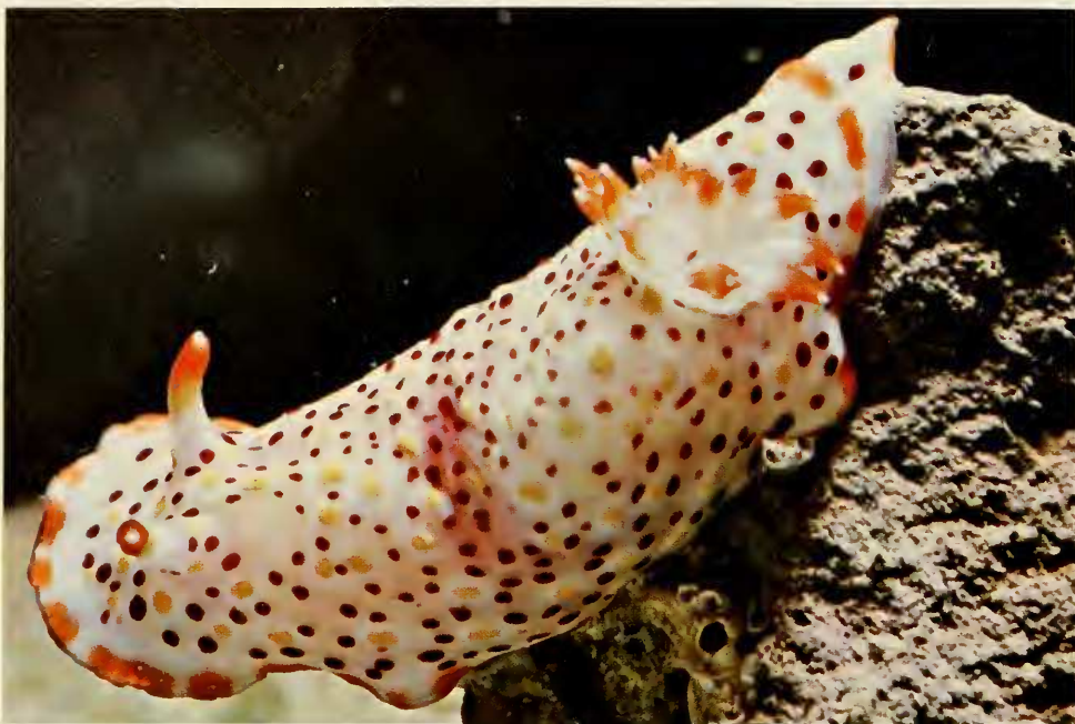
PLATE 1a. Chromodoris norrisi from Cerralvo Island, Baja California, Mexico.