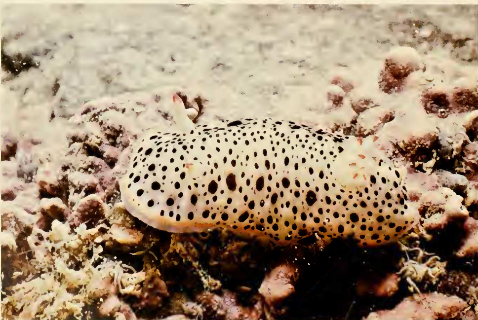
PLATE 1b. Chromodoris banksi from Puertecitos, Baja California, Mexico.