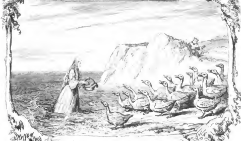
Marziella feeding the Geese