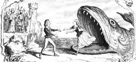
NENNILLO & NENNELLA