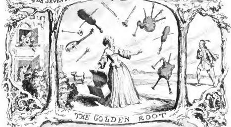
THE GOLDEN ROOT