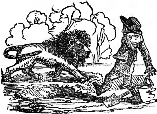
A PIONEER, MEETING AN OLD SETTLER.