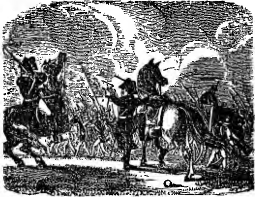
PREPARING FOR BATTLE.