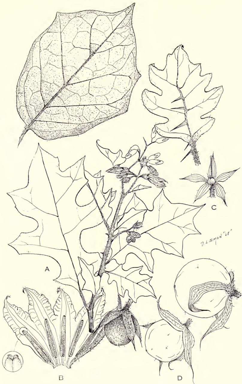
FIG. 19. Solanum torvum . A, habit and leaves, \times \frac{1}{2} ; B, corolla dissected, \times 2 ; C, calyx and pistil, \times 2 ; D, mature fruit, \times 2 .