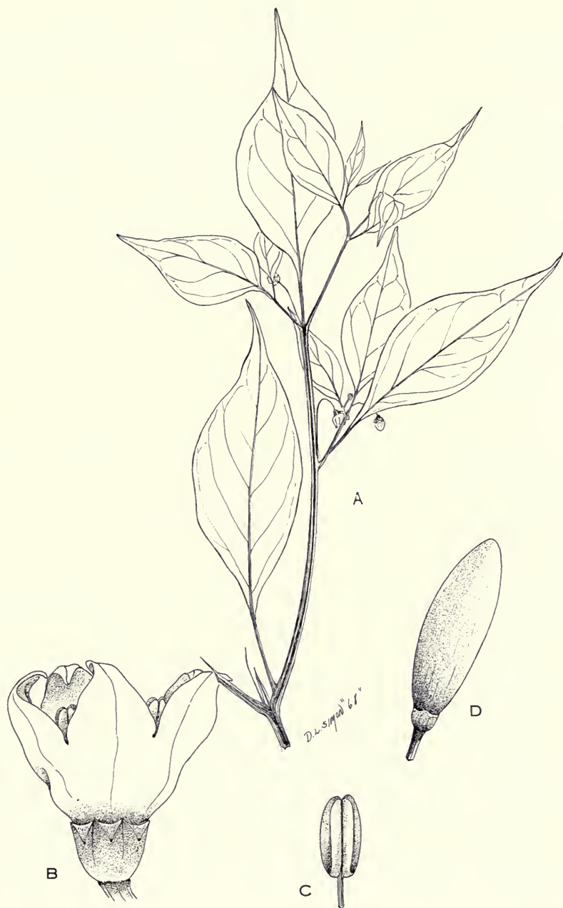
FIG. 4. Capsicum frutescens . A, habit, \times \frac{1}{2} ; B, flower, \times 5 ; C, anther, abaxial view, \times 5 ; D, mature fruit, \times 2 .