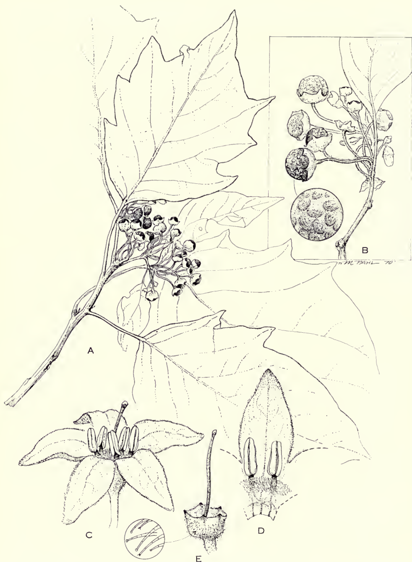
FIG. 20. Witheringia stramonifolia . A, habit, \times \frac{1}{2} ; B, fruiting inflorescence, \times 1\frac{1}{2} ; C, flower, \times 3 ; D, part of dissected corolla showing stamens, \times 4 ; E, calyx and style, \times 3 .