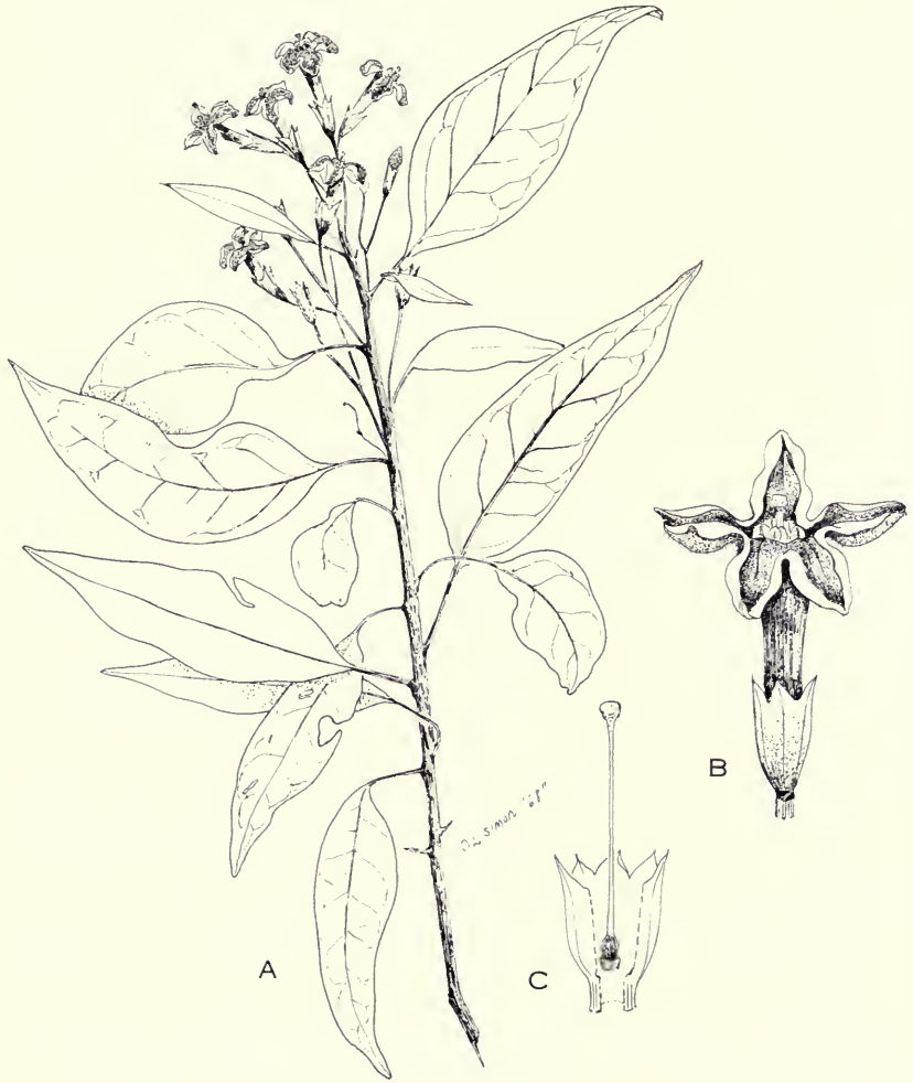
FIG. 5. Cestrum formosum . A, habit, \times \frac{1}{2} ; B, flower, \times 2 ; C, calyx dissected, \times 2 .

A shrub 2.5 m. tall, the young branches puberulent, soon glabrate; leaves narrowly elliptic, 7.5–17.5 cm. long, 3–5.5 cm. wide, glabrous above, sparsely puberulent on the veins below, apex acuminate, the base acute or obtuse; petioles 1.5–2 cm. long, glabrous; inflorescences terminal and axillary, paniculate, puberulent, the bracts minute, caducous; pedicels 3–5 mm. long; calyx 3–3.5 mm. long, green, the lobes about 0.5 mm. long, broadly deltoid, slightly mucronate, ciliolate; corolla pale yellow, the tube sometimes tinged with maroon, 16–17 mm. long, glabrous externally, gradually ampliate above, the lobes 3.5–4 mm. long, broadly ovate and mucronate, inconspicuously papillate externally; filaments 4.5–5 mm.