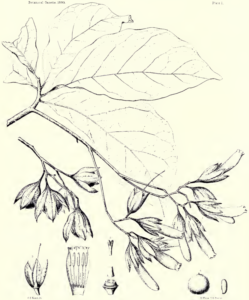
FIG. 10. Juanulloa mexicana . Plate I from the Botanical Gazette for the year 1893, used by permission of the University of Chicago. Magnifications may be calculated from the description.

petiole 0.5–1.5 mm. long; inflorescence cymose, pseudoterminal or lateral; pedicels thick, 1–2 cm. long, densely covered with ochraceous, very short simple and branched hairs; calyx narrowly campanulate, 2.5–3 cm. long, costate, orange, densely covered with ochraceous, very short simple and minute branched hairs, red within, cleft for half its length or more, the lobes oblong-lanceolate or lanceolate, equal or unequal, acute; corolla red or orange, 4–5 cm. long, densely covered with yellowish very short simple and minute branched hairs, the lobes 2–2.5 mm.