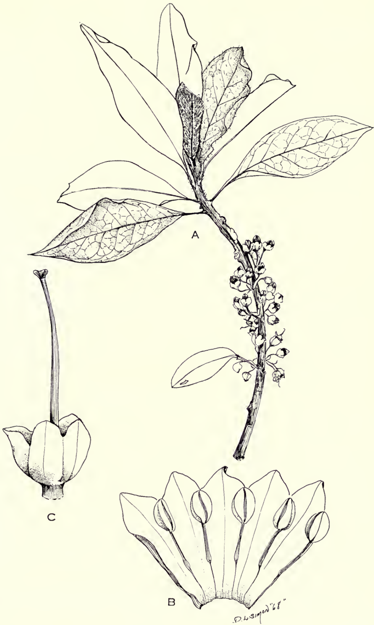
FIG. 1. Acnistus arborescens . A, habit, \times \frac{1}{2} ; B, corolla dissected, \times 4 ; C, calyx and style, \times 5 .