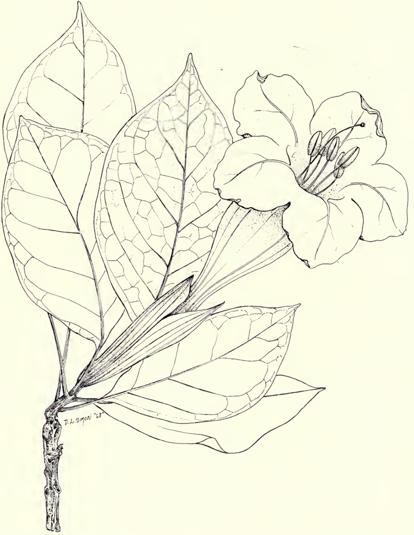
FIG. 18. Solandra grandiflora . Habit and flower, \times \frac{1}{2} .