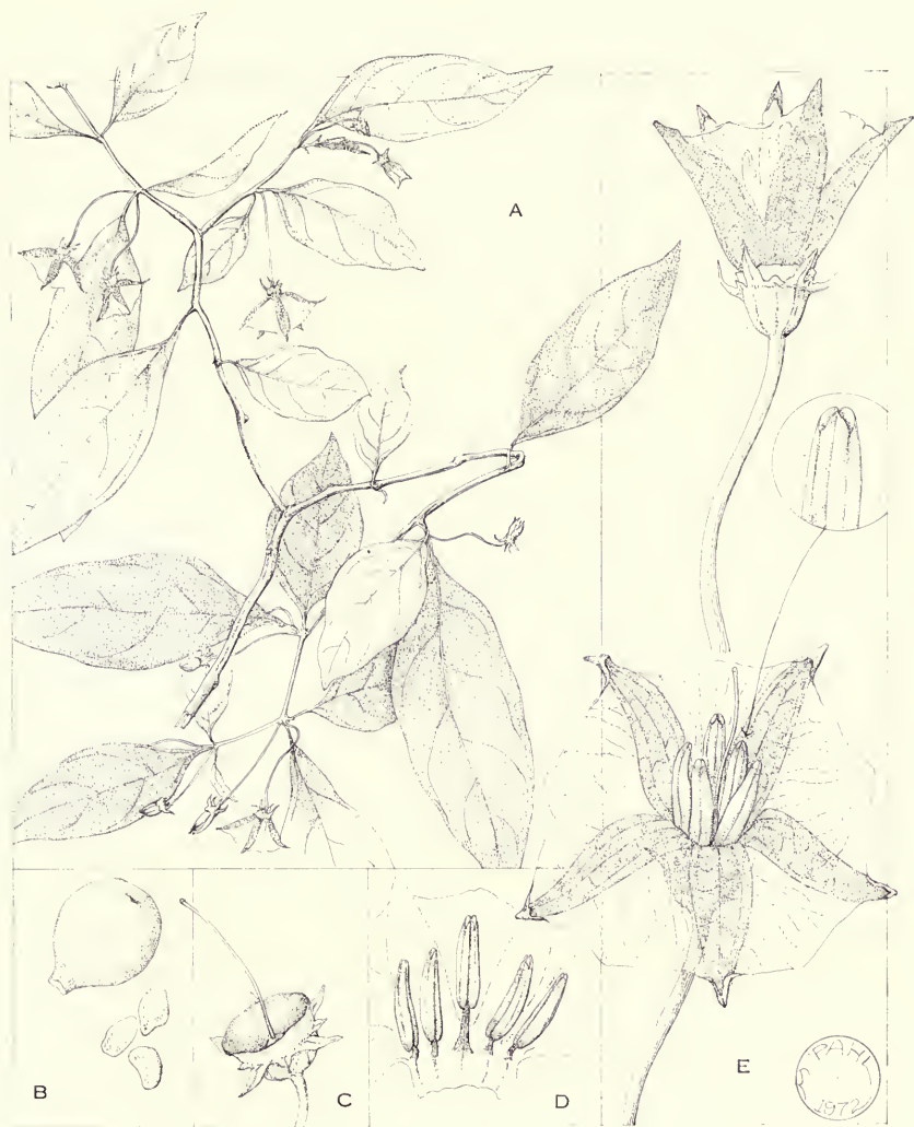
FIG. 12. Lycianthes connata . A, branch, \times \frac{1}{2} ; B, fruit, \times 2 , and seeds, \times 3 ; C, calyx, \times 2\frac{1}{2} ; D, dissected corolla, \times 2\frac{1}{2} ; E, flower and detail of anther, \times 2\frac{1}{2} .

shape, unequal in size, sparsely and inconspicuously pubescent above and below, the hairs incurved on the veins below or glabrous, the larger leaves elliptic, 7-15 (-26.5) cm. long, 3-4(-8) cm. wide, acuminate, attenuate at the base, equal or unequal, the petioles 3-10(-40) mm. long; smaller leaves 4-9 cm. long, 2-3.5 cm. wide; inflorescences consisting of 1-4 flowers, the pedicels slender, 2.5-5 cm. long; calyx campanulate, 2.5-3 mm. long, glabrous or sparsely pubescent, with 10 subulate-linear appendages, alternately subequal, connate at their bases, spreading or slightly reflexed, the long appendages 2.5-4 mm. long, the short ones 1-2 mm. long;