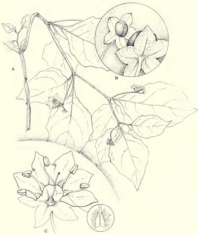
FIG. 9. Jaltomata procumbens . A, habit, \times \frac{1}{2} ; B, fruit and calyx, \times 2 and \times 3 ; C, corolla dissected, \times 3 .