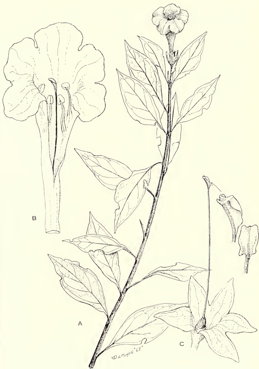
FIG. 3. Brunfelsia nycaginoides . A, habit, \times \frac{1}{2} ; B, corolla dissected, \times 2 ; C, calyx dissected, \times 2 .