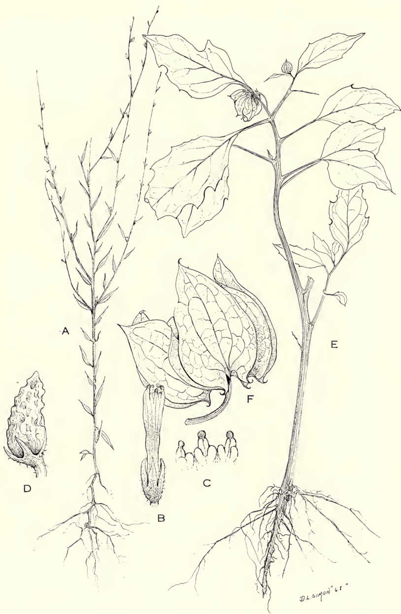
FIG. 15. Melananthus guatemalensis . A, habit, \times \frac{1}{2} ; B, flower, \times 10 ; C, corolla lobes, detail, \times 20 ; D, mature fruit, \times 10 . Nicandra physalodes . E, habit, \times \frac{1}{2} ; F, fruiting calyx, \times \frac{1}{2} .