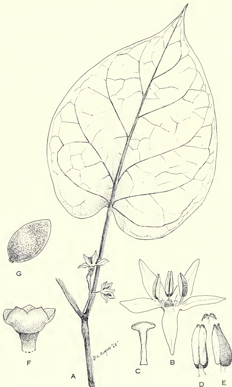
FIG. 7. Cyphomandra rojasiana . A, habit, \times \frac{1}{2} ; B, corolla, \times 1\frac{1}{2} ; C, style, \times 2\frac{1}{2} ; D, stamen, abaxial view, \times 2\frac{1}{2} ; E, stamen, lateral view, \times 2\frac{1}{2} ; F, calyx, \times 3 ; G, mature fruit, \times \frac{1}{2} .