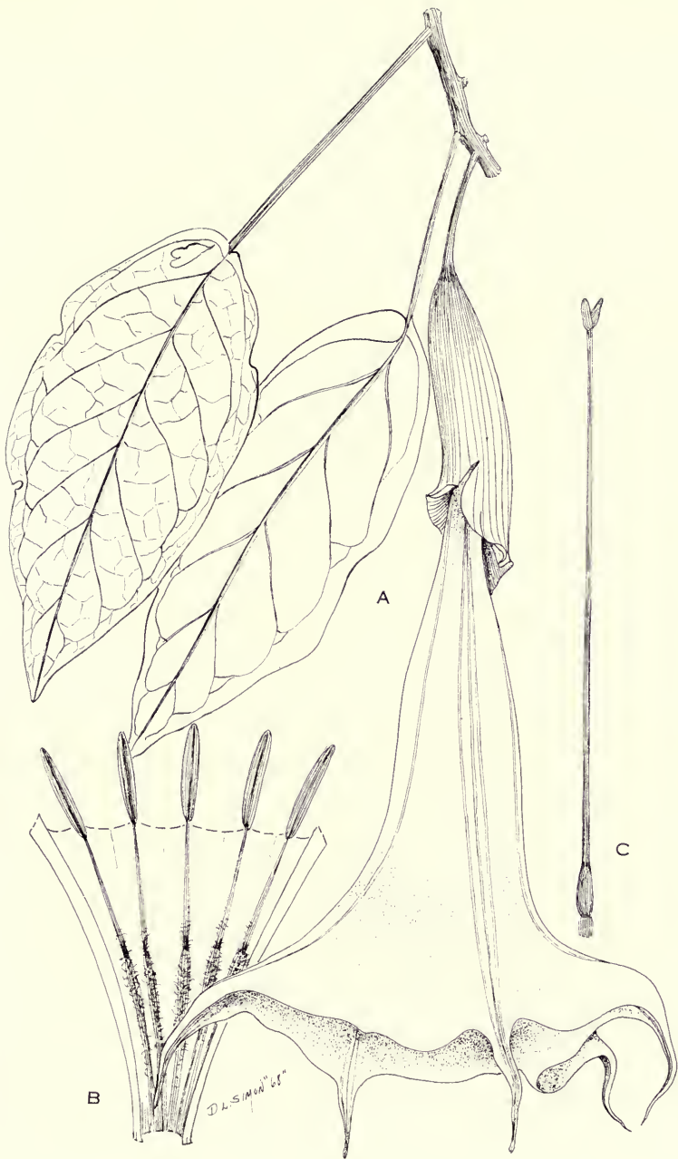
FIG. 8. Datura candida . A, habit, \times \frac{1}{2} ; B, portion of corolla showing stamens, \times \frac{1}{2} ; C, pistil, \times \frac{1}{2} .