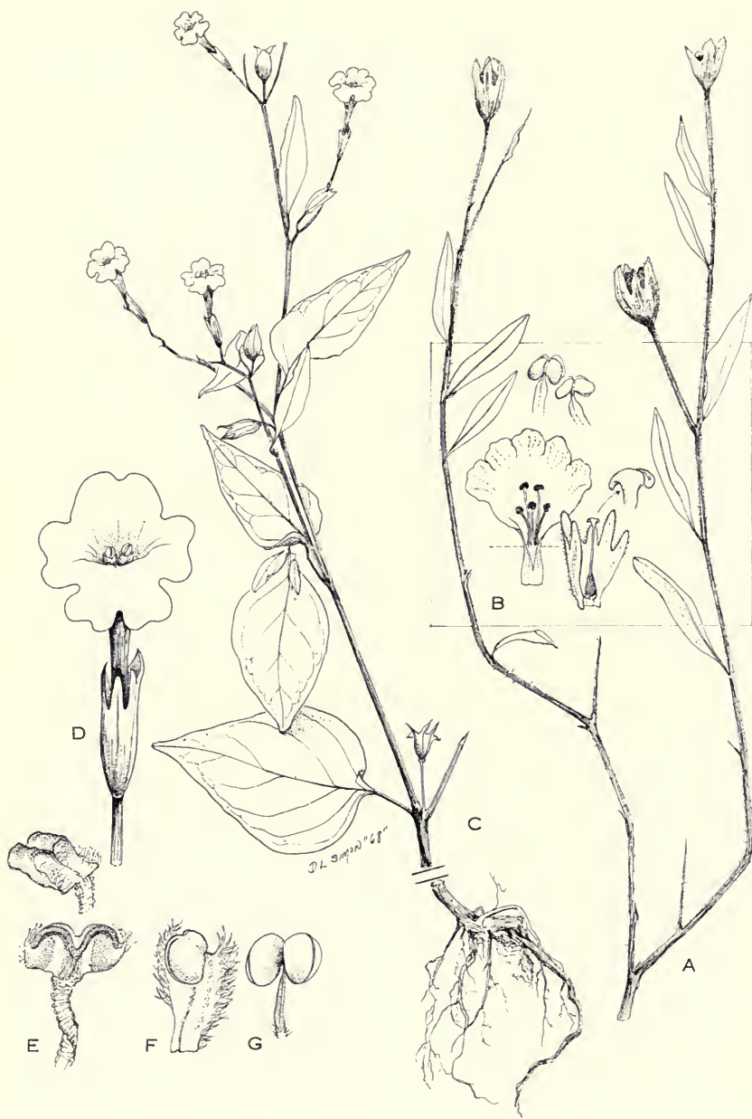
FIG. 2. Bouchetia erecta . A, habit, \times 1 ; B, corolla dissected, \times 1\frac{1}{2} , calyx dissected, \times 1\frac{1}{2} . Browallia americana . C, habit, \times \frac{1}{2} ; D, flower, \times 2 ; E, style and stigma, \times 10 ; F, upper stamen, \times 10 ; G, lower stamen, \times 10 .