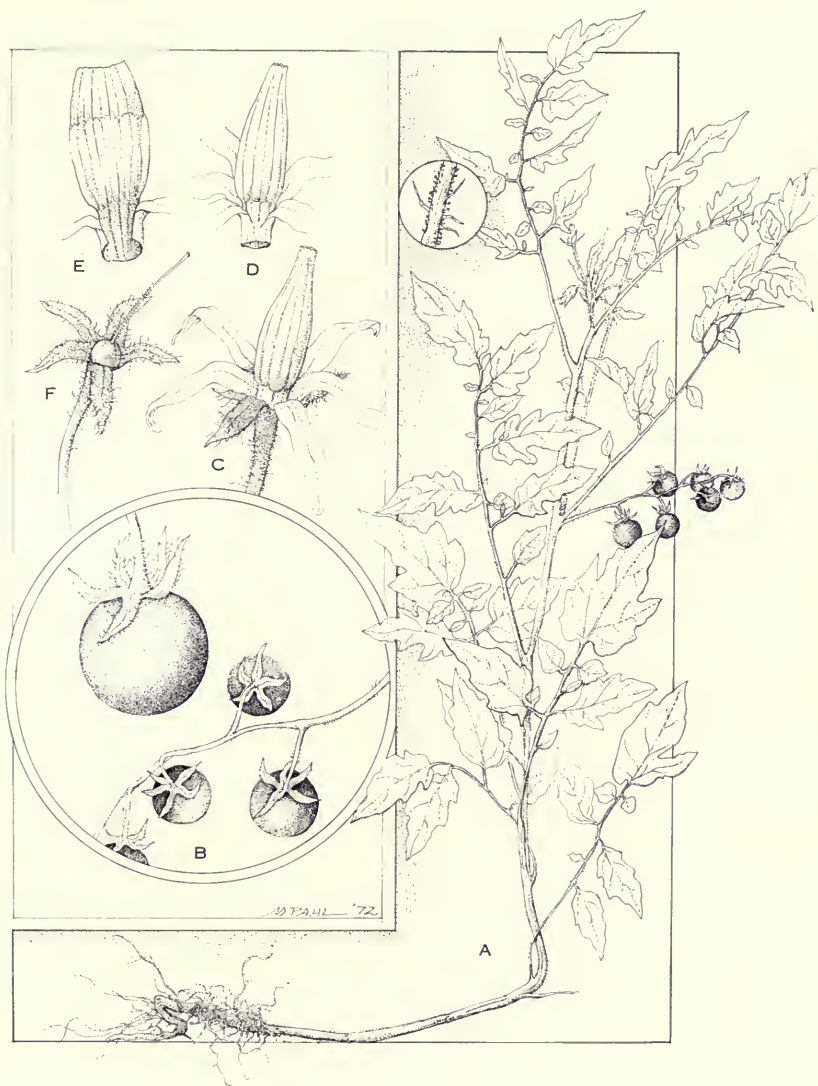
FIG. 13. Lycopersicon esculentum var. cerasiforme . A, habit, \times \frac{1}{2} ; B, fruit, \times 1 and \times 1\frac{1}{2} ; C, flower, \times 3\frac{1}{2} ; D, corolla showing connivent anthers, \times 3\frac{1}{2} ; E, stamen tube dissected showing sterile tips of the anthers, \times 3\frac{1}{2} ; F, calyx and pistil, \times 3\frac{1}{2} .