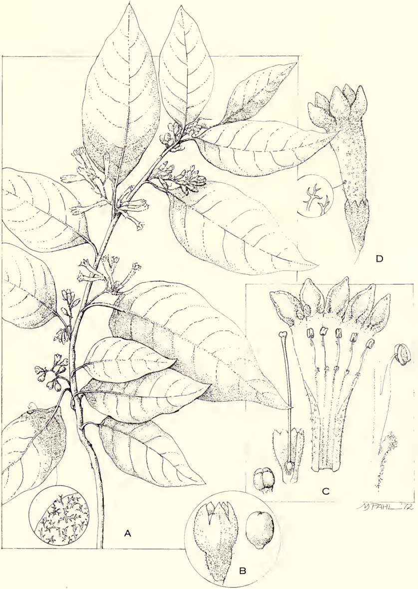
FIG. 6. Cestrum mortonianum . A, branch, \times \frac{1}{2} ; B, calyx with immature fruit, \times 3\frac{1}{2} ; C, dissected corolla, \times 2\frac{1}{2} , with detail of ovary, \times 5 , and stamen, \times 6 ; D, corolla with detail of hairs, \times 4 .