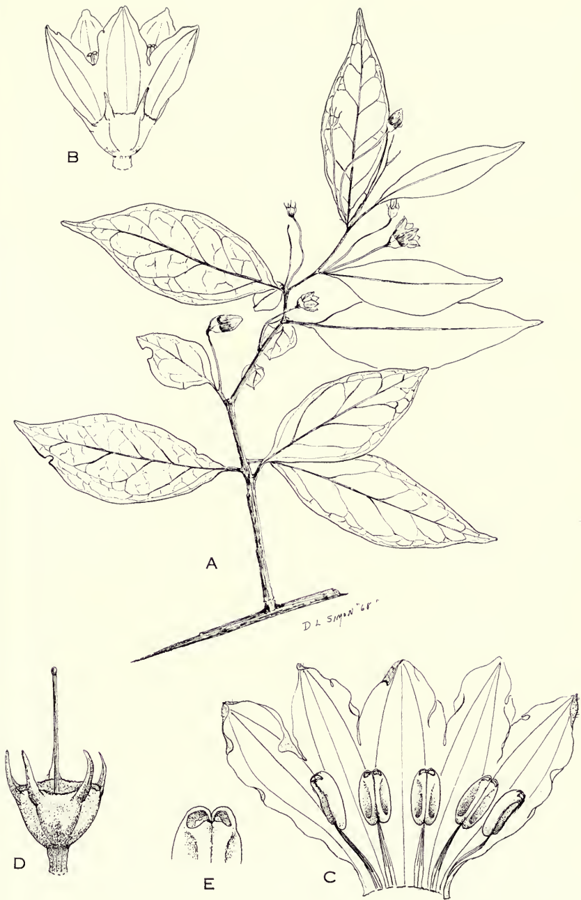
FIG. 11. Lycianthes barbatula . A, habit, \times \frac{1}{2} ; B, flower, \times 2 ; C, corolla dissected, \times 3 ; D, calyx, style, and stigma, \times 3 ; E, anther, abaxial view, \times 6 .