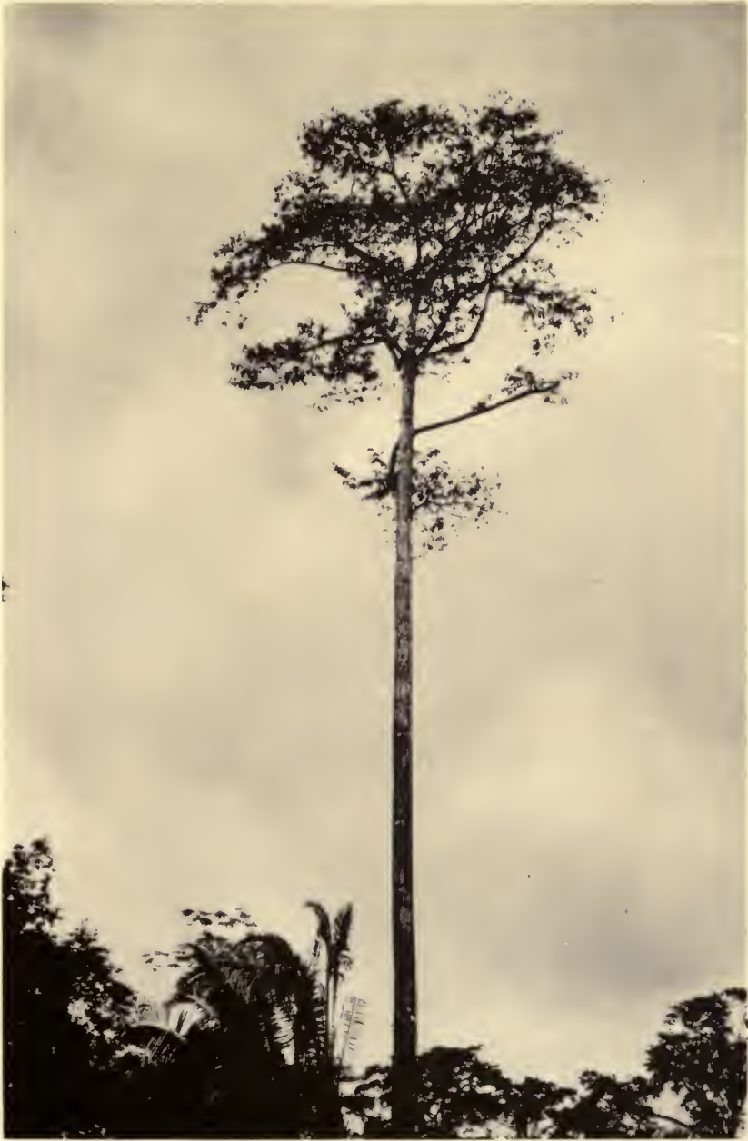
A TYPICAL BANAK TREE