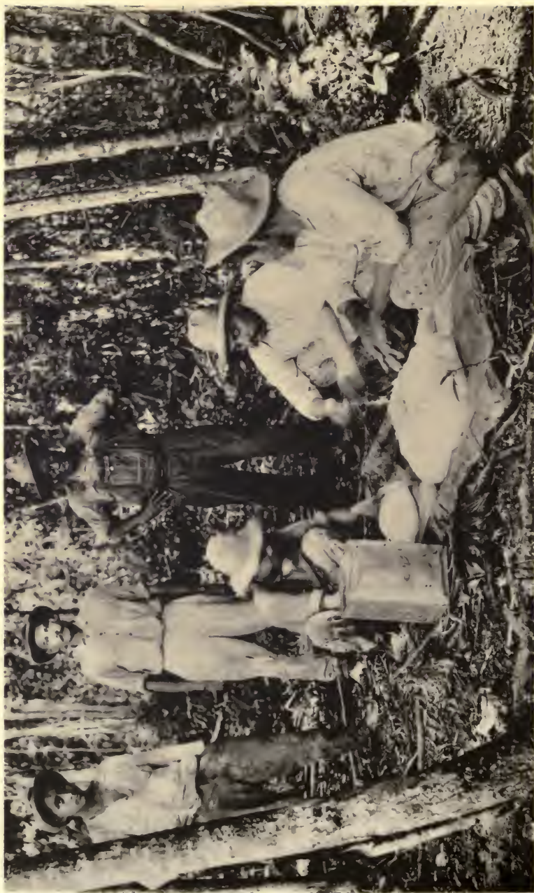
KNEADING CHICLE GUM INTO BLOCKS