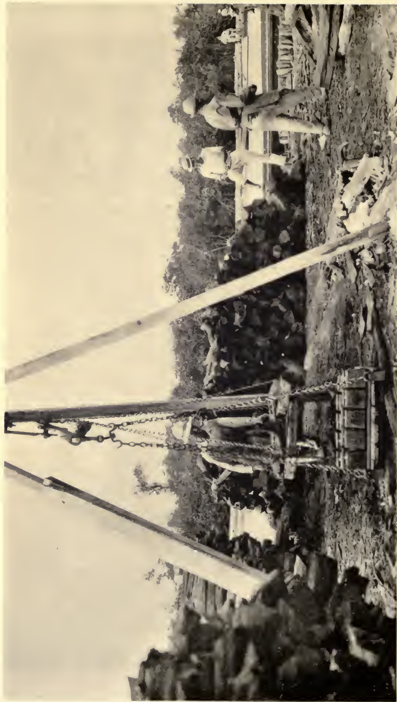
WEIGHING LOGWOOD AT BELIZE