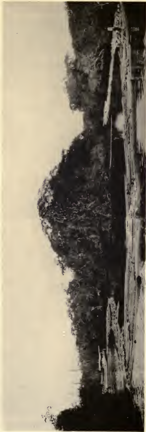
RAFTING MAHOGANY LOGS DOWN NEW RIVER