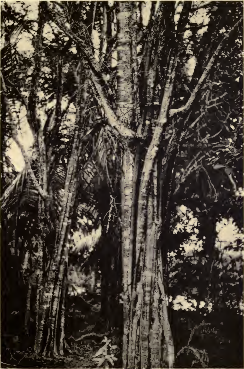
LOGWOOD TREES ALONG BELIZE RIVER