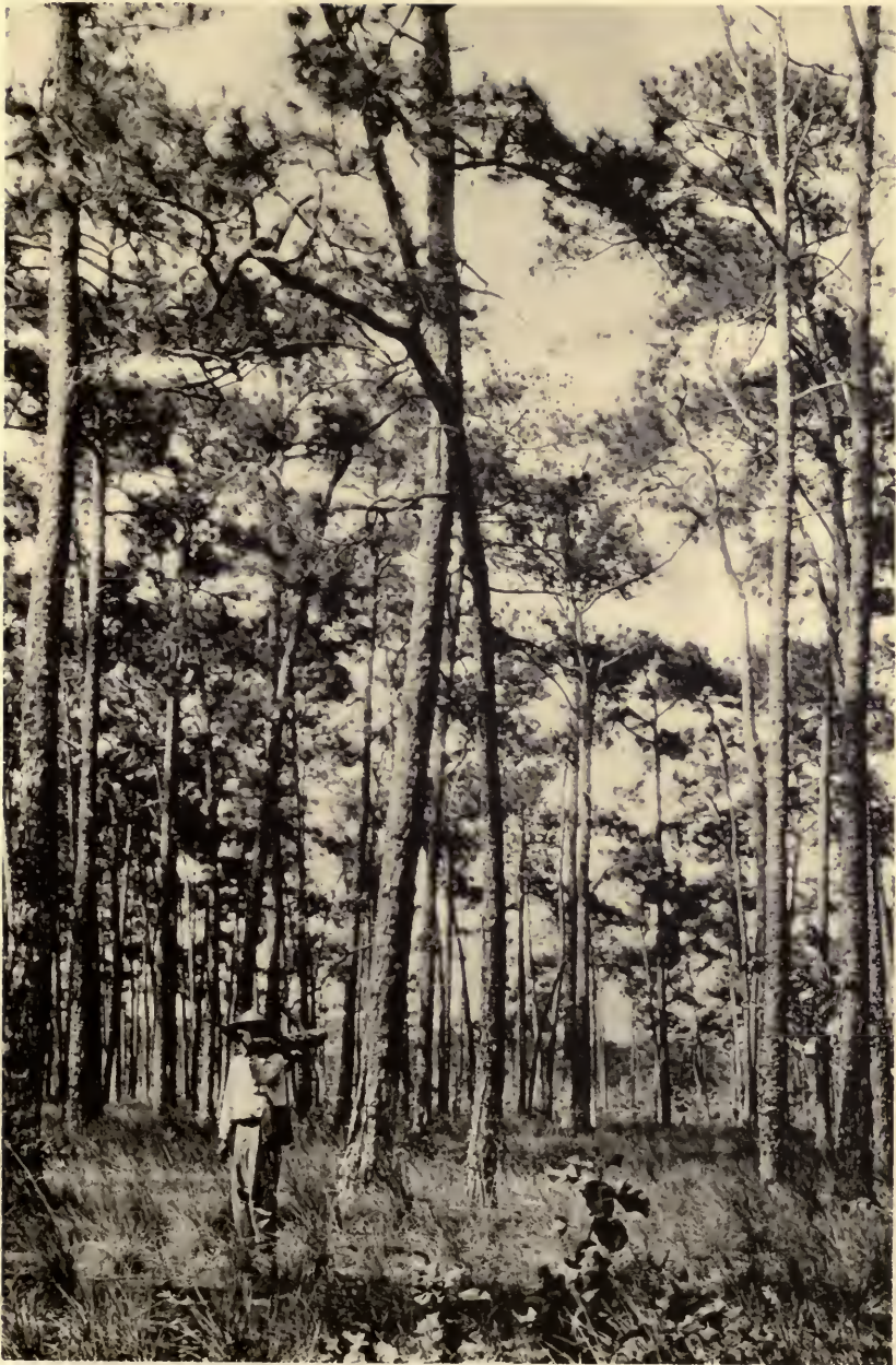
STAND OF PINE IN STANN CREEK DISTRICT