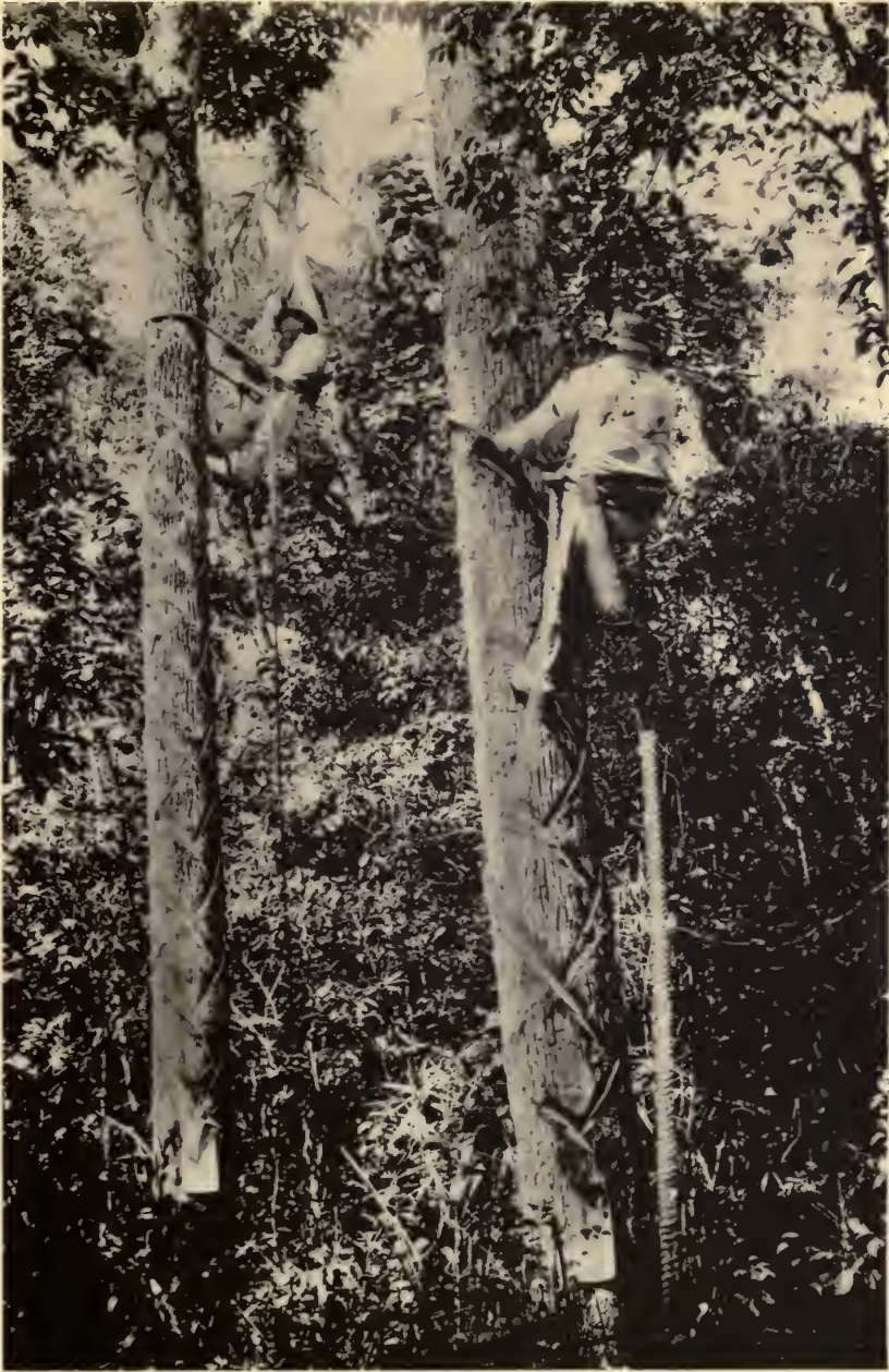
CHICLEROS TAPPING SAPODILLA TREES