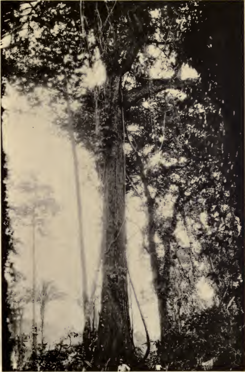
AN OLD HONDURAS MAHOGANY TREE