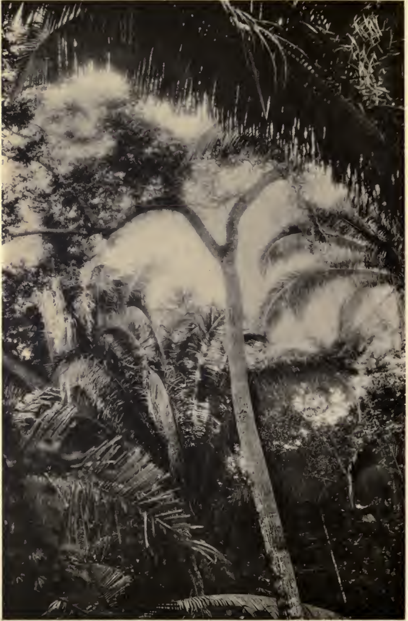
CEDAR TREE SURROUNDED BY COHUNE PALMS