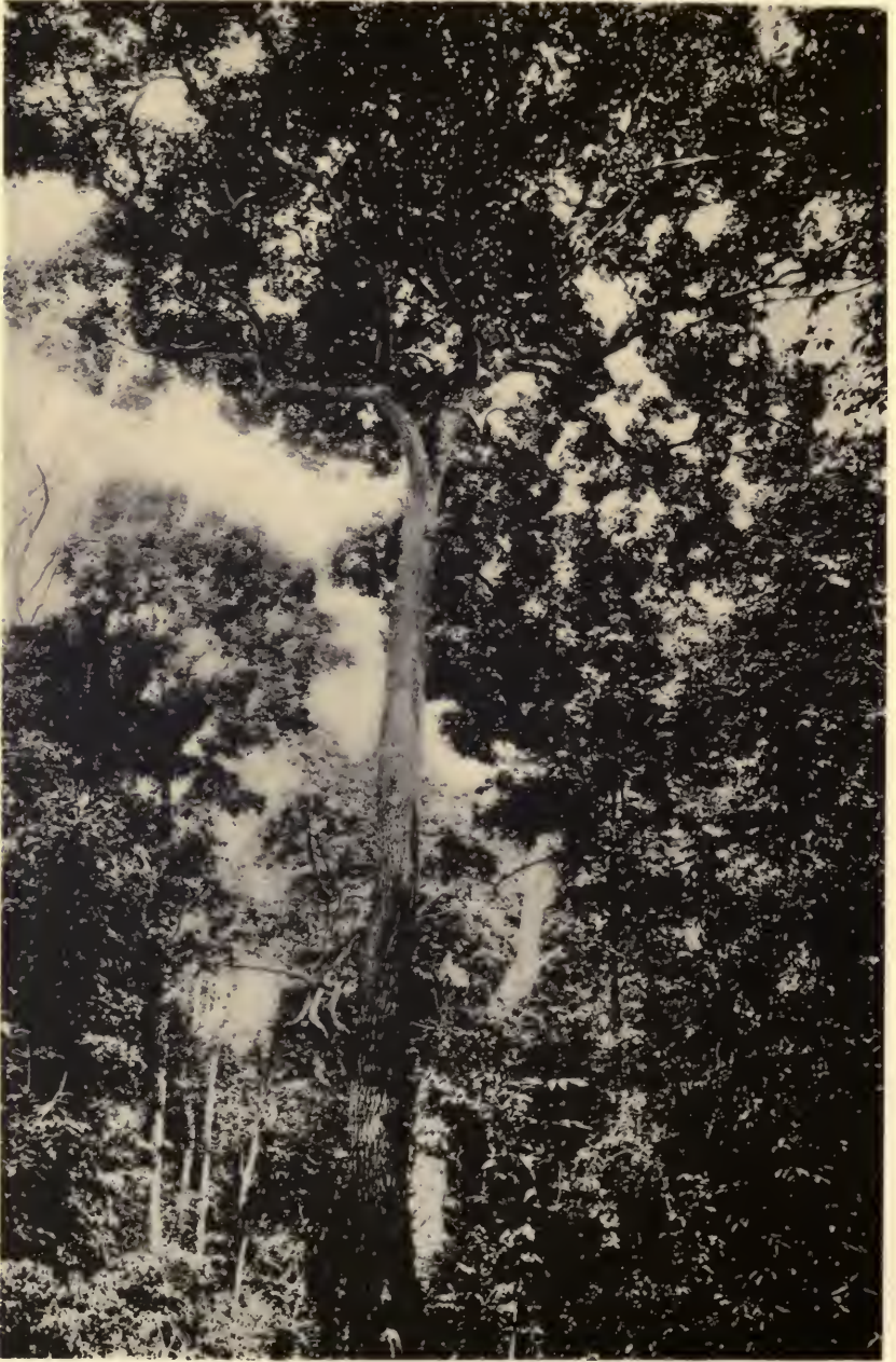
PRIMARY INTERMEDIATE FOREST, WITH SAPODILLA TREE IN FOREGROUND