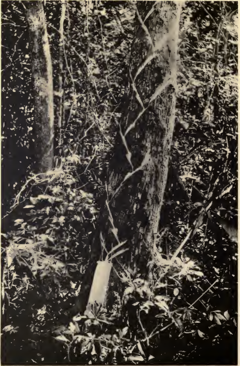
SAPODILLA TREE WITH CHICLE BAG ATTACHED