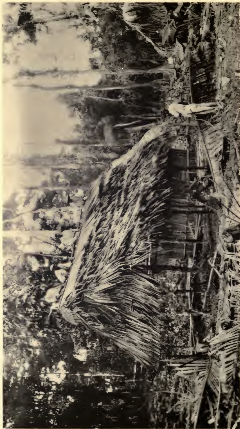
THATCHING A NATIVE HUT WITH COHUNE PALM