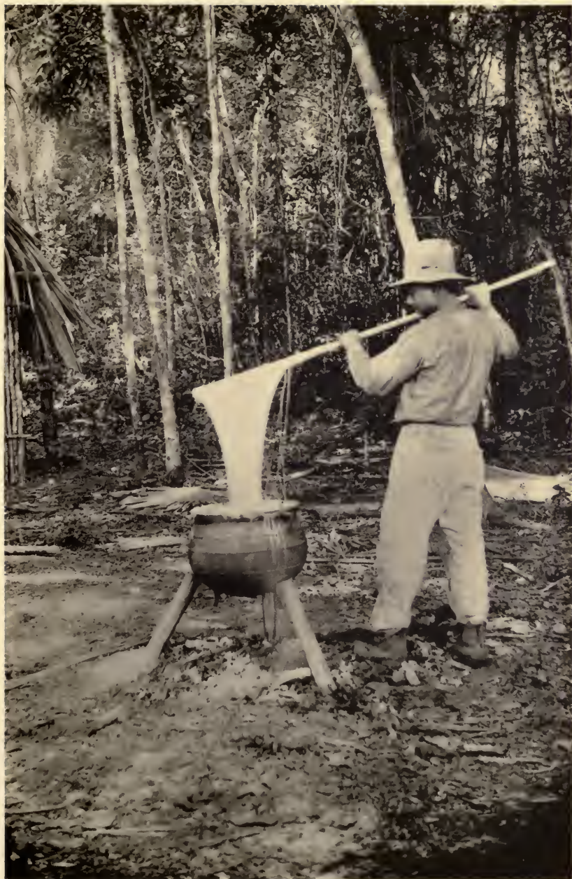
COOKING SAPODILLA LATEX