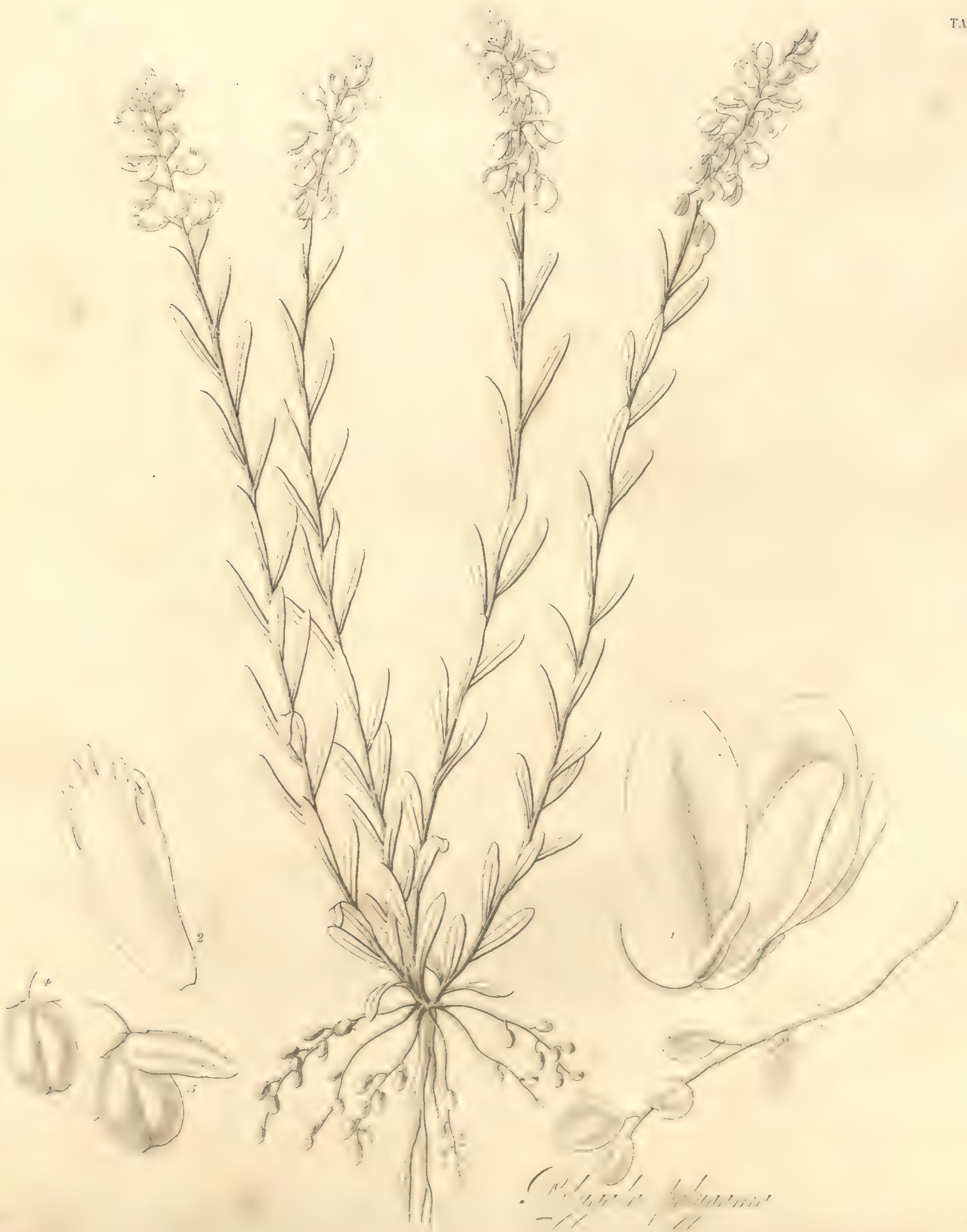
Colymba rotundifolia — 11 —