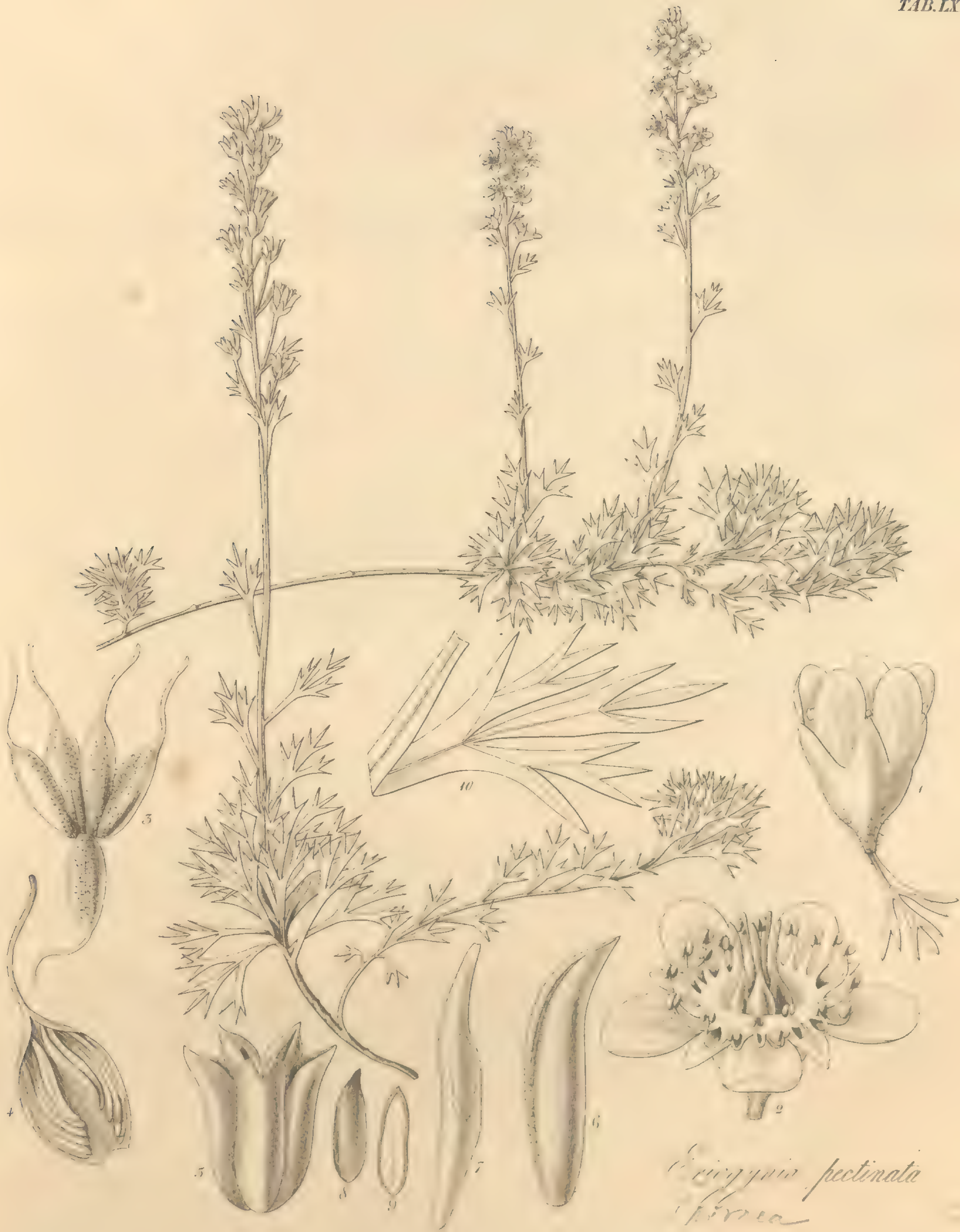
Eryngium pectinatum Pursh