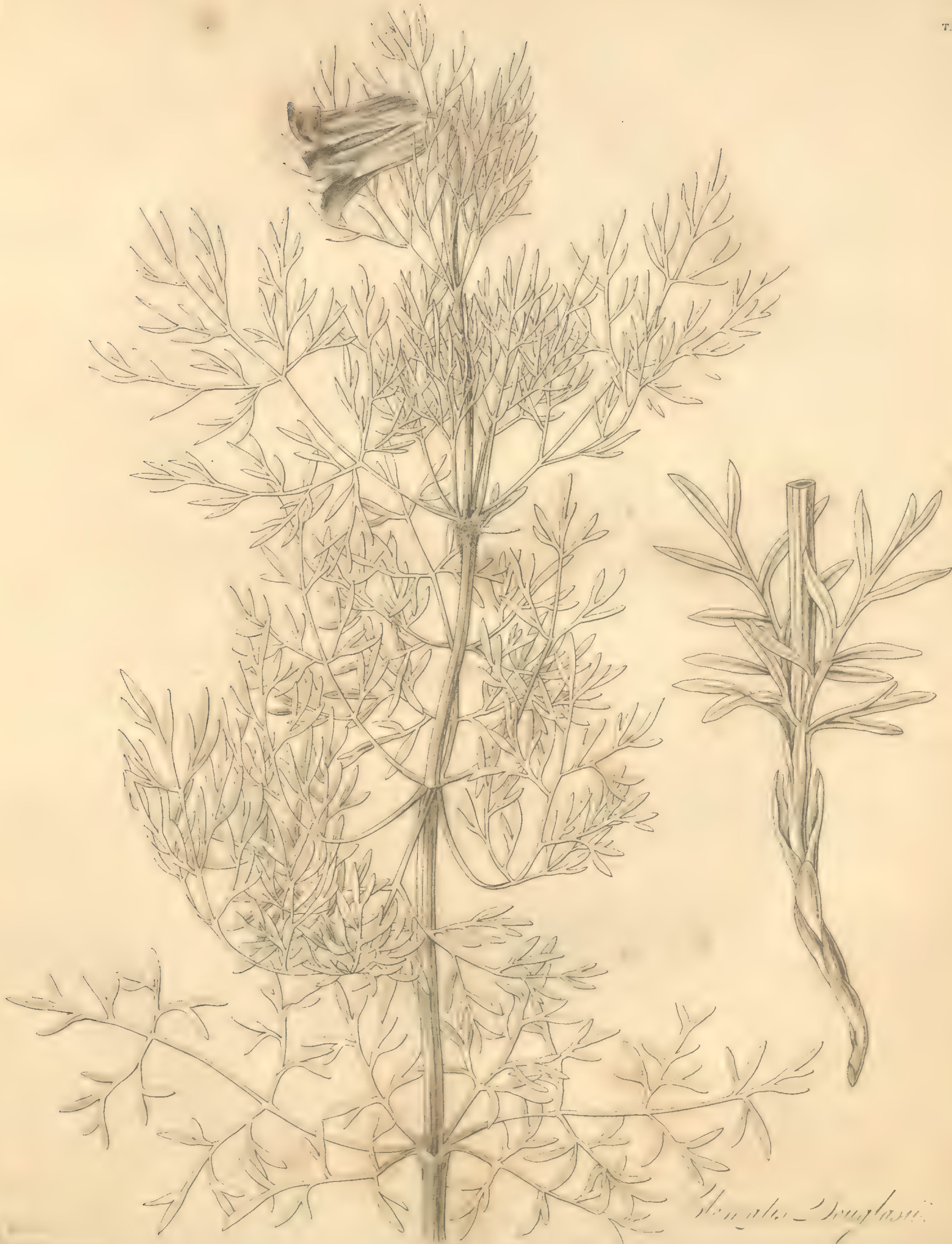
Stenota - Douglasii