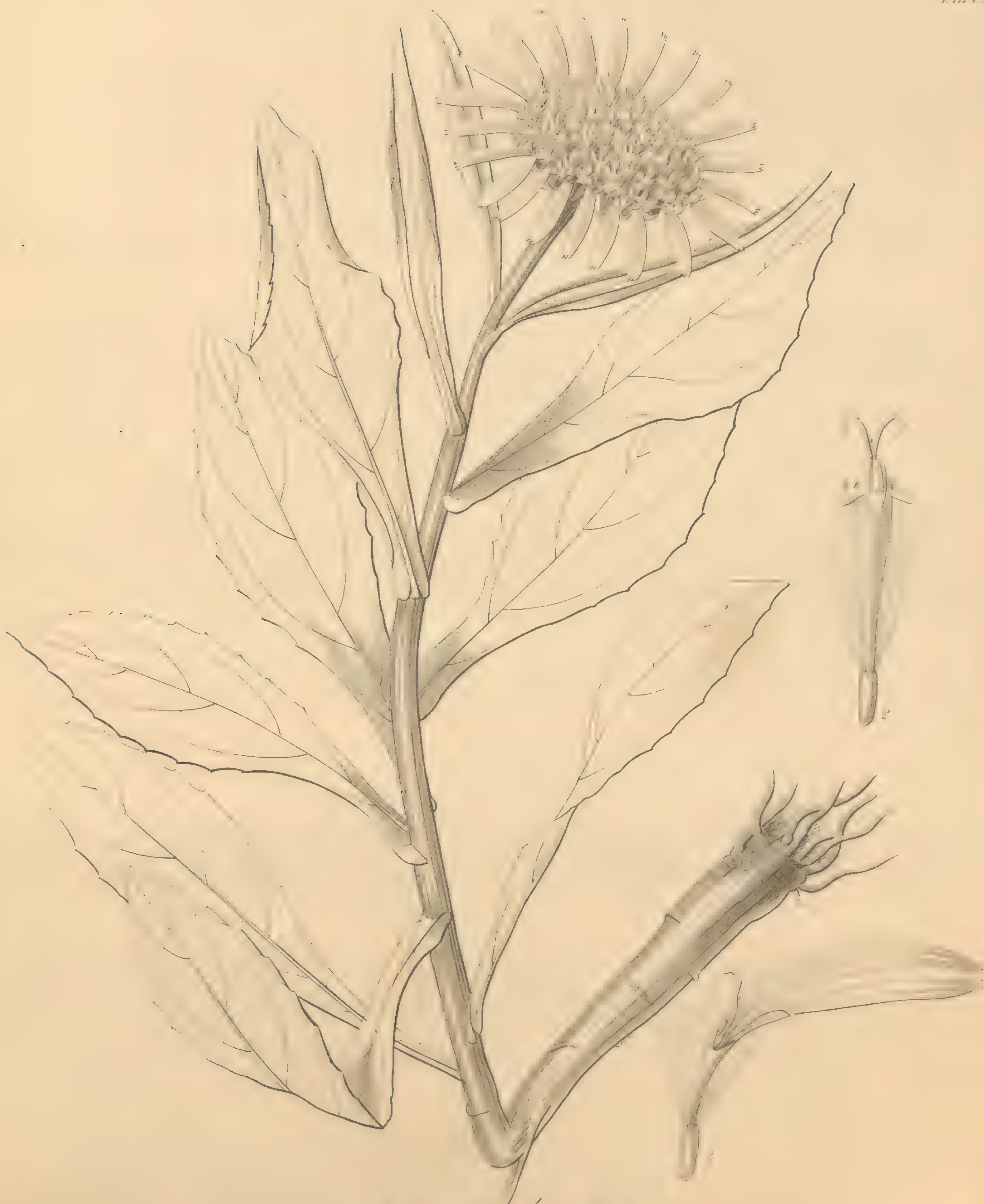
Senecio jacobinae Torr.