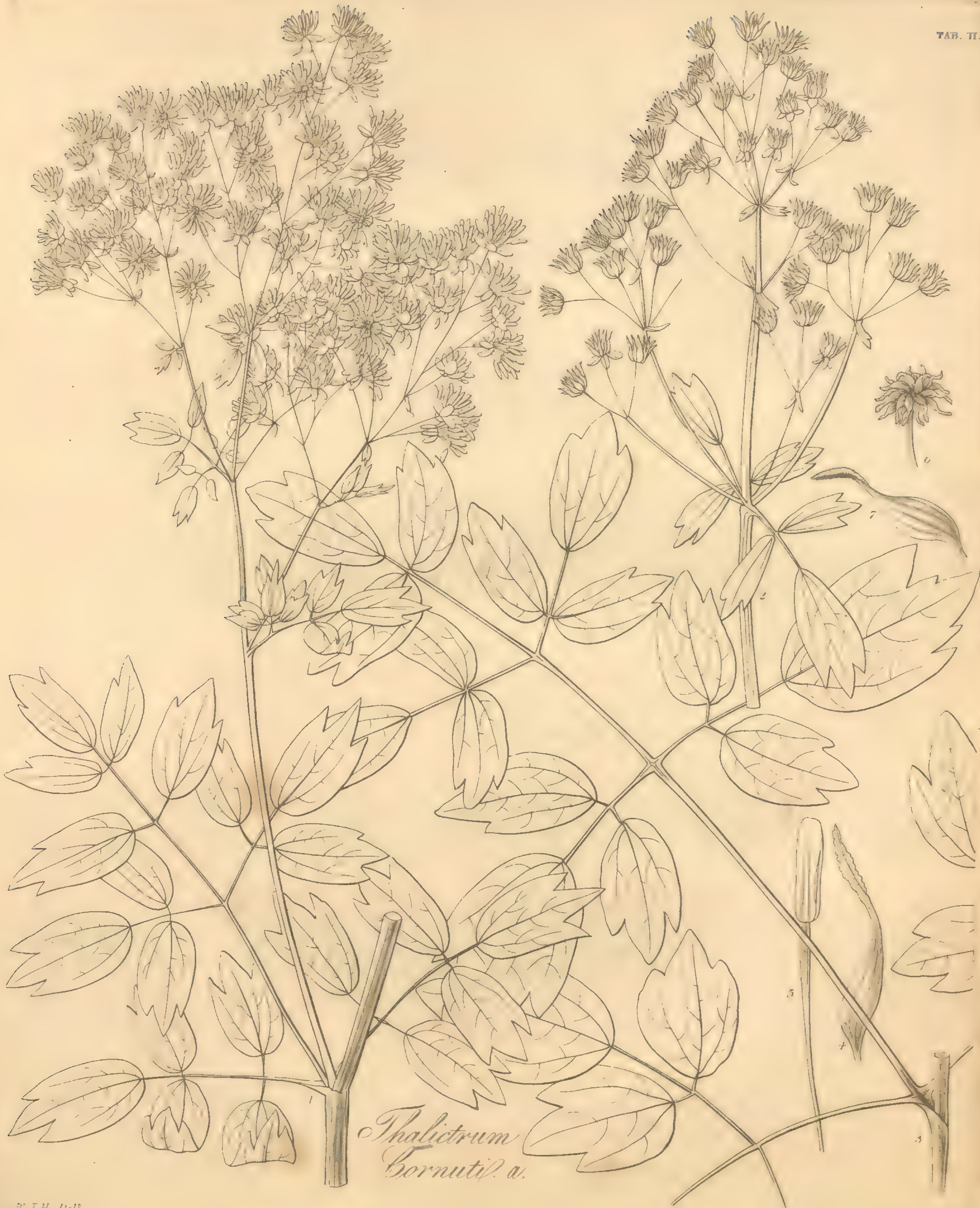
Thalictrum Cornuti? a.