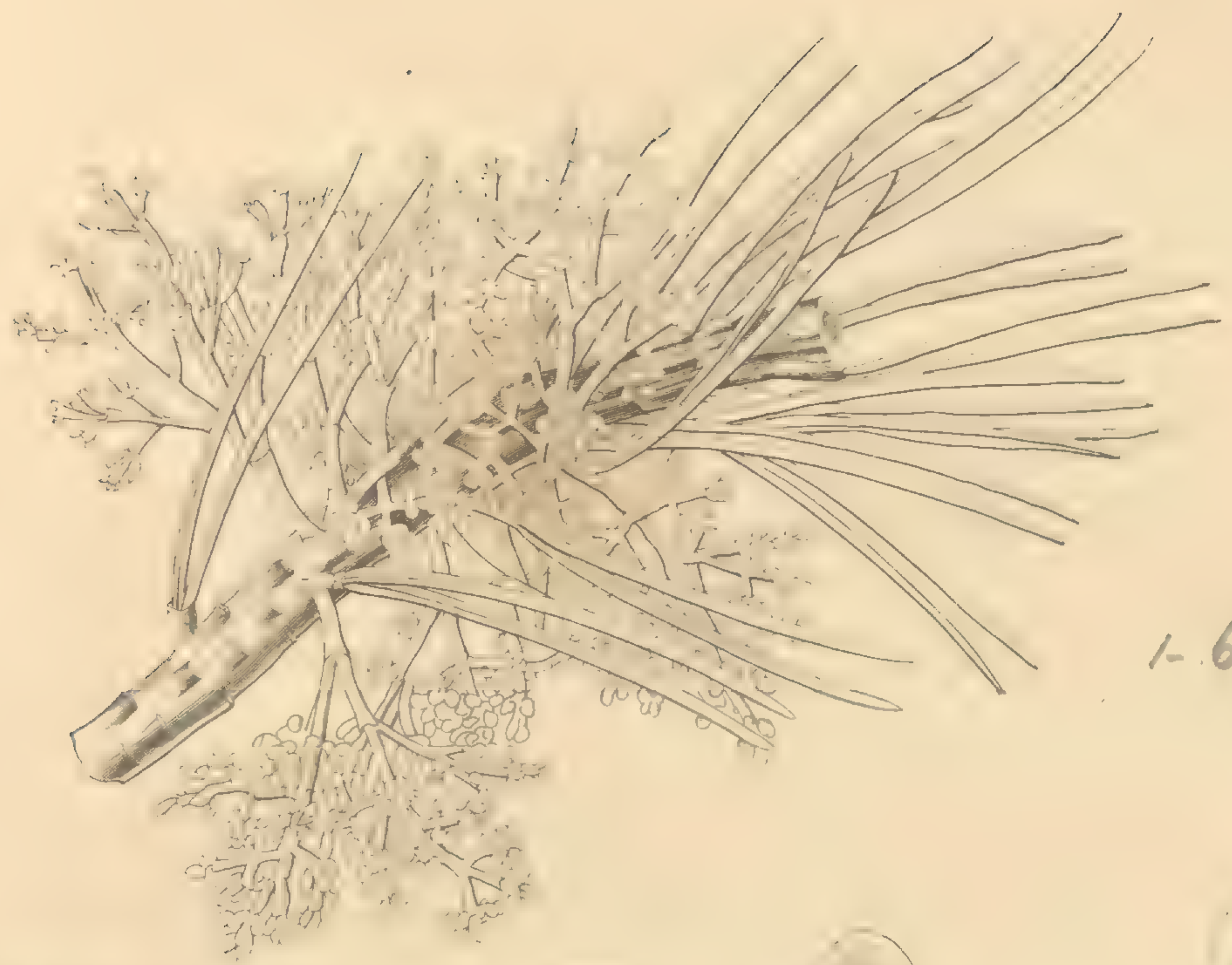
1-6 on Pinus Banksiana ♂