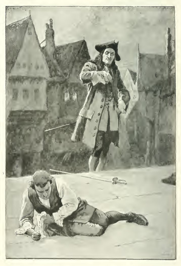
"BUT I'M GRIEVED I HAVE NO VIRGIL,"