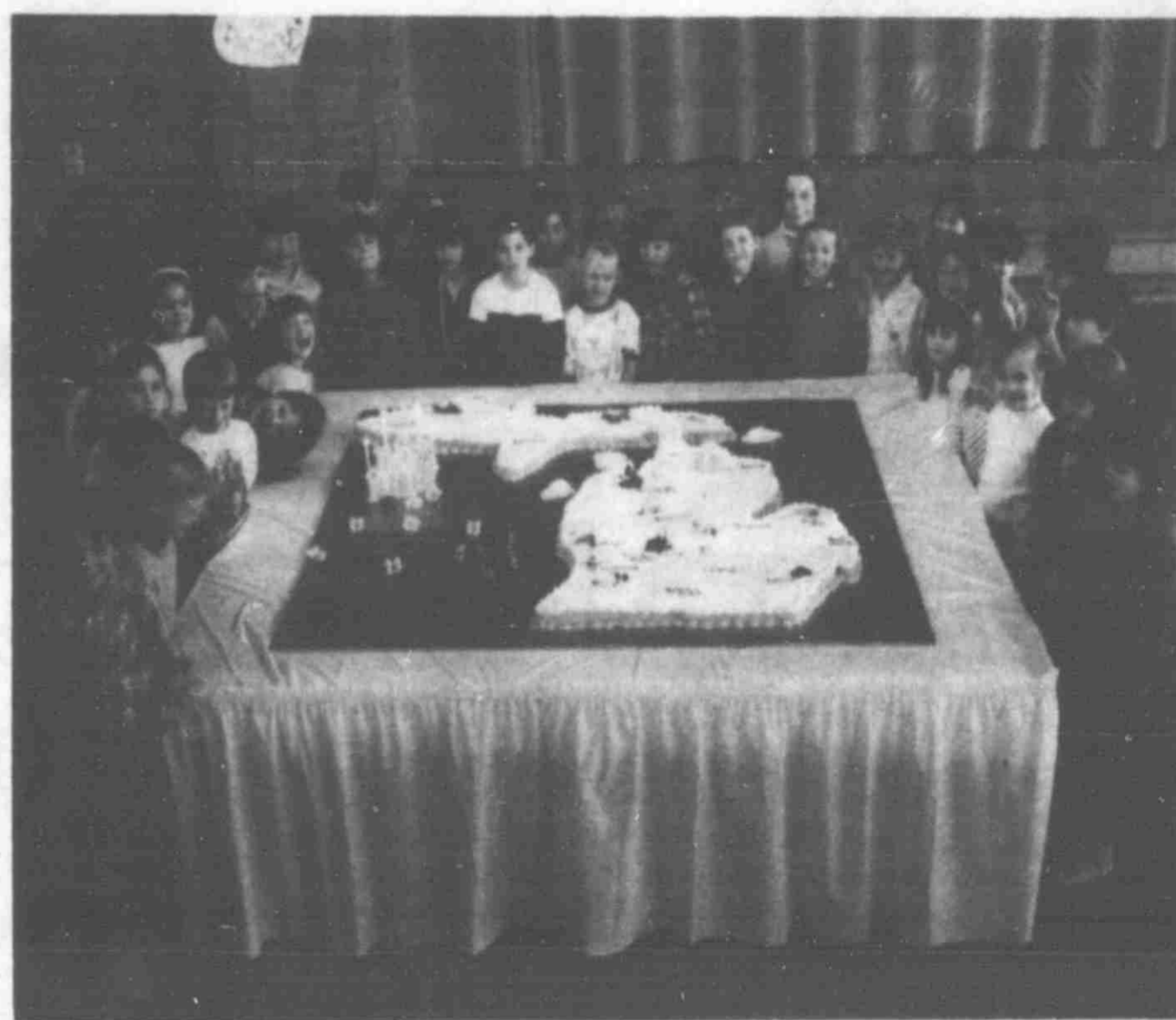
Several Runciman students gather around a huge Michigan-shaped cake in celebration of the state's Sesquicentennial. The cake is actually several cakes that were furnished by each of the school's classrooms. Major cities and points of interest were labeled with frosting.