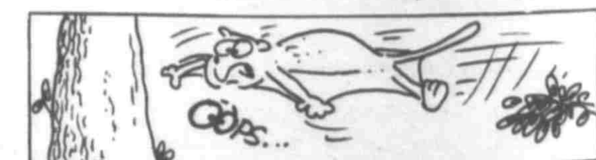
The flying lemur of Southeast Asia glides from tree to tree by spreading the folds of skin that connect its neck, legs and tail.

Diet can play a role in healing gout also: -- Don't eat large amounts of foods that are very high in purines (anchovies, bacon, salmon, sardines, trout, turkey, venison). -- Don't eat red meats more than 2-3 times a week; they are high in purines. -- Don't have more than 1-2 alcoholic beverages per day. -- Drink at least 2 quarts of fluid per day. Keeping urine diluted helps prevent the kidneys from uric acid crystal damage.