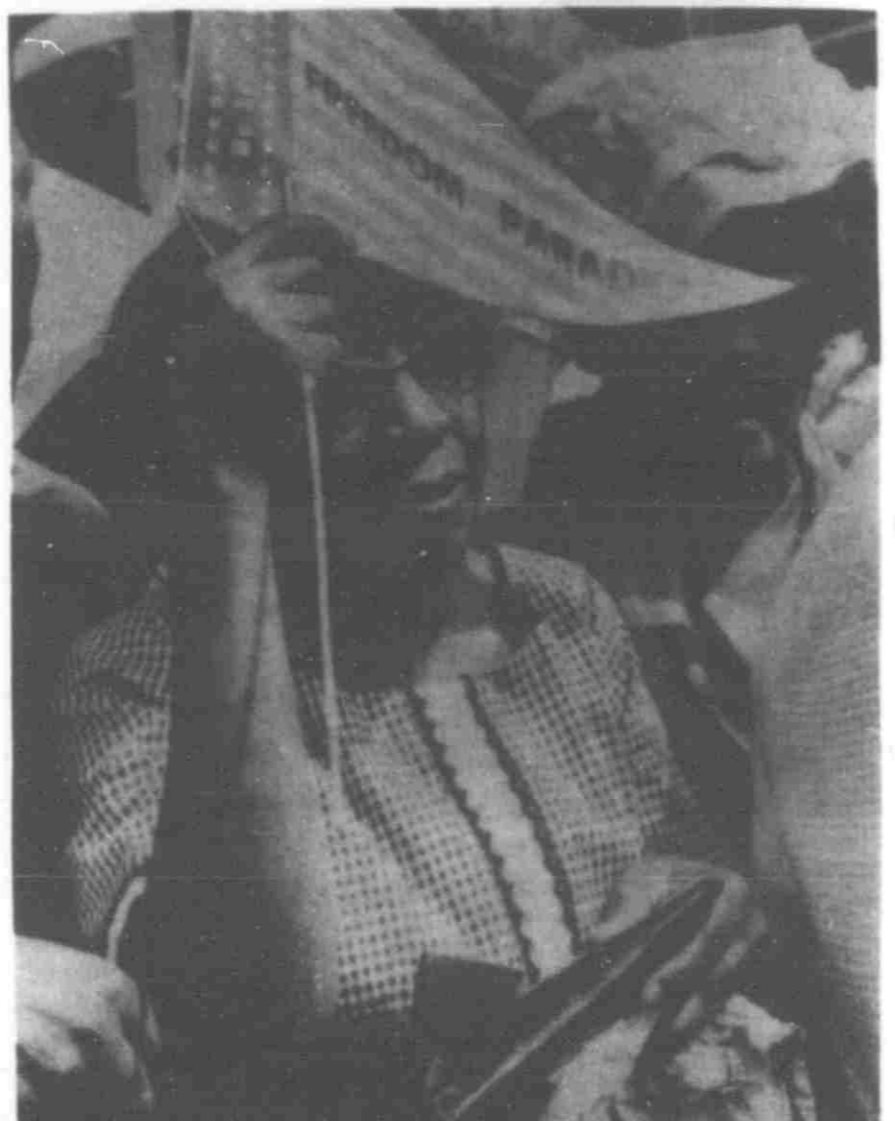
Demonstrators in the 1963 March on Washington demand an end to racial discrimination in the six-part series 'Eyes on the Prize: America's Civil Rights Years, 1954-1965.' It airs Wednesday, Feb. 4, on PBS. (Check local listings.)