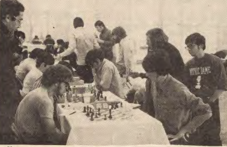
... Chess contestants matching wits at the Observer Tourney starting

Friday. be noted and seeded according to ability. Stronger players will be matched against weaker players in the first round. Play will proceed according to the five game Swiss