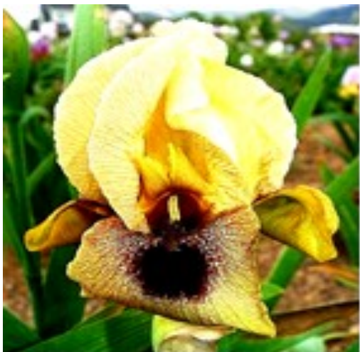
'Mean MR. Mustard'