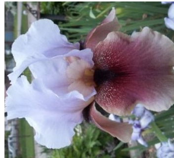
B old Sentry