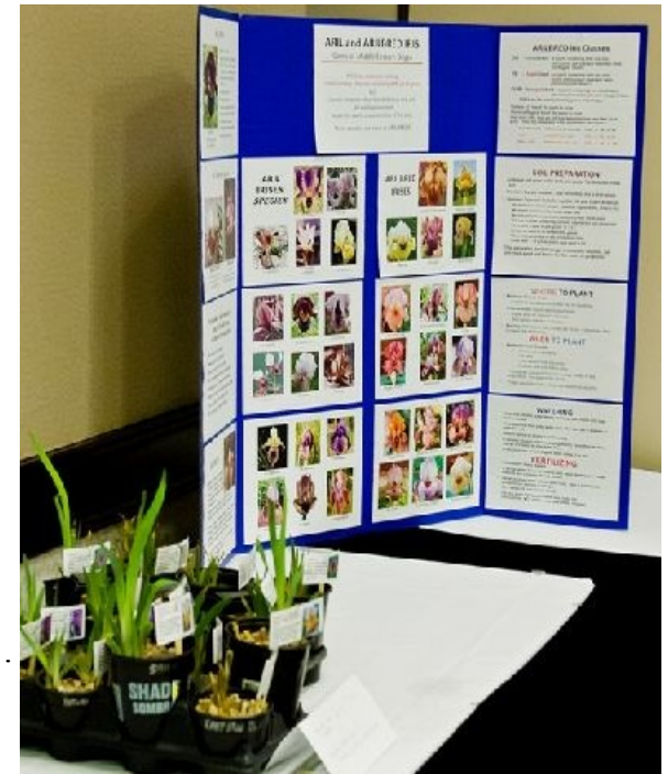
ASI Display Area at the Convention.