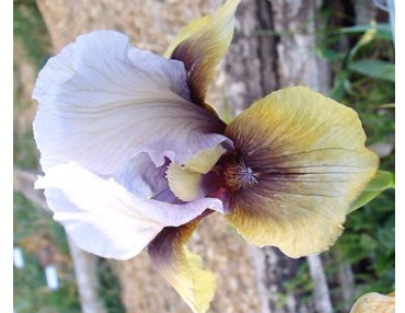
Jewel of Omar