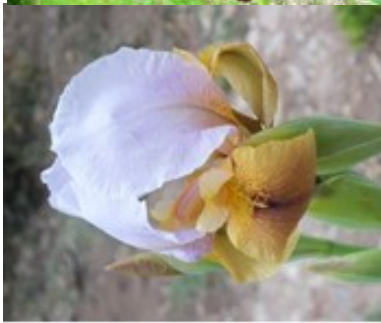
Honey Not Tonight