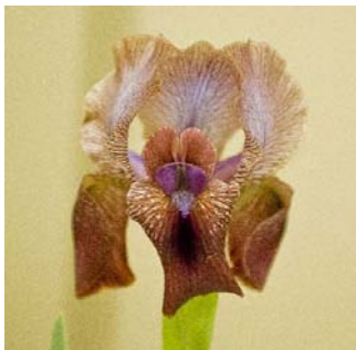
'Tadzhiki Bandit' at the ISD Show