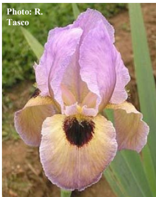
'Rivers of Babylon'

Rick Tasco's new OGBs, 'New Vision' and 'Rare Breed' were growing vigorously and blooming well in two of the gardens.