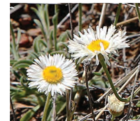
Fleabane (Erigeron annuus)