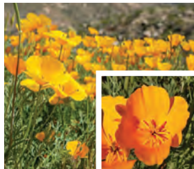
California Poppy (Eschscholzia californica) Ssp. Mexican Golden Poppy