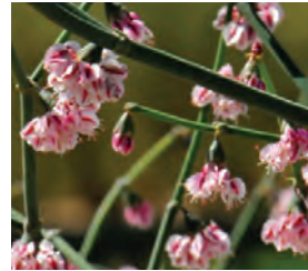
Skeletonweed ( Eriogonum deflexum )