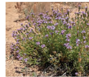
Southwestern Mock Vervain (glandularia gooddingii)