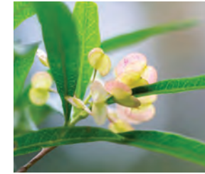
Hopbush (Dodonaea viscosa)