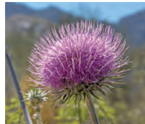
New Mexico Thistle (Cirsium neomexicanum)