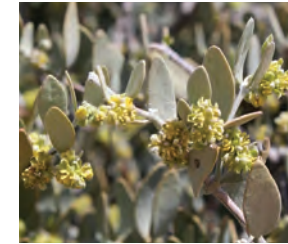
Jojoba (Simmondsia chinensis)