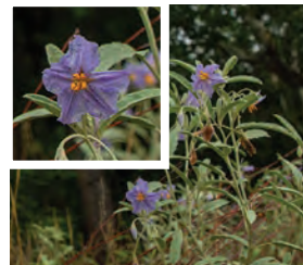
Silverleaf Nightshade ( Solanum elaeagnifolium )