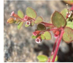
Euphorbia (Euphorbia arizonica) Credit: Matt Berger