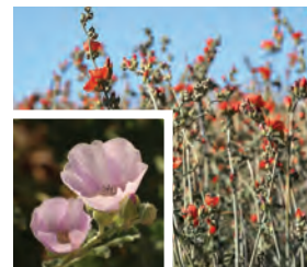
Globemallow (Sphaeralcea ambigua)