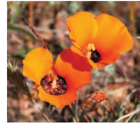
Desert Mariposa Lily (Calochortus kennedyi)