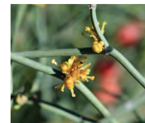
Mormon Tea (Ephedra fasciculata)