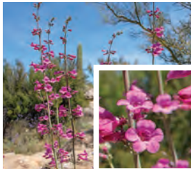
Parry's Penstemon ( Penstemon parryi )