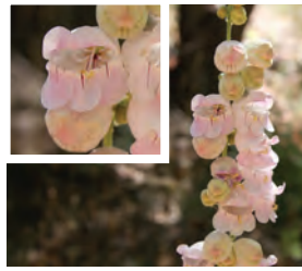
Palmer's Penstemon ( Penstemon palmeri )