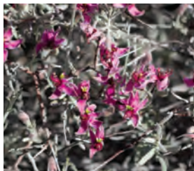
Rhatany ( Krameria erecta )