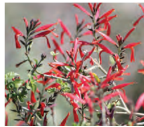
Chuparosa (Beloperone californica)