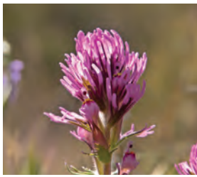
Owl's Clover ( Castilleja exserta )