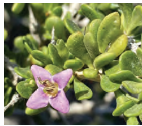
Baja Desert Thorn (Lycium brevipes)