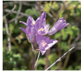
Blue Dicks (Dichelostemma capitatum)