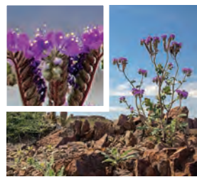
Scorpionweed ( Phacelia distans ) Known as Phacelia.