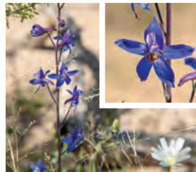
Tall Mountain Larkspur ( Delphinium scaposum )