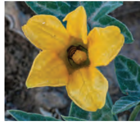
Coyote Melon (Cucurbita palmata)