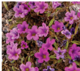
Purple Mat ( Nama demissum )