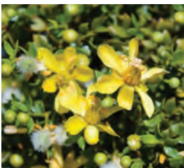
Creosote (Larrea tridentata)