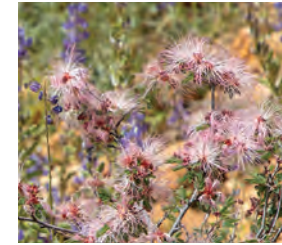
Fairy Duster (Calliandra eriophylla)