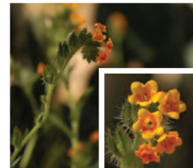
Fiddleneck (Amsinckia intermedia)