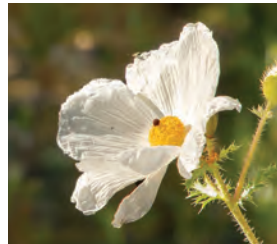
Prickly Poppy ( Argemone pleiacantha )