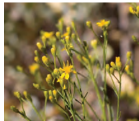
Snakeweed ( Gutierrezia sarothrae )