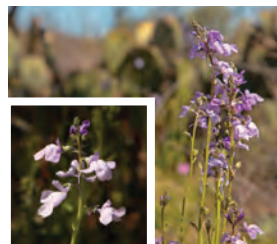
Texas Toadflax ( Nuttallanthus texanus )