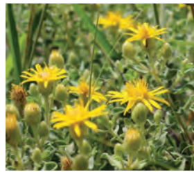
Camphorweed (Heterotheca subaxillaris)