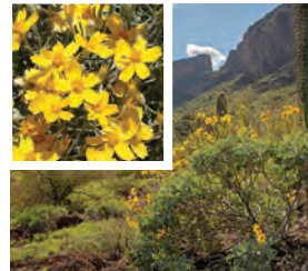
Brittlebush (Encelia farinosa)