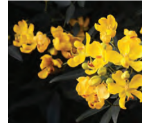
Desert Senna (Senna covesii)