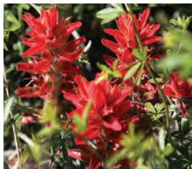
Prairie Fire ( Castilleja linariifolia )