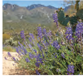
Coulter's Lupine (Lupinus sparsiflorus)