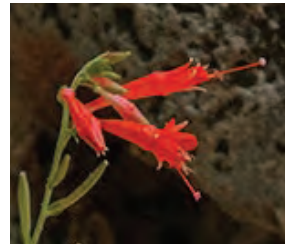
California Fuchsia (Epilobium canum)