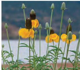
Prairie Coneflower ( Ratibida columnifera )