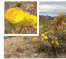
Yellow Cups ( Camissonia brevipes )