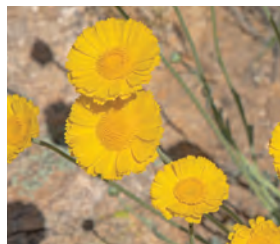
Desert Marigold (Baileya multiradiata)