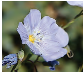
Blue Flax (Linum lewisii)