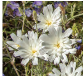
Desert Chicory (Rafinesquia neomexicana)