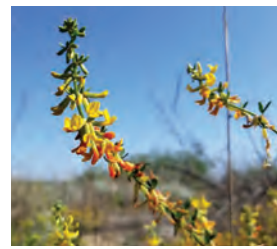
Woolly Lotus ( Acmispon glaber ) Known as Deerweed.