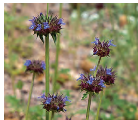
Desert Chia (Salvia columbariae)