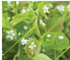
Miner's Lettuce (Claytonia perfoliata)