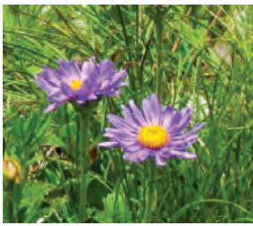
Aster (Almutaster pauciflorus)