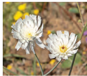
Gravel Ghost (Atrichoseris platyphylla)