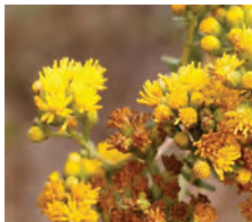
Burroweed (Isocoma tenuisecta) Known as Haplopappus.