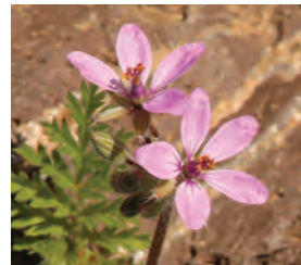
Storcksbill ( Erodium cicutarium ) Known as Filaree