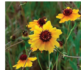
Golden Tickseed (Coreopsis tinctoria)