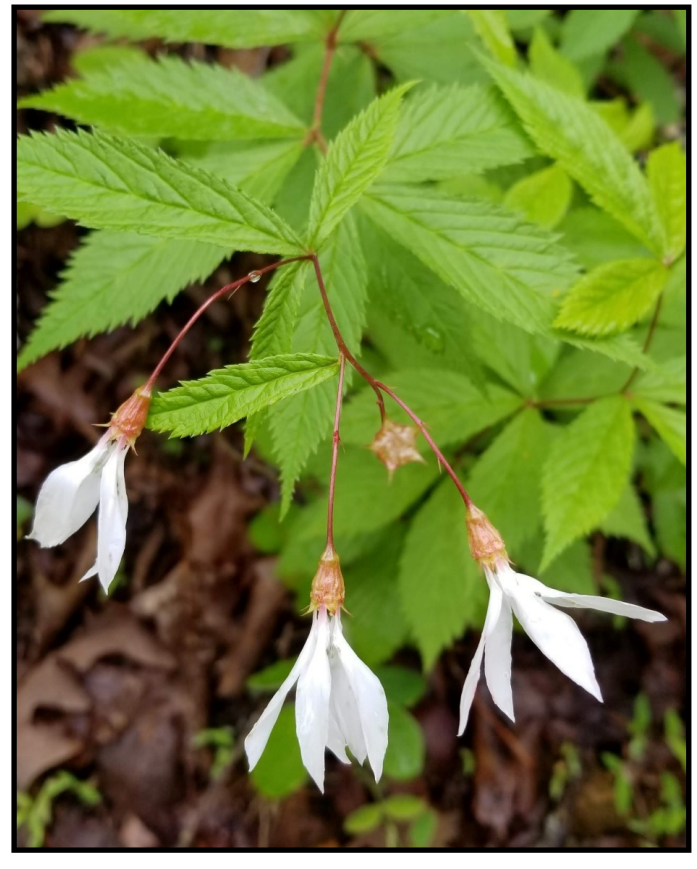
Bowman's Root (Gillenia trifoliata).

2:00 - 5:00 pm: Black Maple Tour. We will visit one of two known sites of the rare black maple in Arkansas, a mesic riparian forest in a scenic, narrow valley with several rock outcrops. We will meet at Visitor Center and carpool/caravan to the site. Along the way we'll stop to see wildflowers growing in a dry-mesic woodland and we will also stop to see Bowman's-root ( Gillenia trifoliata ), another rare species in Arkansas. Trip leaders: Jennifer Ogle and Nolan Moore. Level of difficulty: moderate; at the black maple site, we will be off trail and there is a short but steep slope to get into the site.