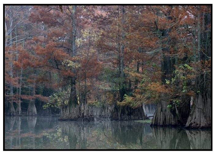
Bald-cypress (Taxodium distichum).

1:00 - 4:00 pm: Byrd Lake Natural Area. Because parking is limited, we will meet at the lunch stop (see above) and carpool/caravan to the site. Level of difficulty: easy to moderate – much on ADA compliant trails. Habitat: We will see an oxbow lake with bald cypress surrounded by rich, alluvial bottomlands on the very edge of the Gulf Coastal Plain.