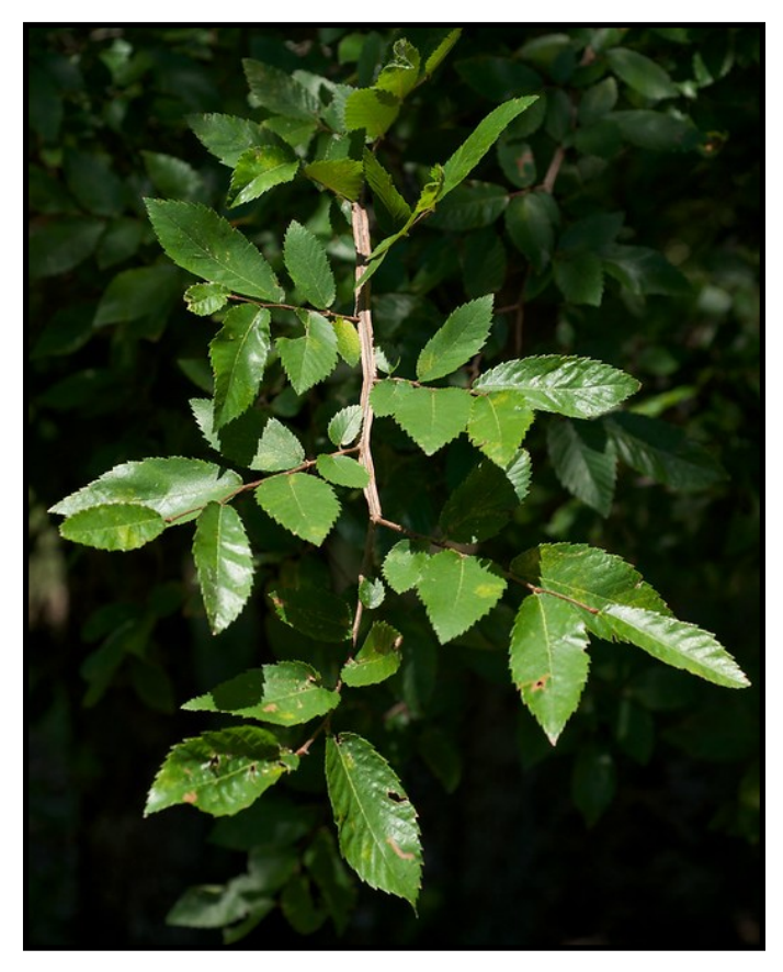
Winged Elm (Ulmus alata).

In addition to roadway buffers, urban trees can also reduce the exchange of air between the atmosphere and the street environment, forming a green ceiling over the