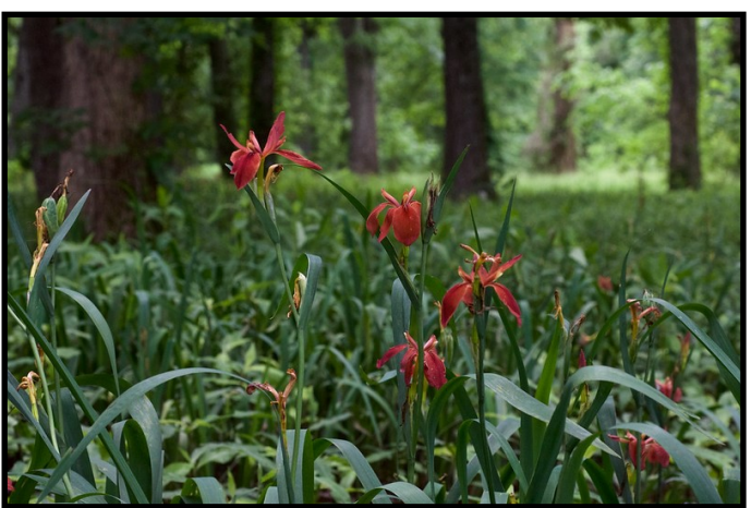
Top: Bigleaf Snowbell (Styrax grandifolius). Bottom: Copper Iris (Iris fulva).

SATURDAY, MAY 7: NORTHEAST ARKANSAS CROWLEY'S RIDGE LAKE VILLAGE STATE PARK