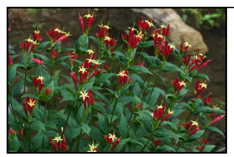
Indian Pink (Spigelia marilandica).

Learn about the proclamation's history and make plans to join ANPS in the monthlong celebration by attending a Spring "Mini-Meeting" in your area of the state