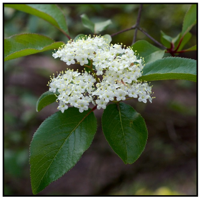
Rusty Blackhaw (Viburnum rufidulum).

Specific air contaminants are discussed below, along with native plant species that can be used to remediate or control these contaminants using the two phytotechnological mechanisms discussed above.