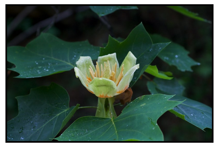
Tulip-tree (Liriodendron tulipifera).

9:00 am: Lake Austell Trail. Level of difficulty: moderate with a few strenuous parts, but we'll take it slow. 12:00 pm: Potluck picnic at the Lake Austell picnic area. 2:00 pm - 5:00 pm: Lake Austell Trail (a different section). Level of difficulty: moderate with a few strenuous parts, but we'll take it slow.