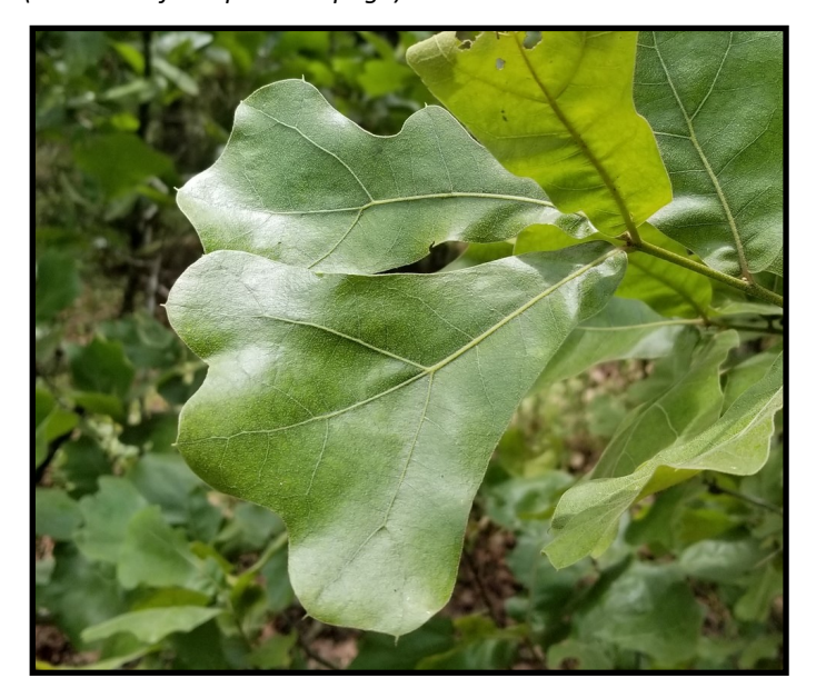
Blackjack Oak (Quercus marilandica).

have powerful neurological effects and can cause headaches, dizziness, and even memory impairment.