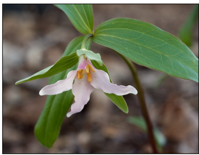
Top: Ozark spiderwort (Tradescantia ozarkana). Bottom: Ozark Trillium (Trillium ozarkanum).