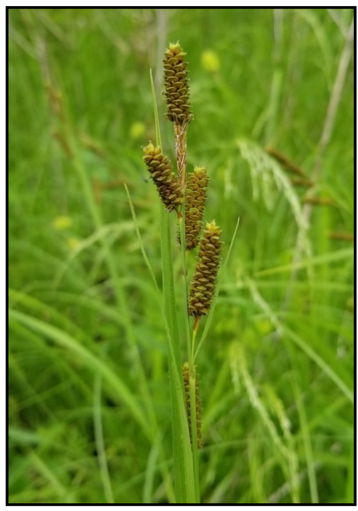
Short's Sedge (Carex shortiana).