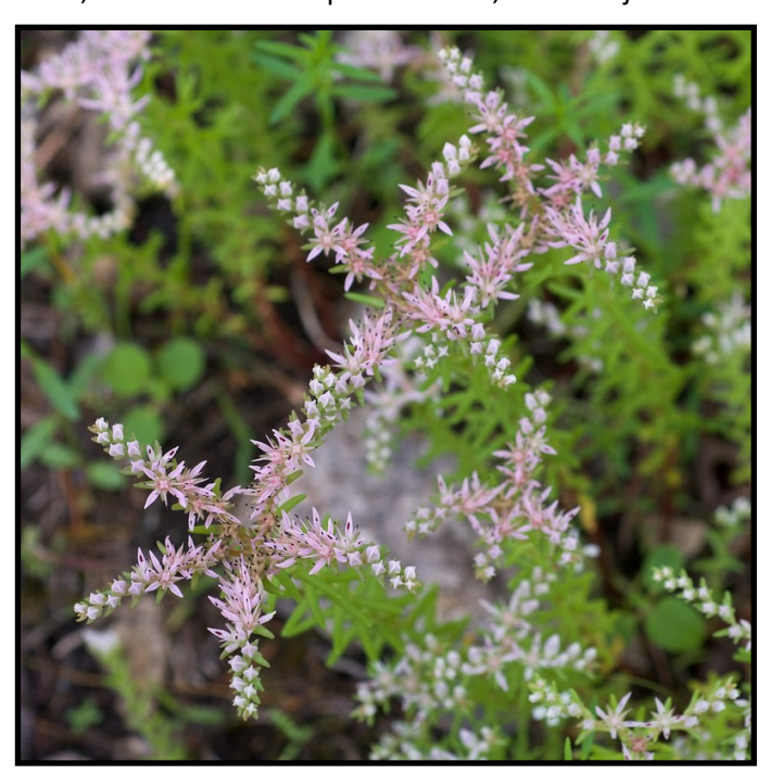
Widow's-Cross (Sedum pulchellum).

1:30 - 4:30 pm: Glade Restoration Project in the Caddo/ Womble district, led by Virginia and Susan. Expect to see winecup, pale purple coneflower, fameflower, widow'scross, and Carolina larkspur in flower, to name just a few!