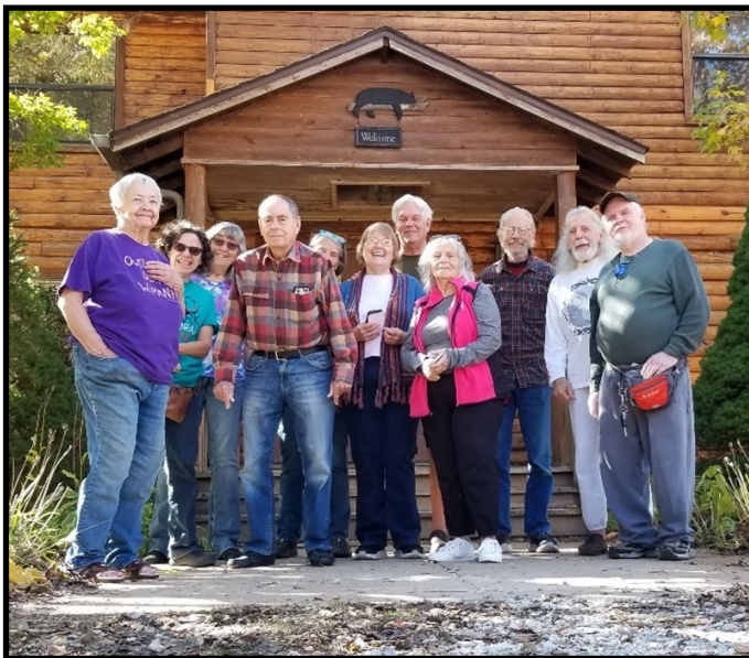
OCANPS members at the 2021 retreat at Harmony Mountain.