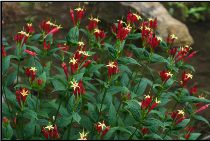
Indian Pink (Spigelia marilandica).

Learn about the proclamation's history and make plans to join ANPS in the monthlong celebration by attending a Spring "Mini-Meeting" in your area of the state