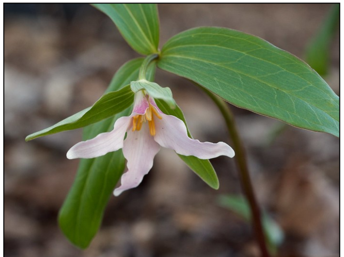
Top: Ozark spiderwort ( Tradescantia ozarkana ).