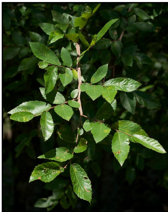
Winged Elm ( Ulmus alata ).