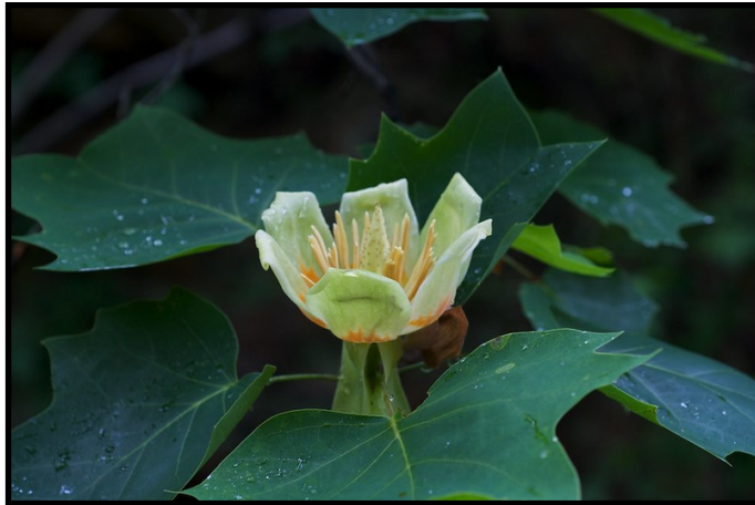
Tulip-tree (Liriodendron tulipifera).

2:00 pm - 5:00 pm: Lake Austell Trail (a different section). Level of difficulty: moderate with a few strenuous parts, but we'll take it slow.