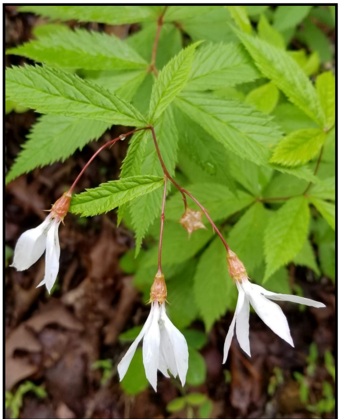
Bowman's Root (Gillenia trifoliata).

2:00 - 5:00 pm: Black Maple Tour. We will visit one of two known sites of the rare black maple in Arkansas, a mesic riparian forest in a scenic, narrow valley with several rock outcrops. We will meet at Visitor Center and carpool/caravan to the site. Along the way we'll stop to see wildflowers growing in a dry-mesic woodland and we will also stop to see Bowman's-root ( Gillenia trifoliata ), another rare species in Arkansas. Trip leaders: Jennifer Ogle and Nolan Moore. Level of difficulty: moderate; at the black maple site, we will be off trail and there is a short but steep slope to get into the site.