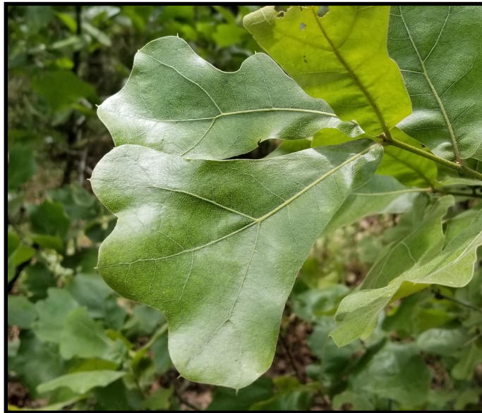
Blackjack Oak ( Quercus marilandica ).