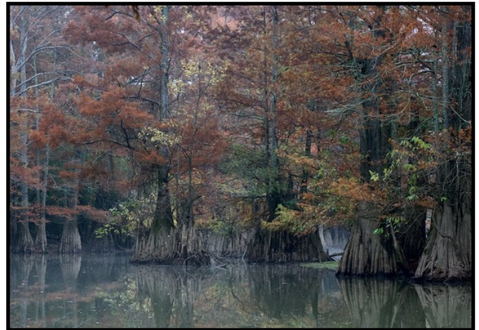
Bald-cypress (Taxodium distichum).

1:00 - 4:00 pm: Byrd Lake Natural Area. Because parking is limited, we will meet at the lunch stop (see above) and carpool/caravan to the site. Level of difficulty: easy to moderate – much on ADA compliant trails. Habitat: We will see an oxbow lake with bald cypress surrounded by rich, alluvial bottomlands on the very edge of the Gulf Coastal Plain.