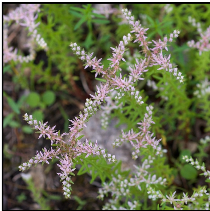
Widow's-Cross (Sedum pulchellum).

1:30 - 4:30 pm: Glade Restoration Project in the Caddo/Womble district, led by Virginia and Susan. Expect to see winecup, pale purple coneflower, fameflower, widow's-cross, and Carolina larkspur in flower, to name just a few!