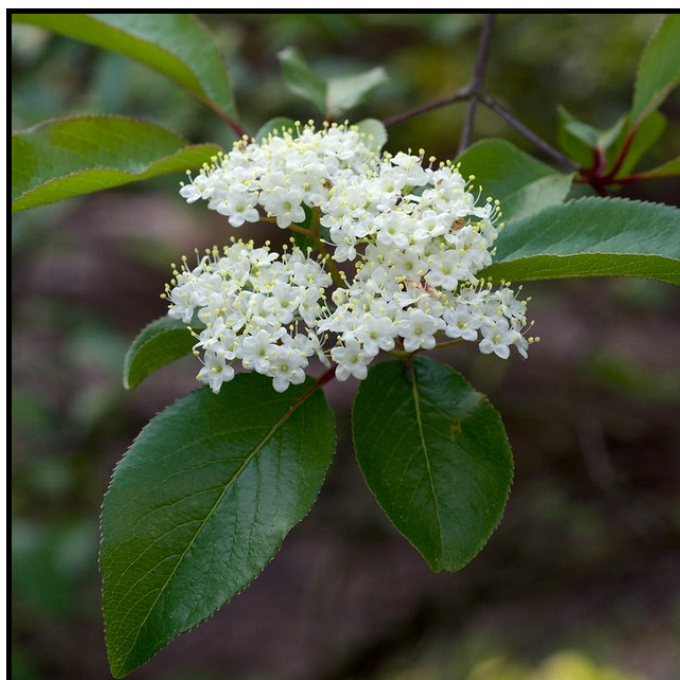
Rusty Blackhaw (Viburnum rufidulum).

Specific air contaminants are discussed below, along with native plant species that can be used to remediate or control these contaminants using the two phytotechnological mechanisms discussed above.