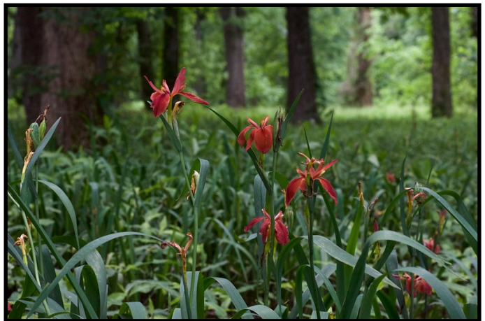
Top: Bigleaf Snowbell (Styrax grandifolius). Bottom: Copper Iris (Iris fulva).