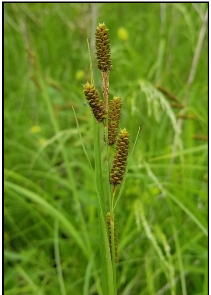
Short's Sedge (Carex shortiana).