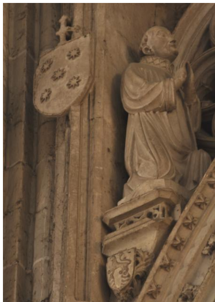
Figure 19 Cathedral of Palencia (Castile): statue of canon Pedro Estébanez de Alcántara in the Sagrario chapel.

What was the motive for this anomalous outpouring of portraiture? The prelates of the period led an itinerant life, especially those, like Rojas, who occupied positions close to the monarchs. Their artistic commissions were entrusted to clergymen of lower rank, who remained in the main venues. It was they who hired the artists and supervised the work. Consequently, men who on their own would never have had the opportunity or the economic means to be protagonists found themselves in a position to accede to unsuspected importance. It was a great opportunity for the second ranks.