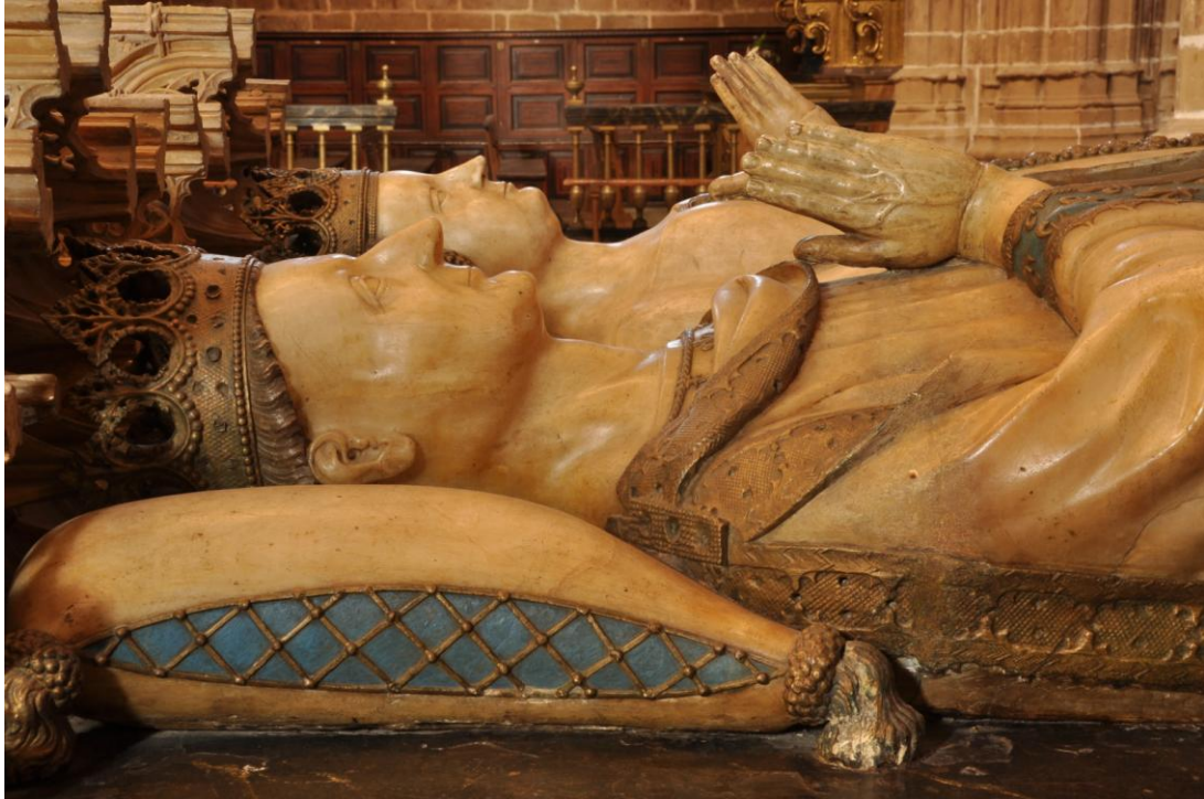
Figure 5 Cathedral of Pamplona (Navarre): tomb of King Charles III the Noble and Leonor of Castile.