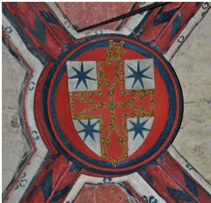
Figure 4 Cathedral of Pamplona (Navarre): coat of arms of Sancho Sánchez de Oteiza in the chapel of Saint John the Evangelist.