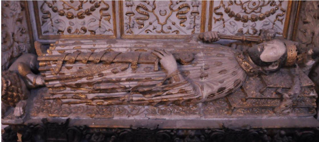
Figure 10 Cathedral of Toledo (Castile): tomb of King Henry II of Castile in the chapel of the New Kings.

white and blonde', 41 although the gold of the hair seems to show through the present dark tone, possibly polychromed again when the tombs were transferred to the Chapel of the New Kings in 1534.