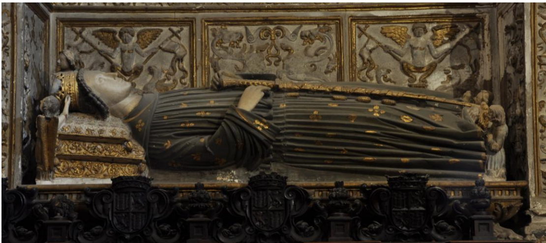
Figure 12 Cathedral of Toledo (Castile): tomb of King Henry III of Castile in the chapel of the New Kings.