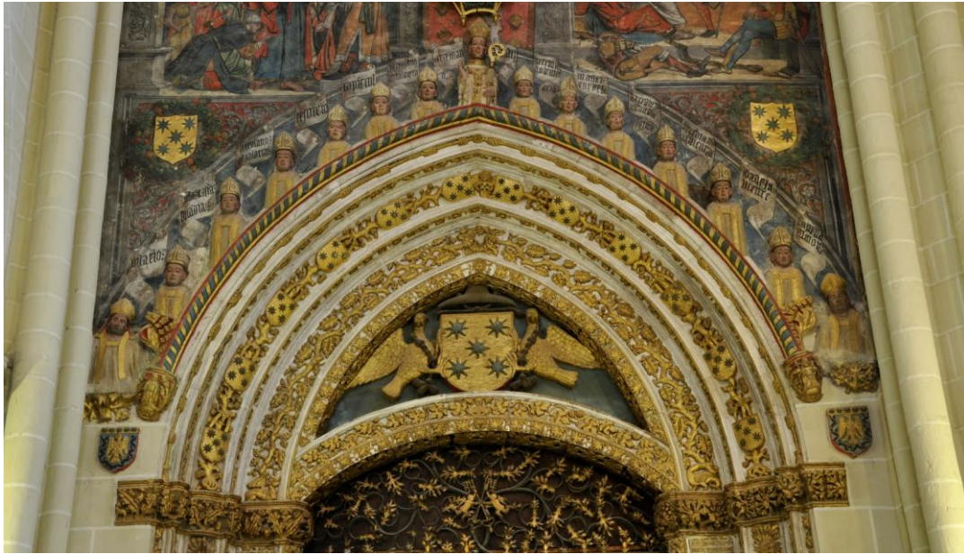
Figure 18 Cathedral of Toledo (Castile): door of the chapel of Saint Peter with the busts of the bishop and fourteen dignitaries of the chapter.

What was the motive for this anomalous outpouring of portraiture? The prelates of the period led an itinerant life, especially those, like Rojas, who occupied positions close to the monarchs. Their artistic commissions were entrusted to clergymen of lower rank, who remained in the main venues. It was they who hired the artists and supervised the work. Consequently, men who on their own would never have had the opportunity or the economic means to be protagonists found themselves in a position to accede to unsuspected importance. It was a great opportunity for the second ranks.