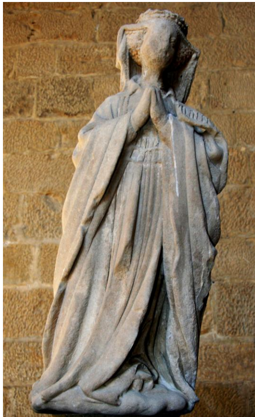
Figure 9 Santa María de Olite (Navarre): statue of Queen Blanche of Navarre.

Five tombs of the group are of laymen of the court. Only Villaespesa is presented without armour (the hose and shoe of his right leg are uncovered). The sword proclaims his condition of nobleman, but no other weapon marks him as a military man. The biretta and the thick tome identify a man of letters: it was his intellectual background that permitted him to attain a position of such great responsibility. His epitaph reaffirms his doctoral status: 'Here lies ( ... ) Mosén Francés de Villaespesa, doctor, nobleman and chancellor of Navarra' 29 The other tombs of nobles boast of the handling weapons and do not neglect to reflect their proximity to the crown: Pere Arnaut de Garro in Pamplona and Pedro Périz de Andosilla in Olite wear complete armour and bear collars of chestnut leaves, a favourite gift of Charles III. 30 The lack of terms of comparison impedes verification of their fidelity to the likenesses.