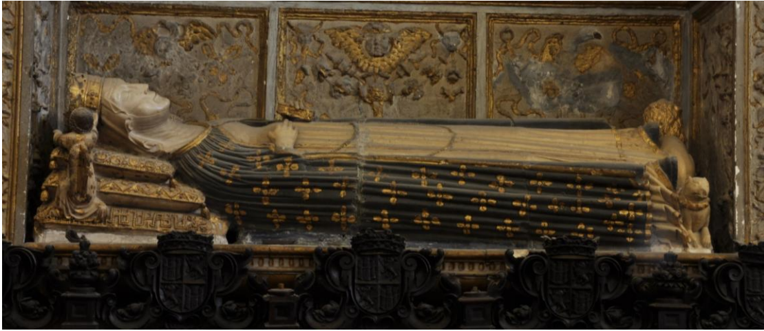
Figure 11 Cathedral of Toledo (Castile): tomb of Queen Catherine of Lancaster in the chapel of the New Kings.

Franciscan habit and sandals, as was true of the recumbent figure of Sancho IV, who until then had been the only king buried in the cathedral of Toledo with a funerary statue.