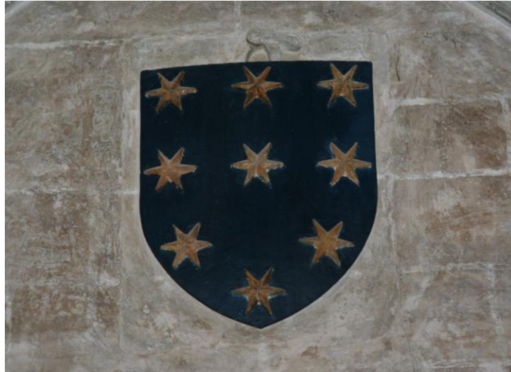
Figure 3 Santa María de Tudela (Navarre): coat of arms in Sancho Sánchez de Oteiza's tomb.

would not have sons to inherit them legitimately. The change of the coat of arms and their proliferation can be credited to the will of the new bishop; the sculptors were responsible for their material realization. 11