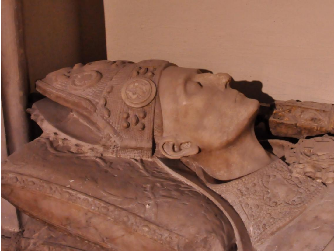
Figure 15 Cathedral of Toledo (Castile): tomb of Bishop Sancho de Rojas in the chapel of Saint Peter.

geometricizing idealization. The continuous curve that connects the nose with the eyebrows, the smooth surface of the skin and the small mouth, as well as the perfection of the oval of the face make us suspect that we are not looking at a physiognomic portrait. Nothing in his attire, mitre or posture indicates a desire to individualize. Identification was entrusted to the coats of arms situated in preferential places.