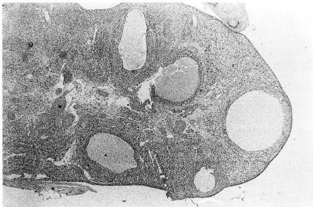
Figure 2. — Photomicrograph of a histological section from the ovary of an androgenized rat. Multiple cortical follicular cysts surrounded by abundant ovarian stroma, covered with granulosa cells can be observed, with early stages of antrum formation and hyperplasia of the internal theca with luteinization. H-E staining (140X).