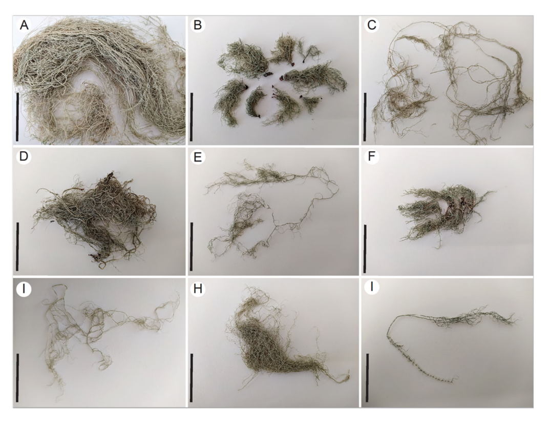
Figure 3. Photos of representative Usnea specimens collected at "Geyser Pass 1" site. Usnea cavernosa (panel 'A'), was the most common Usnea species sampled in the study. Scale bar = 3 cm.

Twenty Usnea thalli representing the range of observed morphological diversity (Figure 3) were selected to investigate the secondary metabolite variation using thin layer chromatography (TLC), following standard methods with solvent system 'G' [34,35], and these were identified using traditional phenotype-based approaches.