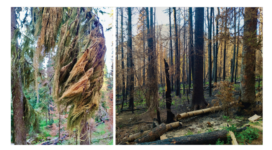
Figure 5. Fire damage to fruticose lichen communities near the headwaters of Mill Creek in the La Sal Mountains in southern Utah, USA.