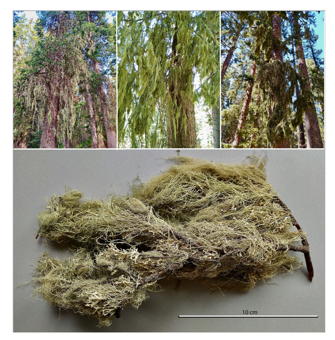
Figure 2. Lichen-draped conifer sites in the La Sal Mountains. The top row includes photos from site 'Geyser Pass 1', 'Geyser Pass 2', and 'Medicine Lake' ( left to right ). The bottom panel depicts a typical lichen-covered conifer branch sampled for DNA metabarcoding. Fruticose lichens included Evernia divaricata, Ramalina sinensis, and various Usnea species. Inconspicuous crustose lichens co-occurred tightly appressed to bark.

Most fruticose lichen populations are quite small and spatially restricted on the Colorado Plateau. However, during excursions in the La Sal Mountain Range ("La Sals"), a sky island on the Colorado Plateau, in southeastern Utah, USA, we observed spatially restricted, robust lichen communities draping conifers in subalpine forests with unusually high population density and biomass (Figure 2). The lichen-draped conifer sites are dominated by the lichens Evernia divaricata (L.) Ach., Ramalina sinensis Jatta, and various Usnea species. Presently, little is known about these sites, including the extent of lichen-draped conifers sites, the amount of genetic variation, the range of associated lichens, and factors influencing their origin and persistence. Given the apparent limited, restricted distributions, these communities merit careful conservation consideration.