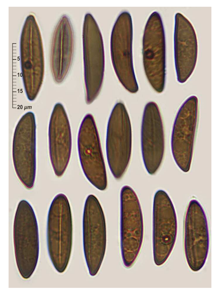
Plate 4 – Xylaria apiculata ERD-7166. Ascospores 1000× in Melzer's reagent.