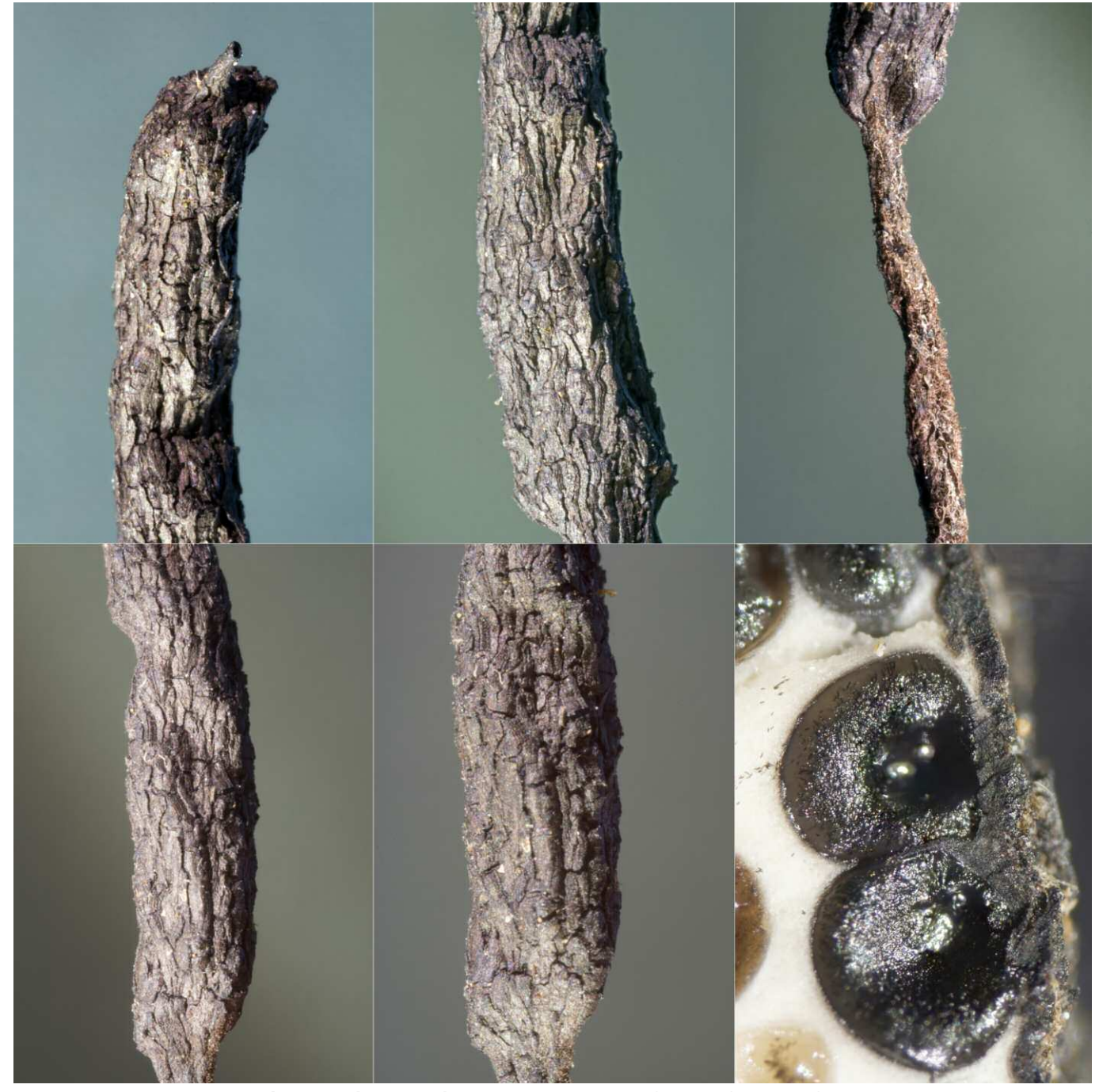
Plate 2 - Xylaria apiculata ERD-7166. Stromata. Close up.

Stromata superficial, solitary or clustered in small groups, erect, stipitate, 9–30 mm in total height, the fertile head subcylindrical to slightly fusiform or narrowly clavate, constricted in places, simple to