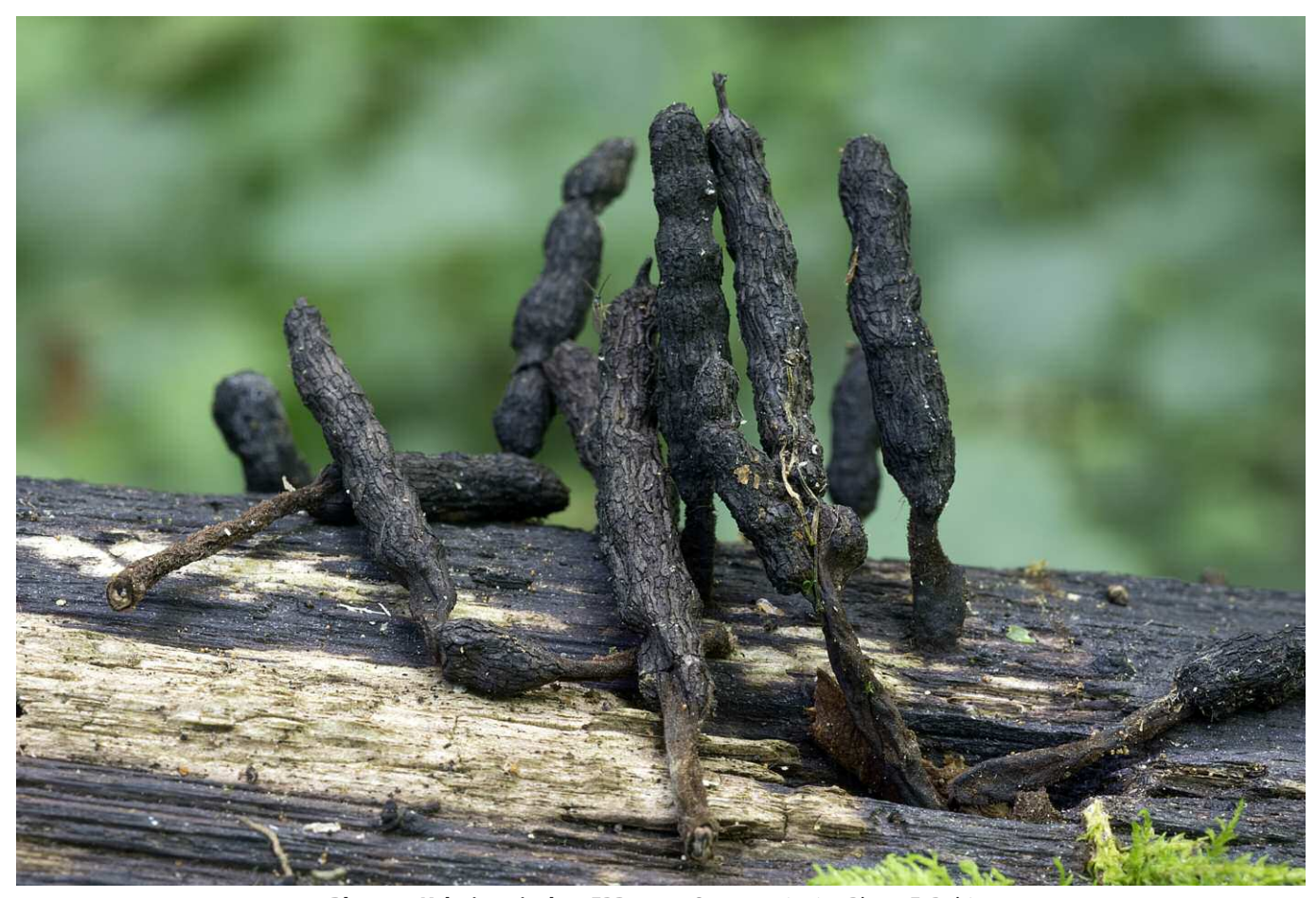
Plate 1 - Xylaria apiculata ERD-7166. Stromata in situ.

DNA extraction, amplification and sequencing — Total DNA was extracted from dry specimens employing a modified protocol based on MURRAY & THOMPSON (1980). PCR reactions (MULLIS & FALOONA,