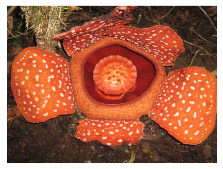
Fig. 2. Fully-bloomed flower of the newly described Rafflesia banaoana Malabrigo discovered in BBNP

was treated as synonym of Rafflesia leonardi (Barcelona et al., 2011) based solely on the photos from the author's publication (Malabrigo, 2010, p. 141-143). However, careful examination of R. leonardi photos (Barcelona et al., 2008, p. 226; 2009, p. 81; 2011, p. 13.) showed obvious and enormous morphological differences (size, color, shape of the disk, number of processes, column layering etc. ) with R. banaoana . It is interesting to learn how these experts arrived at a conclusion that the two species are conspecific and those morphological differences are only developmental and/or environmental variations, where in fact not anyone from them have seen actual specimen of R. banaoana . Being the person who observed its natural population and carefully examined the species, the author strongly upholds the identity of Rafflesia banaoana as unique and different from the rest of the Rafflesia in the world.