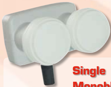
Single Monoblock SMB 21