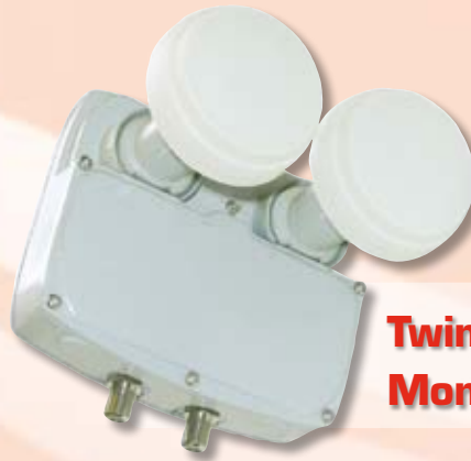
Twin Monoblock SMB 22