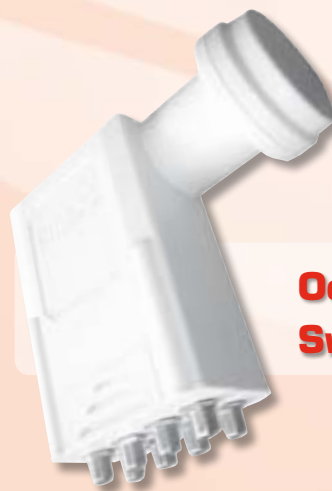
Octo Switch TO