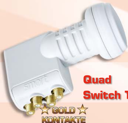
Quad Switch TQS