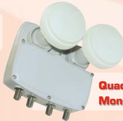
Quad Monoblock SMB 55