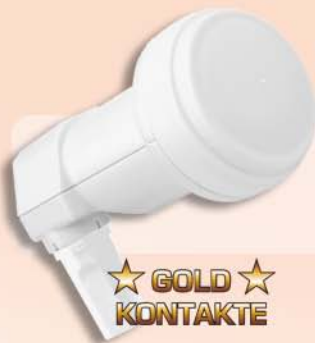
Single Universal TS