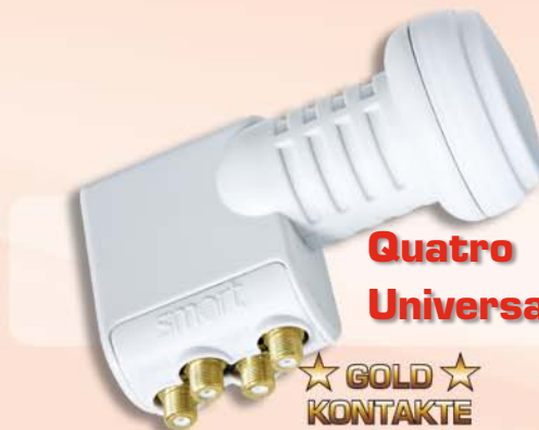
Quatro Universal TQ