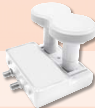
Twin Monoblock TMT 43