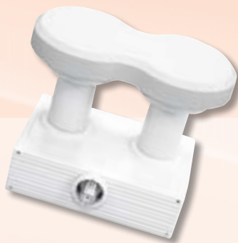
Single Monoblock TMS 43