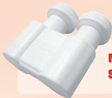
Monoblock Single TMS