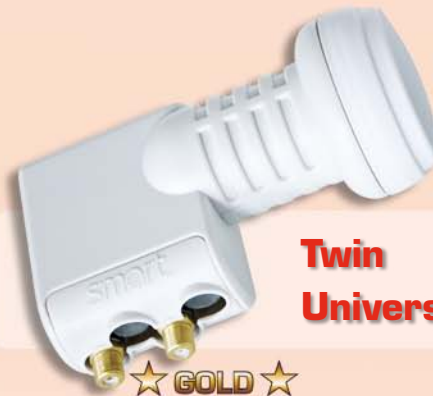
Twin Universal TT