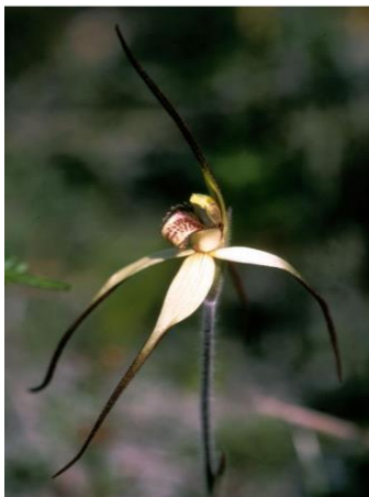
Eastern Spider-orchid Caladenia orientalis EPBC Listed EN FFG Listed EN Photo: Cape Paterson

Cape Paterson is famous for its native orchids.