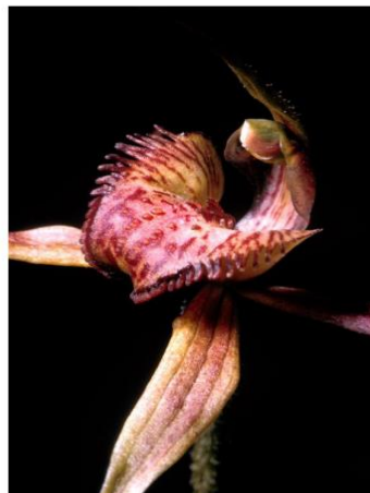
Variable Spider-orchid Caladenia X variabilis FFG Listed EN in 2014, not listed 2022 Photo: Scenic Road, Cape Paterson