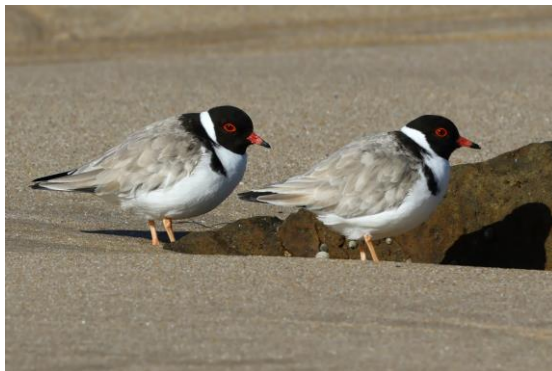
Photo of Hooded Plover breeding pair recently at Pea Creek estuary

The volunteering effort will be supported by patrols by Parks Victoria Rangers and the Office of the Conservation Regulator who will also be monitoring the beaches. Let's keep the fingers crossed for another successful breeding season.