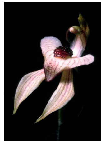
Thick-lip Spider-orchid Caladenia tessellata EPBC Listed VU Photo: Ozone Court, Cape Paterson