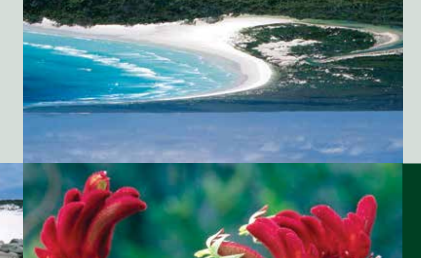
Above Kangaroo paw (Anigozanthos rufus).

Above Thomas River and Yokinup Bay.