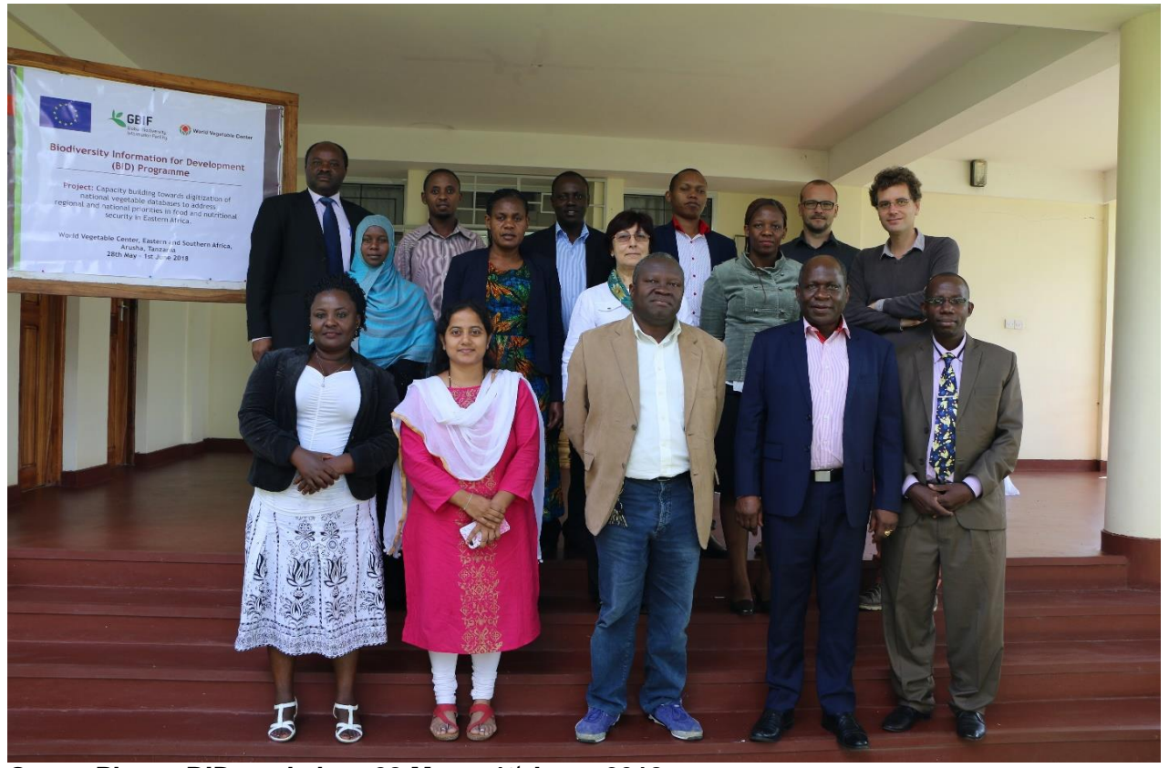
Group Photo, BID workshop 28 May - 1st June, 2018

The workshop was held in Arusha, Tanzania at World Vegetable Center, Eastern and Southern Africa. We received total of 16 participants from seven organizations (Table 1). One of the participant was representing local government and he presented the status of crop cultivation at the district level and new trends for increasing traditional vegetables growing to improve food security of the populations.