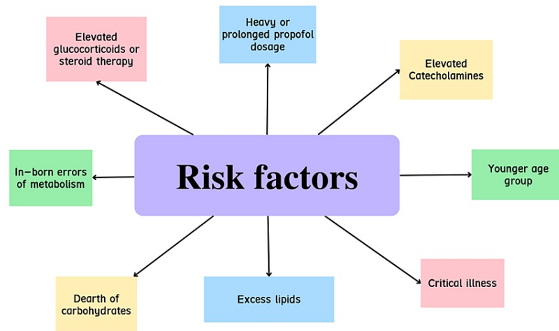
FIGURE 2: Risk factors for the development of PRIS

PRIS: Propofol-Related Infusion Syndrome