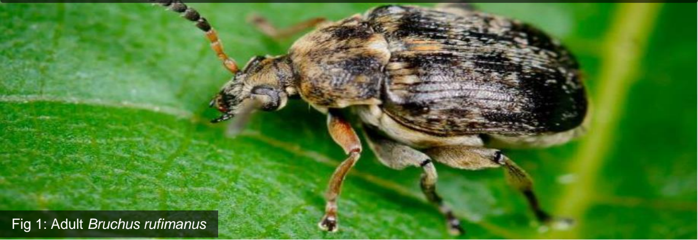
Fig 1: Adult Bruchus rufimanus