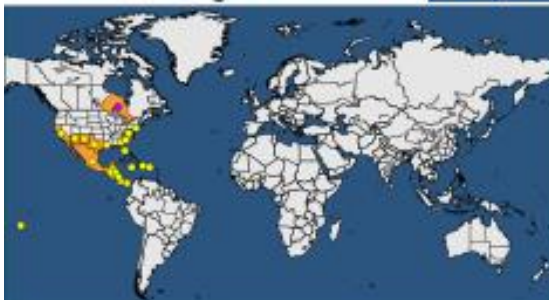
Fig 4: World map of A. eugenii distribution taken from the EPPO database ( Link )