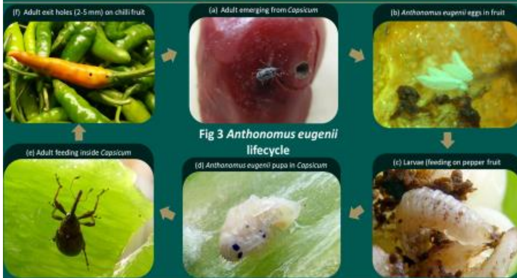
Fig 3 Anthonomus eugenii lifecycle