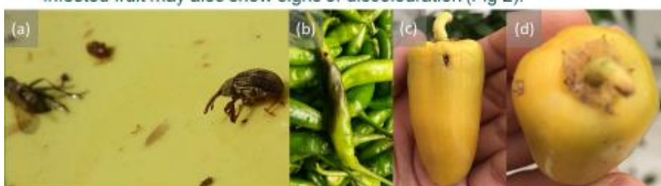
Fig 2: Anthonomus eugenii adult immobilized on a yellow pheromone sticky trap (a), discoloration and exit hole on chilli fruit (b), adult exit hole on damaged Capsicum (c), aborted Capsicum with dried calyx (d) More photos are available on the EPPO Database