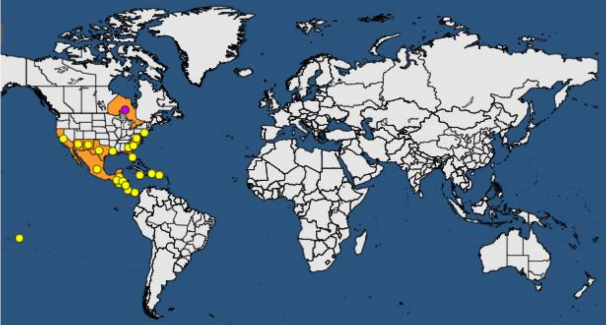
Fig 2: Map showing distribution of Anthonomus eugenii worldwide as of 21.02.2023