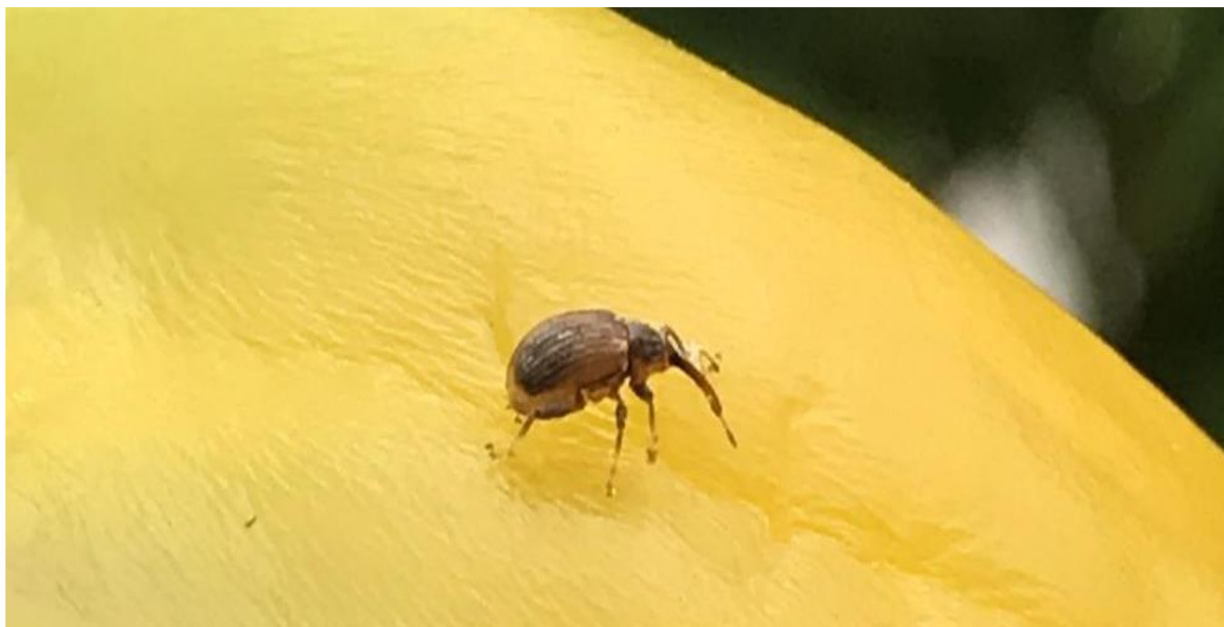
Fig 1: Adult Anthonomus eugenii.