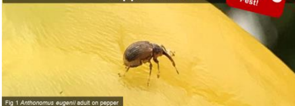
Fig 1 Anthonomus eugenii adult on pepper