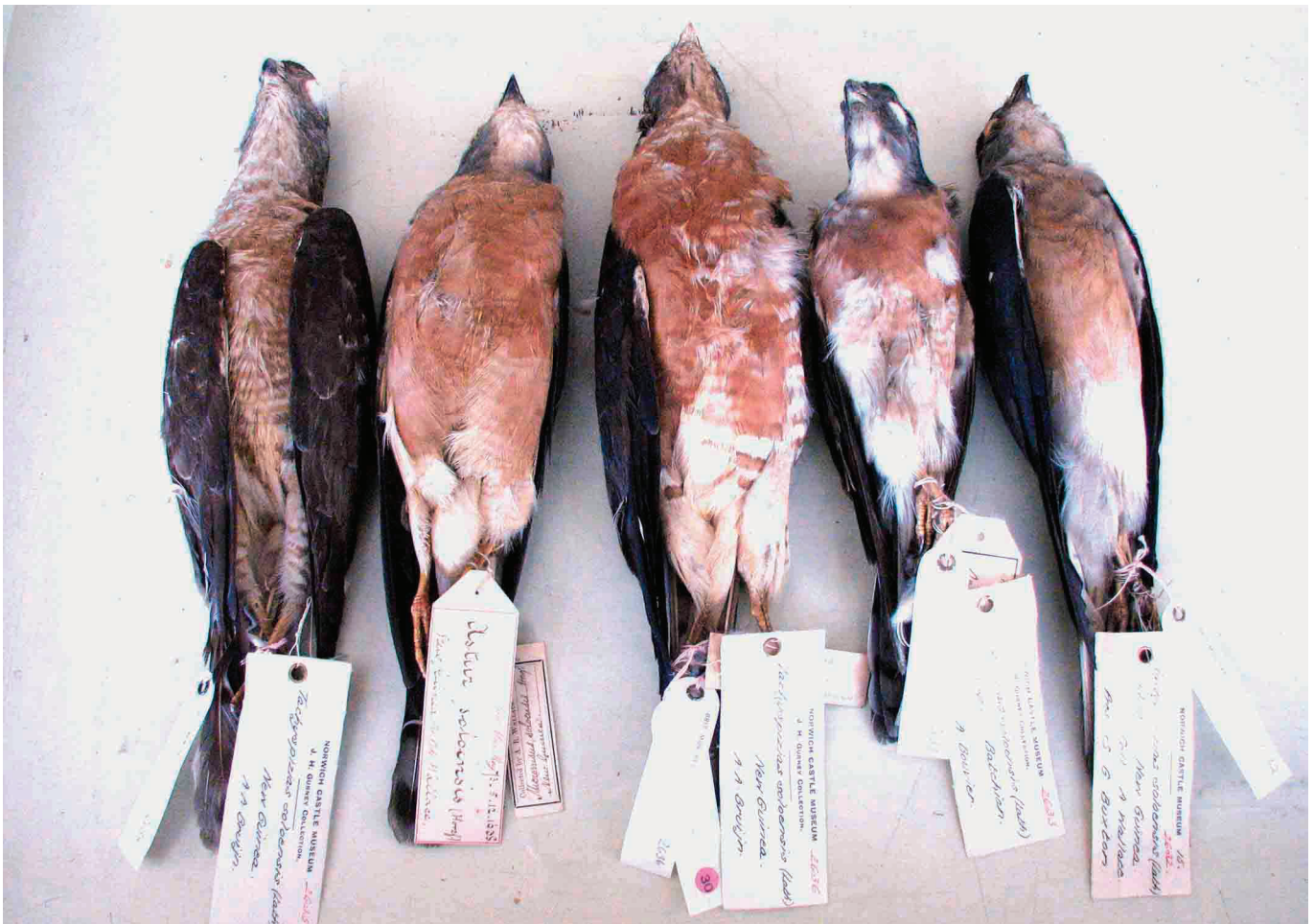
Plate 1. The five Chinese Sparrowhawks collected in New Guinea in the nineteenth century at unspecified localities, held at the Natural History Museum, Tring, UK. From left to right: NHMUK 1955.6.N.20.2635; 1873.5.12.1638; 1955.6.N.20.2636; 1955.6.N.20.2633 and 1955.6.N.20.2632.