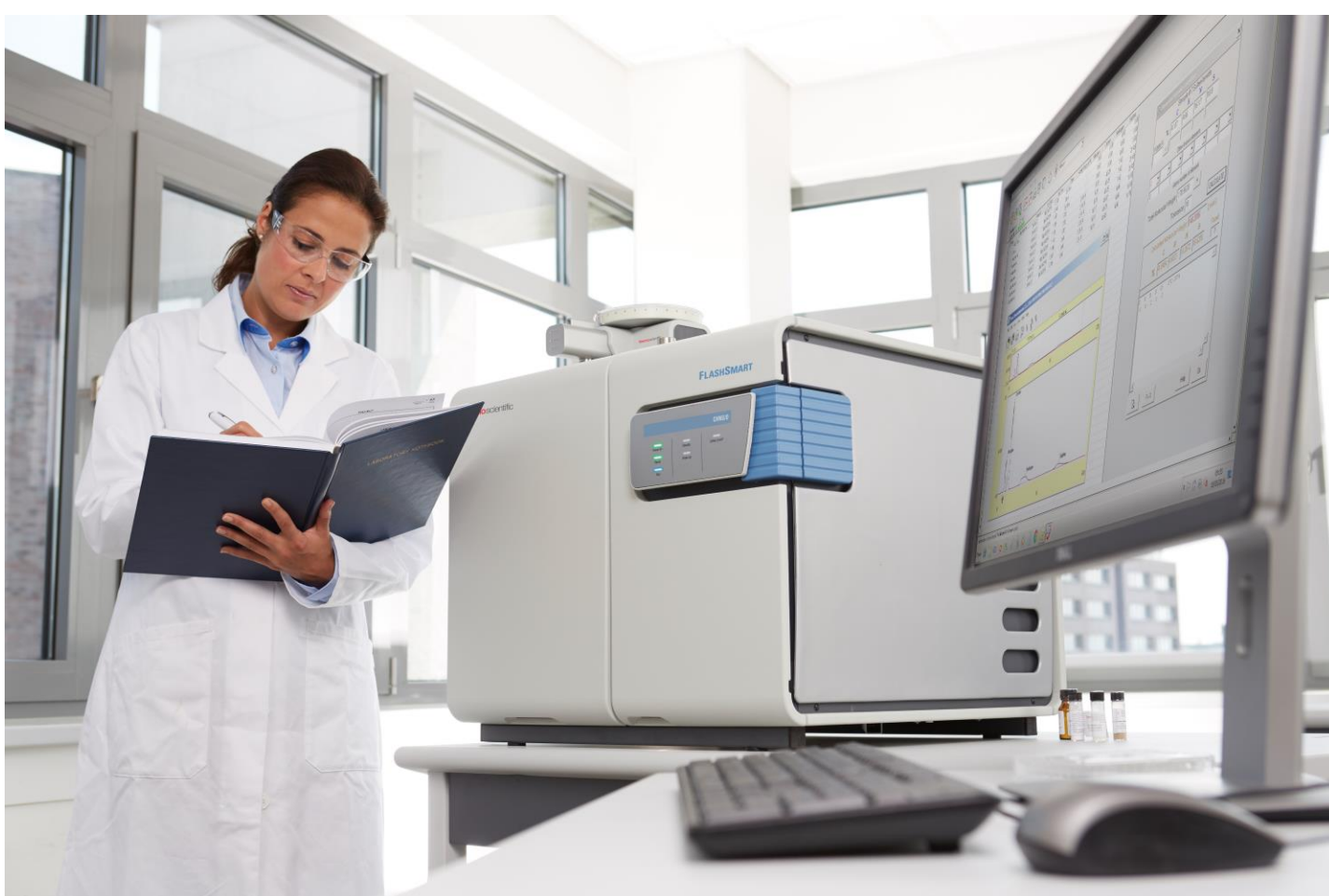
Figure 1. FlashSmart Elemental Analyzer.

The FlashSmart EA uses helium as carrier gas, which ensures high sensitivity. Considering the need for cost efficiencies and the likely increase in helium gas cost, due to its possible shortage, an alternative for the carrier gas, is needed. Argon which is readily available, can be used as alternative to helium in the FlashSmart EA.