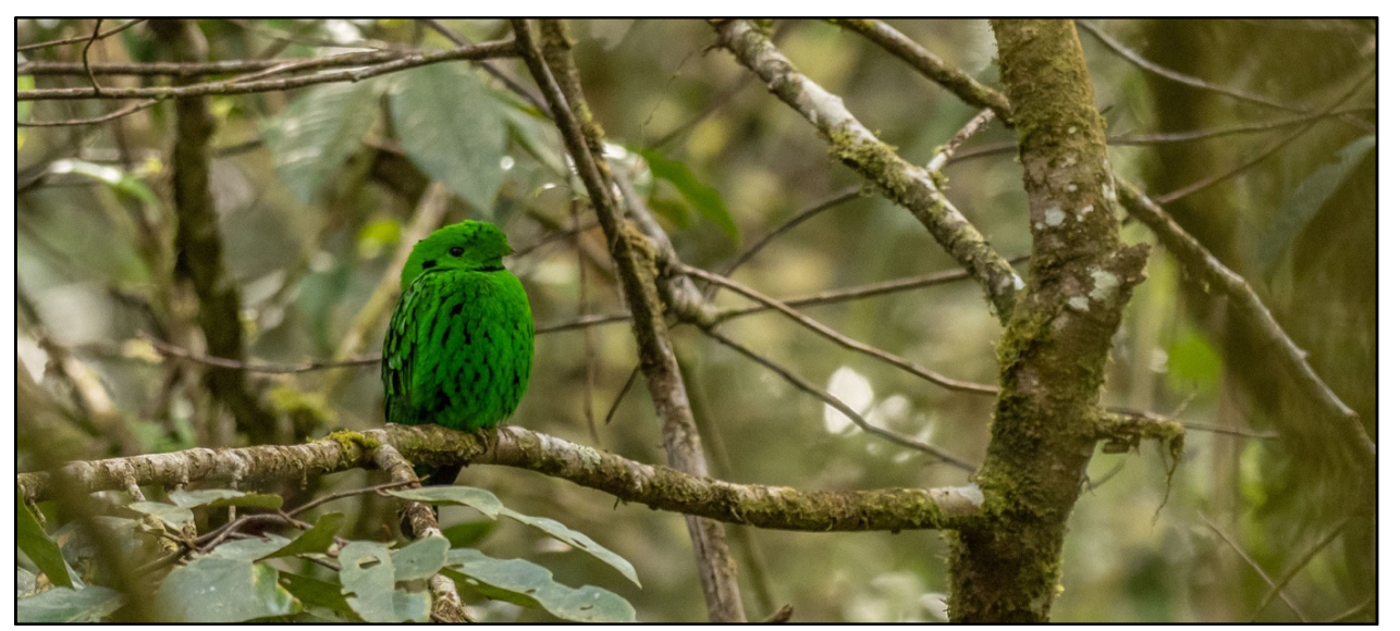
We had 30-minute walkaway views of the superb Whitehead's Broadbill

Our group flew in to Kota Kinabalu, where our journey began. During the first part of the tour we focused on the endemic-rich Kinabalu mountain, which we birded from the conveniently located Hill Lodge right at the park entrance. After birding the cool mountains, we headed with pleasure for the tropical Sabah lowlands, with Sepilok as our first stop followed by the Kinabatangan River and Danum Valley Rainforest. The Kinabatangan River is a peat swamp forest holding some very special fauna and flora. Tall dipterocarps dominate the forests of Sepilok and Danum; we did very well in finding the best birds on offer in all places visited.