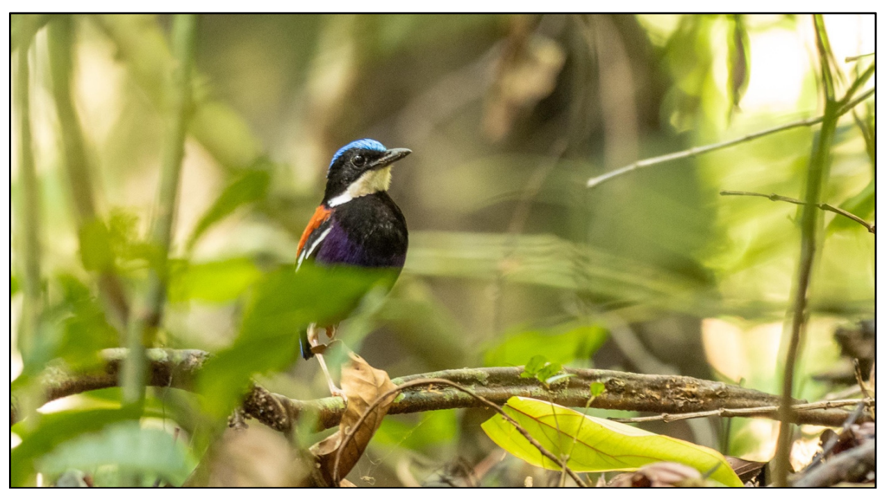
Splendid views of Blue-headed Pitta

It's not only the birds that are wonderful in Borneo; we also paid attention to the other wildlife around us. Mammals occur in abundance, and we came across many of them daily. The main reason to come to this part of the world is probably the occurrence of the Bornean Orang-Utan. We were eye to eye with these wonders on four different days of the tour, and every one of them