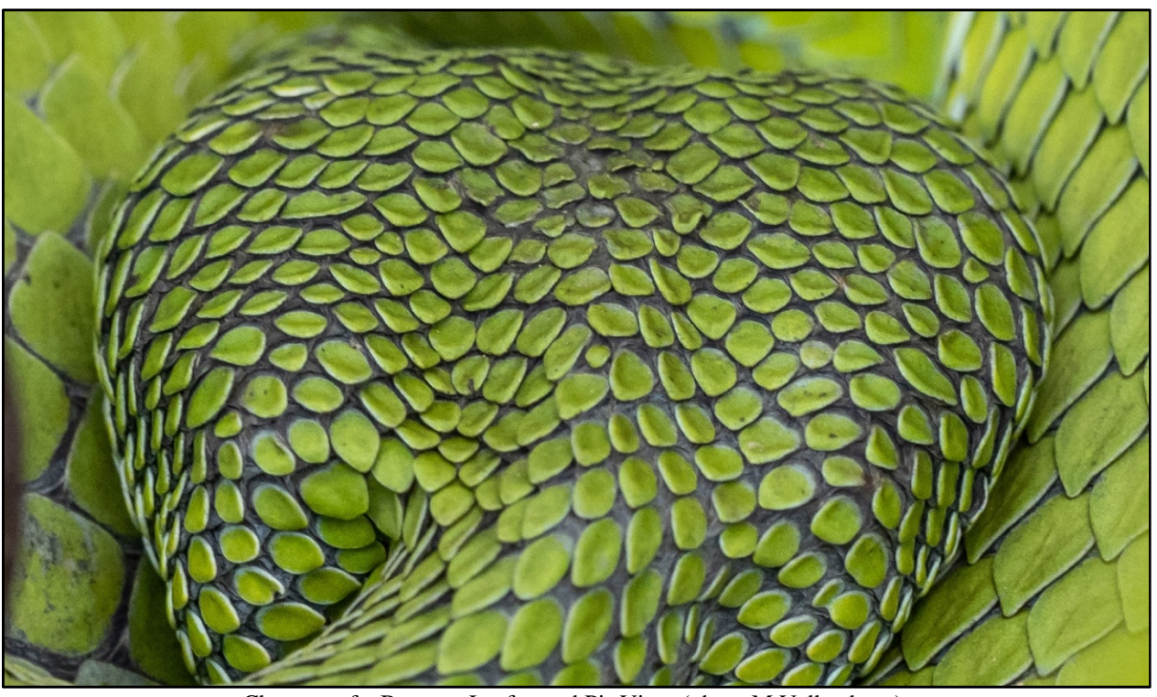
Close-up of a Bornean Leaf-nosed Pit-Viper