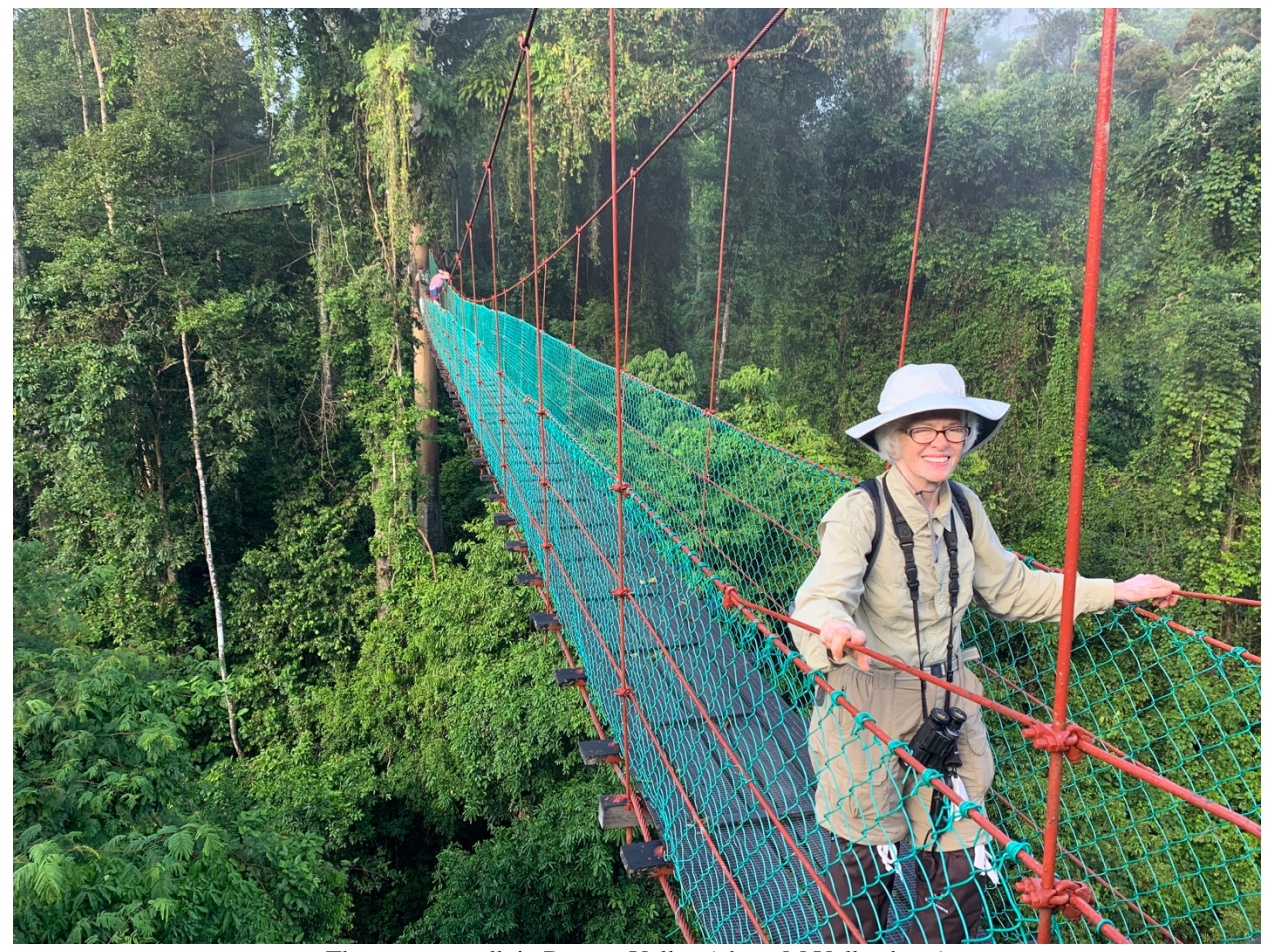
The canopy walk in Danum Valley