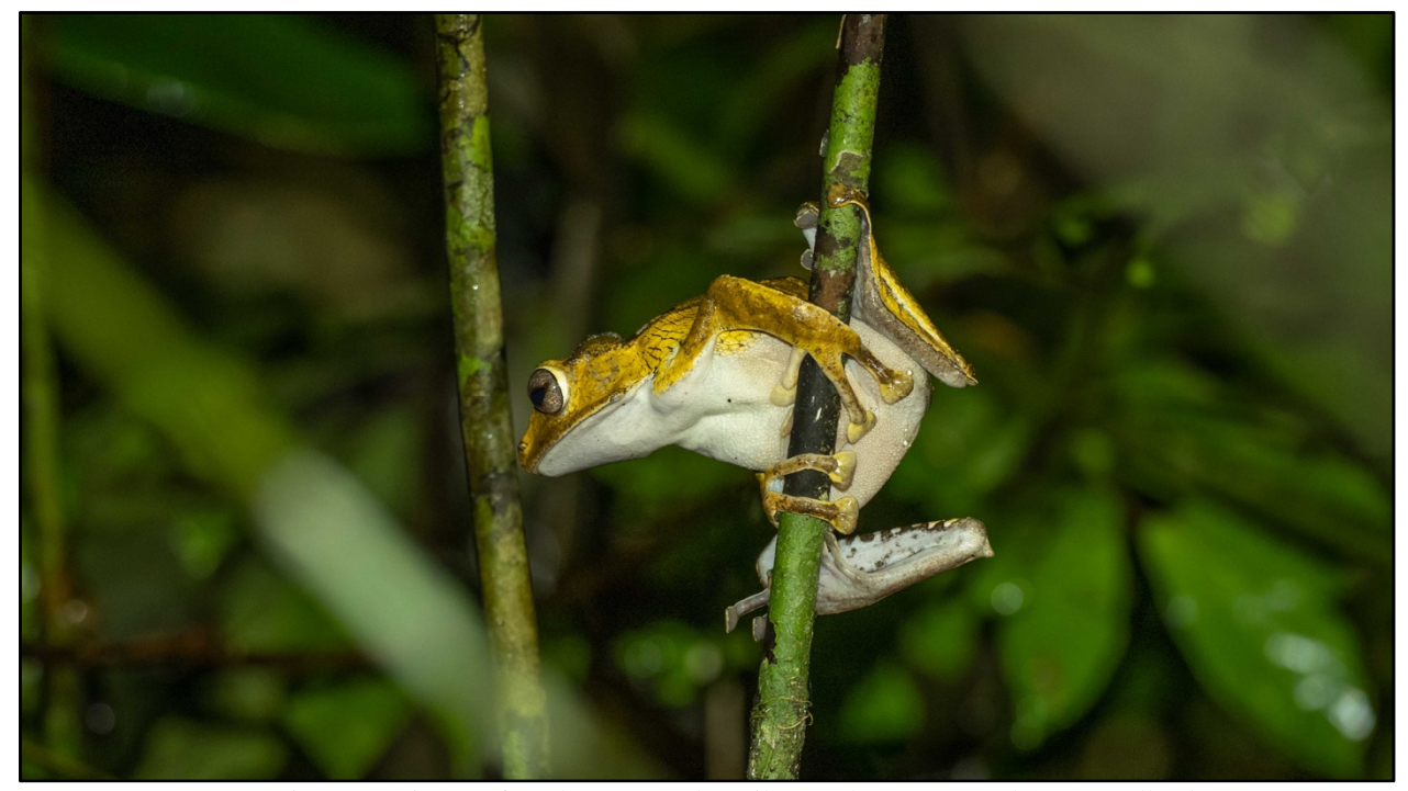
On an evening excursion we found a spectacular Vile-eared Tree Frog