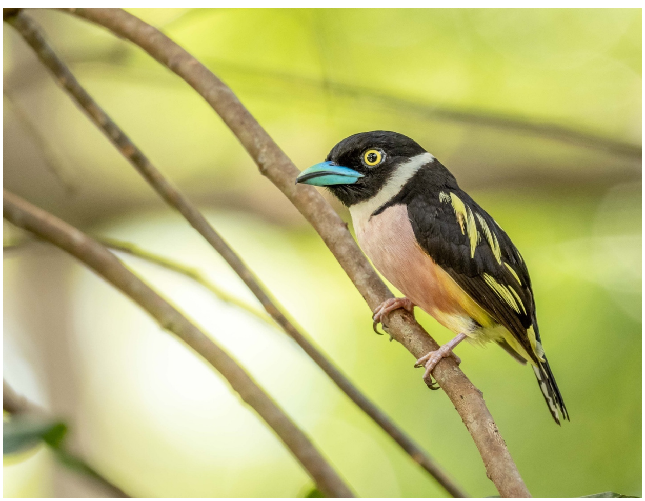
Extreme close views on our tour of this fantastic Black-and-yellow Broadbill