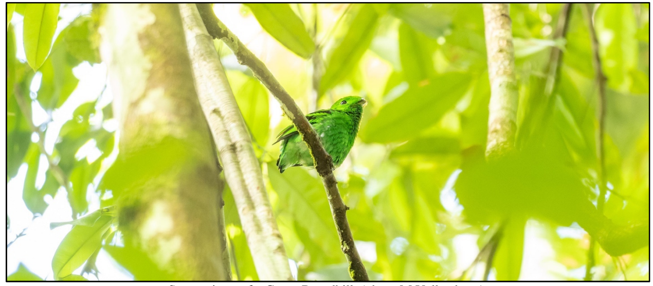
Scope views of a Green Broadbill