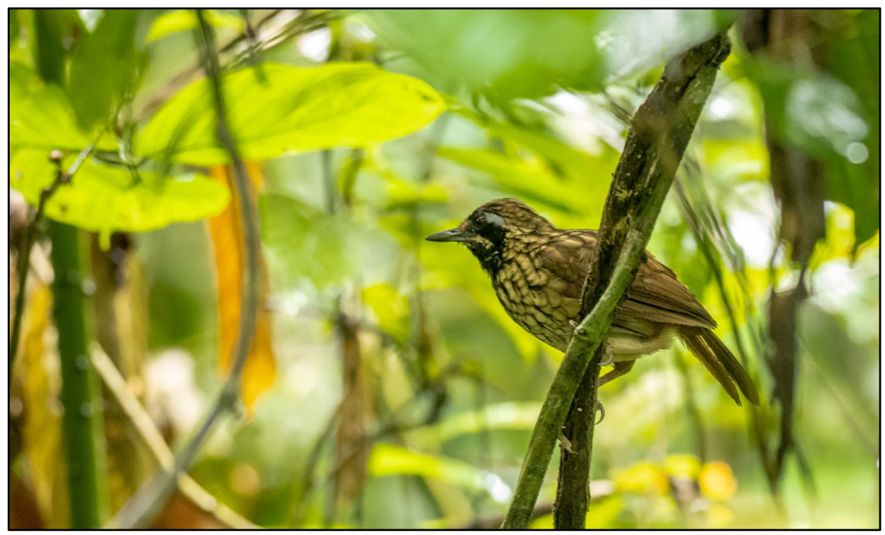
Black-throated Wren-Babbler posed for all