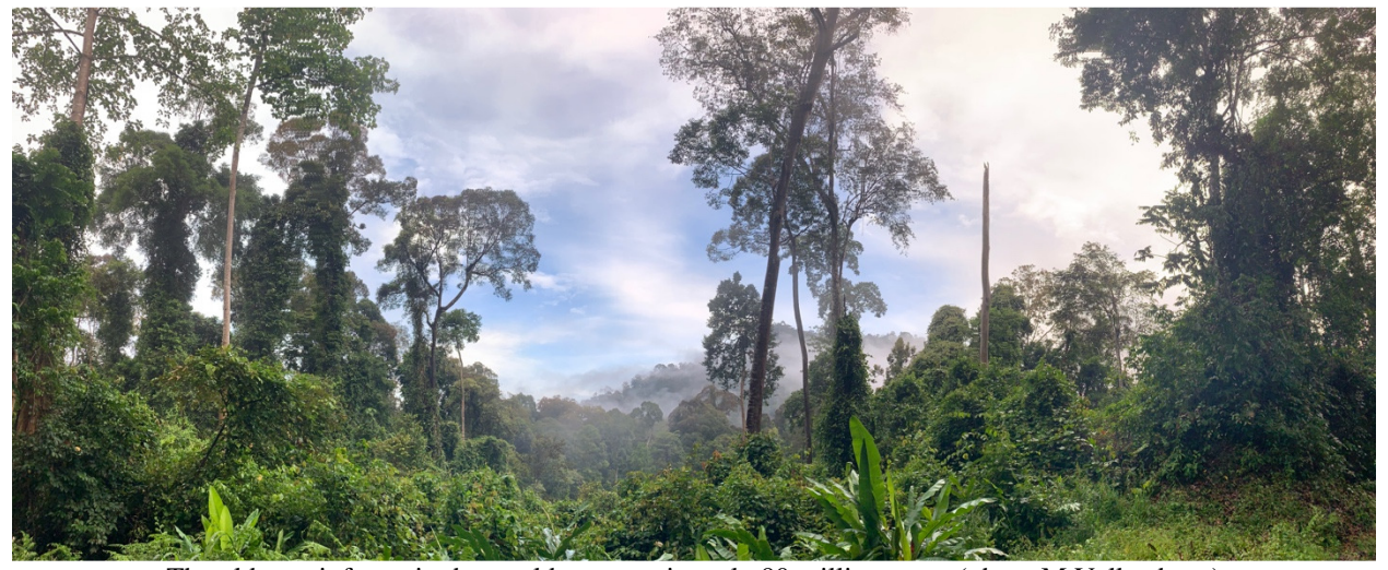
The oldest rainforest in the world...approximately 90 million years