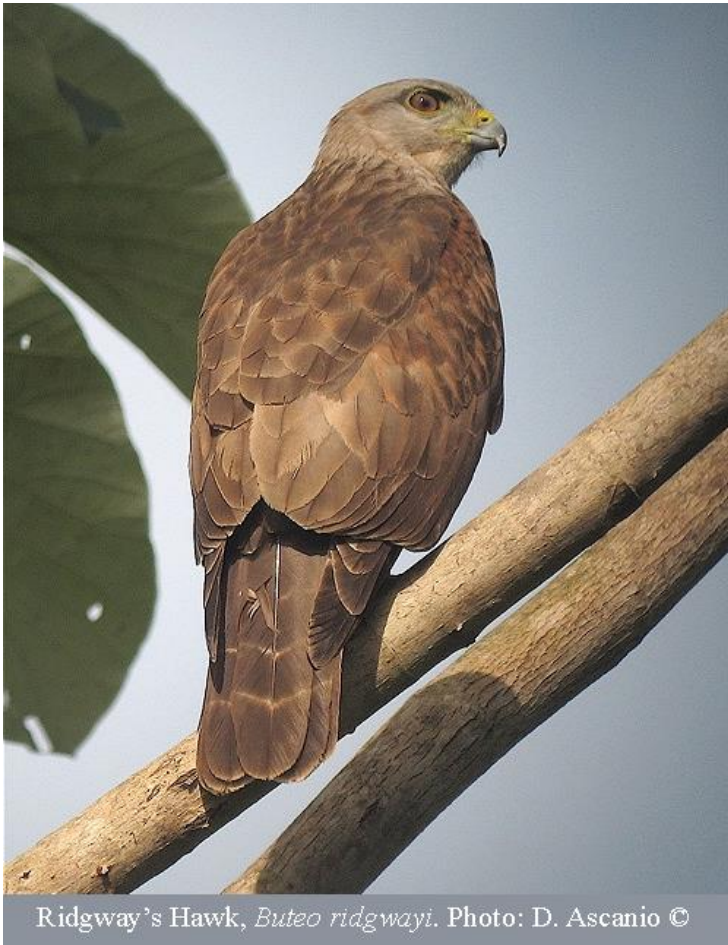
Ridgway's Hawk, Buteo ridgwayi .

Welcome to the Dominican Republic—an exciting Latin American country in the Caribbean featuring outstanding nature, a rich human history and, best of all, wonderful birding. Like other locations in the Caribbean, the Dominican Republic embodies the classic vacation in paradise: sandy beaches, palm trees, beautiful coastline, rugged mountains, and lush tropical forests. Add to this a splendid array of endemic or nearly endemic bird species and the picture is complete.