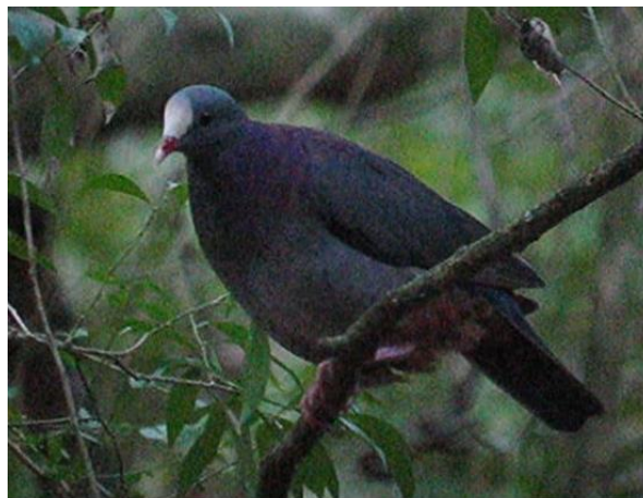
White-fronted Quail-Dove. Geotrygon leucometopia .

April 14, Day 5: Zapotén Cloud Forest. Lying in the southwest corner of the Dominican Republic is a remote and largely inaccessible mountain range known as the Sierra de Bahoruco. Quite unlike the other ranges of the country, the story of the Bahoruco is a fascinating one of evolution, endemism, and island biogeography. Twenty million years of mountain building and changing sea levels routinely connected and separated the Bahoruco from the rest of the island in a continuing cycle. The effect on the flora and fauna of the island cannot be overstated. Nearly all the endemic bird species are found on this part of the island, and we will spend three days exploring the different habitats of the Bahoruco range. The changes in birdlife can be monitored as we reach elevation and thus, a different habitat.