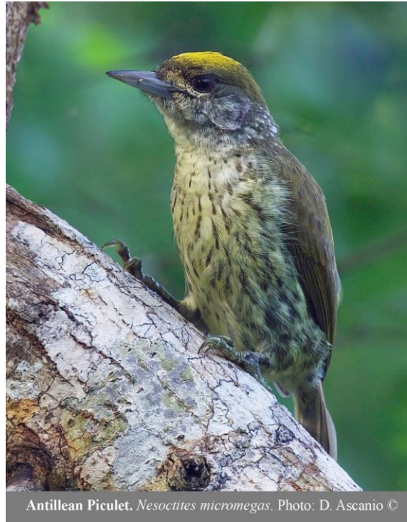
Antillean Piculet. Nesocittes micromegas .

Our second day in the area will see us on the Rabo de Gato trail. Here we plan to look for Plain Pigeon, Antillean Euphonia, Greater Antillean Grackle, and White-fronted Quail-Dove (rare and unpredictable). For the majority of the day, we'll be birding the zone where thorn-scrub meets semi-evergreen, sub-humid forest. Birds are often plentiful, and we may see as many as 20 island and regional endemics this morning. Among our targets are the beautiful Hispaniolan Parrot, the solitary Hispaniolan Pewee, the comical Hispaniolan Lizard-Cuckoo, the extravagant Bay-breasted Cuckoo (infrequently heard, rarely seen), Black-crowned Palm-Tanager, Stolid Flycatcher, Zenaida Dove, Key West Quail-Dove and Antillean Piculet. Following a picnic lunch, we will head to the alkaline shore of nearby Lago Enriquillo. Lying to the north of the Sierra de Bahoruco is the Neiba Valley, a highly alkaline coral desert. Now 130 feet below sea level, this valley was once a strait of the Caribbean. What is left now is a massive body of water fed by about ten streams and rivers, but with no outlet! Evaporation is high and, as a result, the lake is three times as salty as the sea. Descending from the higher elevations, the view of the sprawling lake below us is one of great panoramic beauty. The deep valley is further highlighted by the view of the Neiba Mountains to the north. Photographic opportunities are plentiful here.