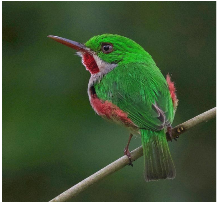
Broad-billed Tody, Todus subulatus.

This tour also includes an opportunity to search for the Ridgway's Hawk, considered to be the most threatened buteo in the world. For this endeavor we will journey to the northeast part of the island, to the buffer zone of Los Haitises National Park. Here the last known pairs of this critically endangered species hang on. Should there be a nesting site, we will surely be taken by a local guide, making our chances of finding the hawk good.