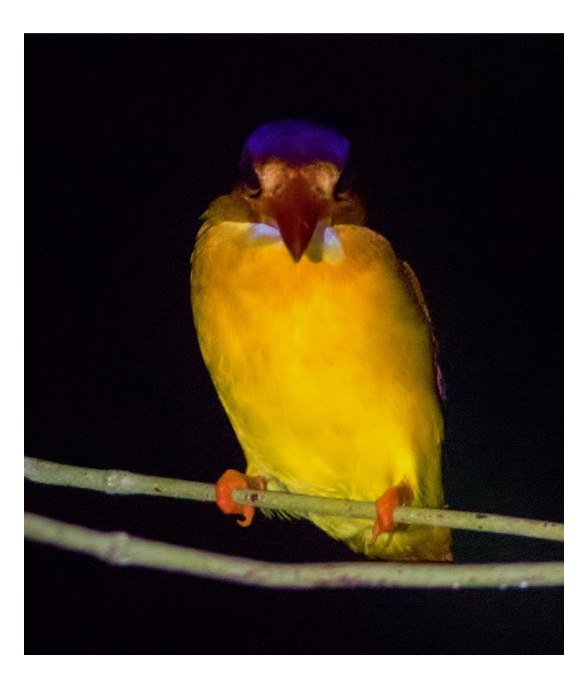
A Rufous-backed Dwarf-Kingfisher found roosting near Sabang highlights the beautiful violet crown often hard to appreciate in views during the day. (Adrian Constantino)

A final morning in Sabang allowed us to catch up with a few new species for the trip list. Best could have been a pair of Sulphur-bellied Bulbuls and a lovely male Blue Paradise-Flycatcher, both uncommon Palawan endemics with a supporting cast of Crested Serpent-Eagle, Fiery Minivet, and Velvet-fronted Nuthatch. Leaving Sabang we located to Puerto Princesa and, after a break, headed out to Irawan. It was quite active for an afternoon session, everyone improving on their looks at Ashy-headed Babbler and a bunch of other species, more than fifty for the day list. New were Pygmy Flowerpecker, Chestnut-breasted Malkoha, and Black-naped Monarch. In the open country we spotted a large female Peregrine Falcon perched on a power tower.