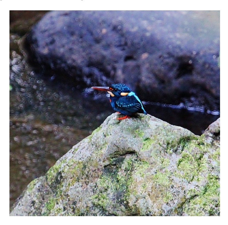
The jewel-like male Indigo-banded Kingfisher we located at Mount Makiling.

male Black-and-white Triller, a scarce and inconspicuous endemic, and a male Flaming Sunbird that had a stoush with a Red-keeled Flowerpecker over some red flowers. It was time to leave Mount Makiling, and as a farewell we enjoyed a close perched Gray-faced Buzzard. We flew onto Dumaguete on the oriental coast of Negros for our final birding location.