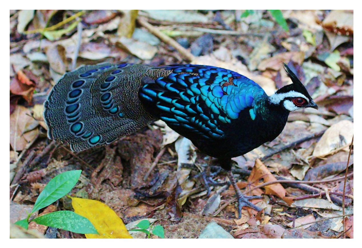
The surreal male Palawan Peacock-Pheasant lives on at the Subterranean River National Park. (Dion Hobcroft)

checked into our beautiful hotel, and shortly we headed off to start our first session of birding on Palawan. It proved to be memorable, as constant bird activity started with a superb Rufous-bellied Eagle. This was mobbed by an Oriental Hobby, while storm activity stimulated good numbers of giant Brown-backed Needletails to zoom past us. More swift activity generated a few Pygmy Swiftlets and a flock of Ameline Swiftlets. Better though, were three small flocks of Blue-headed Racquet-tails that came zooming past. A male Purple-throated Sunbird held for a long view, a Square-tailed Drongo-Cuckoo was whistled up, and then five Philippine Cockatoos flew in right near us and started munching on Acacia phyllodes in perfect light only 50 meters away. Yes! We finished with cooperative Rufous-tailed Tailorbird, lovely Yellow-throated Leafbirds, and the attractive Black-headed Bulbul. After dinner those who were up for it went for a night session. We had instant success with a handsome Spotted Wood-Owl and, after a patient search, we had cracking looks at a male Palawan Frogmouth. On the walk out we found a Common Palm-Civet. All up a truly excellent day.