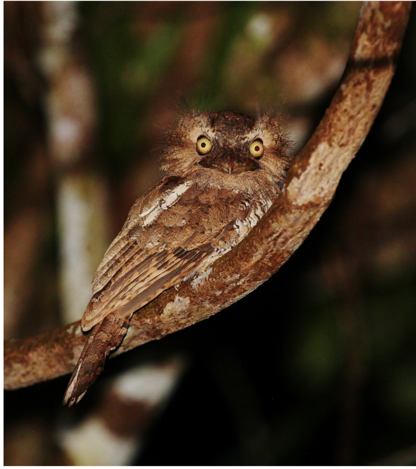
Palawan Frogmouth