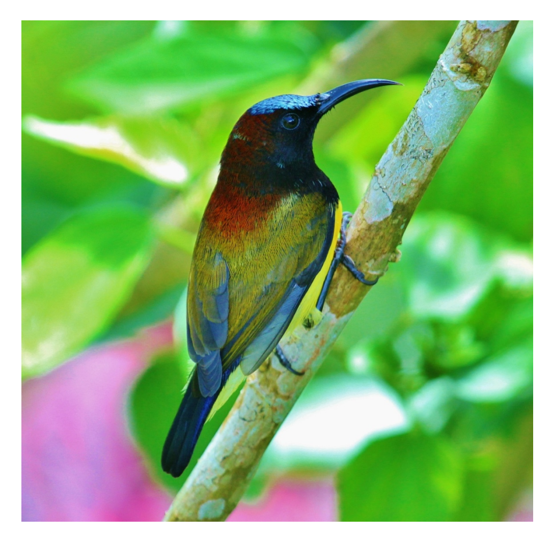
Endemic to Negros, Guimaras and Panay, the Maroon-naped Sunbird was attracted to flowering Hibiscus in the Twin Lakes National Park, a lovely birding site we visited several times.