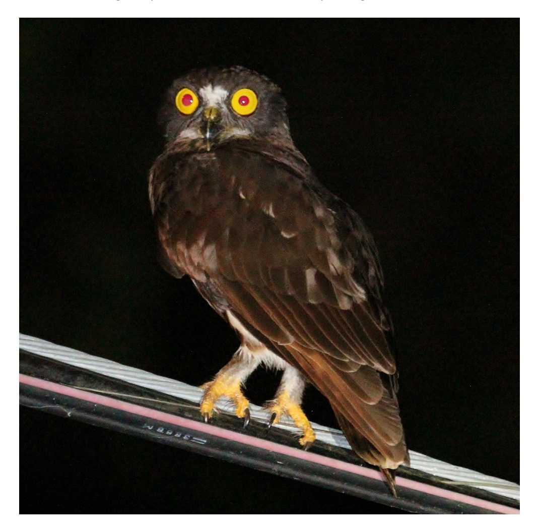
A brazenly tame Chocolate Boobook found at Subic. (Dion Hobcroft)

small flock of wintering White-shouldered Starlings and at least two Eastern Marsh-Harriers, both quite scarce in the Philippines. A good variety of more widespread Asian wetland birds showed well including Wandering Whistling-Duck, Yellow and Cinnamon bitterns, Barred Rail, White-browed Crake, two Watercocks seen briefly in flight, Oriental Pratincole, Whiskered Tern, Lesser Coucal, Common Kingfisher, Clamorous Reed-Warbler, Striated Grassbird, and Chestnut Munia. Fringing trees supported Golden-bellied Gerygone, Pied Triller, Philippine Pied-Fantail, and a few Arctic Warbler types, one of which gave the diagnostic contact call of the Kamchatka Leaf-Warbler and came down to have a look at us when we played these notes back to it. Interestingly, we found a couple of bats—one a Geoffroy's Rousette disturbed roosting in a palm frond, and then a belfry hiding several Lesser Yellow House Bats.