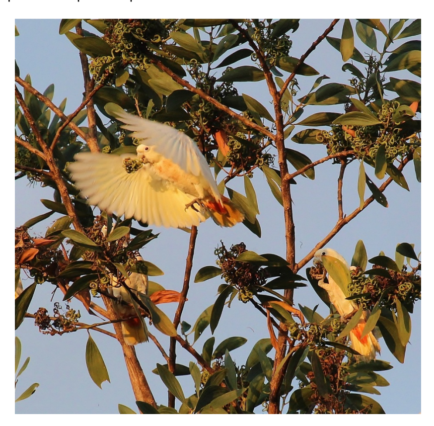
Superb views of Philippine Cockatoos feeding on these unusually curly phyllodes that house the seeds of an Acacia. Notice the red vent on the cockatoos. (Dion Hobcroft)

A last morning at Subic and a reduced number of special birds to look for were our primary focus. Main priority: the Green Racquet-tail. This morning we had four flyover views, the last the best as we called them over us. You could see the racquets if you were on your game. A Siberian Peregrine Falcon was doing warmup laps around the bus first thing. Other good sightings included much better looks at sneaky Rufous Coucals, a couple of perched White-eared Brown Doves, a male Asian Koel wolfing figs, plus many of the species we had become familiar with during our time birding the forests here. We checked out the camp of Large and Golden-crowned flying-foxes, a hive of restlessness and noisy squabbling as the giant bats fanned their wings to thermoregulate. After lunch we drove back into Manila, passing many of the grand old buildings in the city center—art galleries, museums, and a cultural center commissioned by Imelda Marcos. In a peculiar twist of paradox, at dinner Imelda Marcos actually turned up! A new tripod was purchased at the "Mall of Asia."