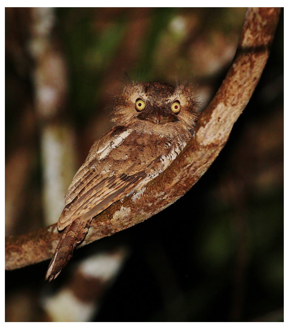
Often considered a separate species, the Palawan Frogmouth is still lumped by some with Javan Frogmouth. It took a while to track down this individual at night in the forest interior.

There would be more chances for these. In the afternoon we did some roadside birding, first picking up White-bellied Munia in some ricefields before enjoying another six Palawan Hornbills. Palawan Tit showed up but kept annoyingly high, as did Spot-throated Flameback; then a beautiful male Lovely Sunbird drifted down low. Setting up near a fruiting fig, a constant procession of interesting and new species came past, allowing us to scope most of them in good light. Great Slaty Woodpecker was very popular as usual, as was the sonic Hill Myna. Other interesting species on offer included perched Bluenaped Parrots, a fly-by Philippine Cockatoo, seriously superb views of perched Bluenheaded Racquet-tail, Hair-crested and Ashy drongos, Philippine Cuckoo-Dove, and Striped Flowerpecker. A night walk proved quiet except for a glowing Rufous-backed Dwarf Kingfisher found sleeping in a small tree near a stream giving surreal views.