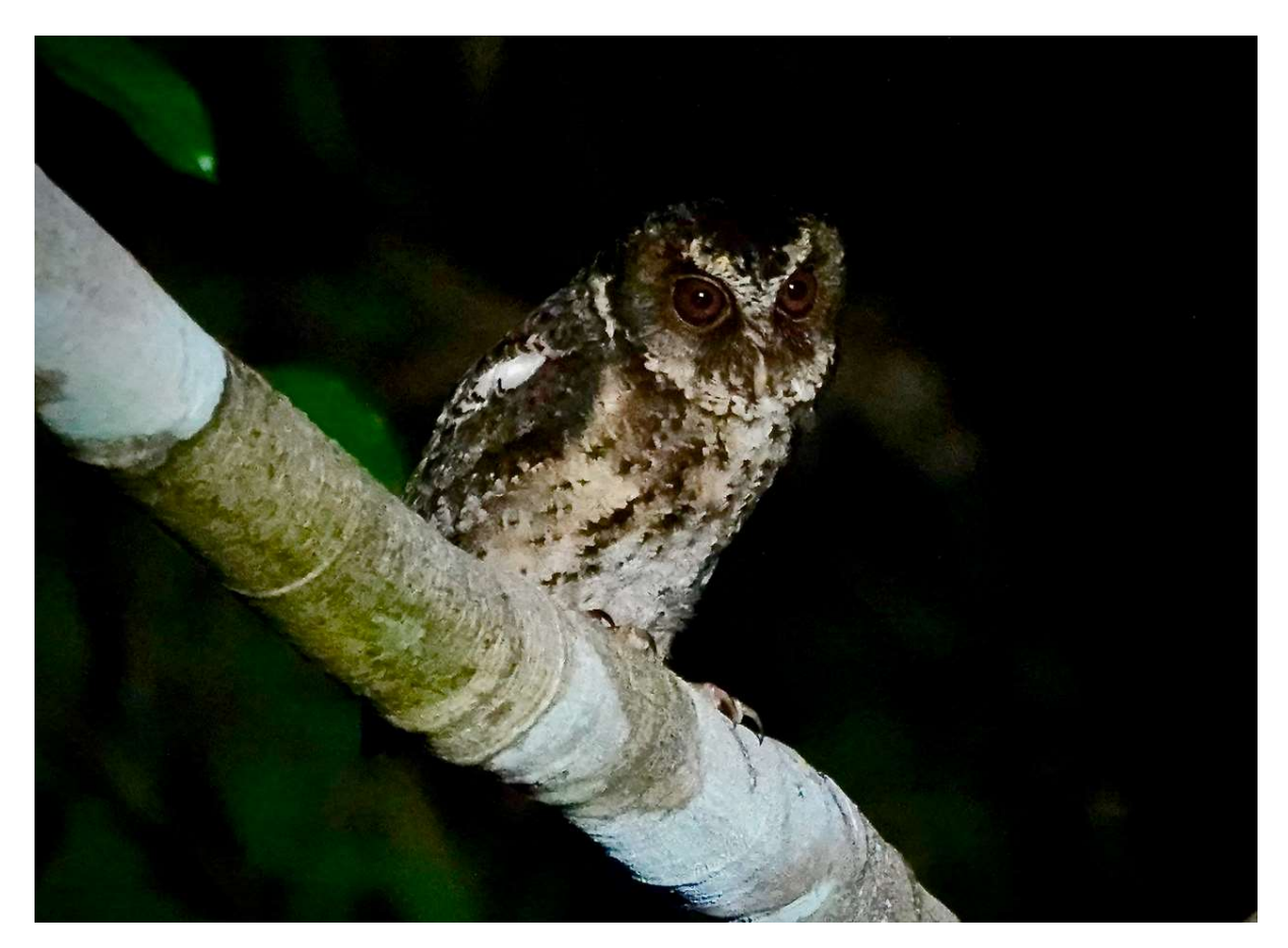
A Palawan Scops-Owl at Sabang.

One final morning in Palawan, and we found ourselves at Irawan, a community forest park. Here a series of constructed hides gave us access to the skulking Palawan Flycatcher and a fine Blue-eared Kingfisher. Re-visiting the mangroves, we caught up with Common Iora and Arctic Warbler. Soon we were back at the Midas, our home away from home.