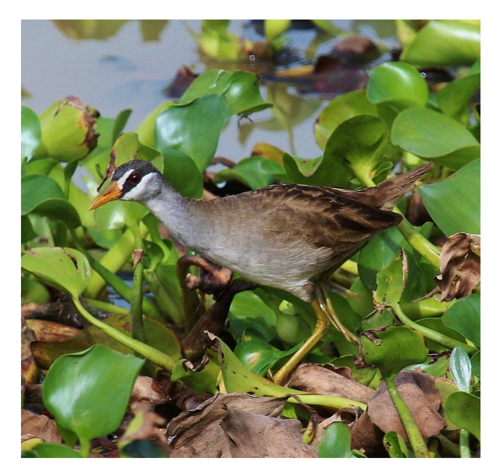
A White-browed Crake walks across the water hyacinth at Candaba Marsh.

Swamphens of the trip and quite a few scarce wintering birds from East Asia, like a flock of White-shouldered Starlings, an Eastern Marsh Harrier, and a Pheasant-tailed Jacana. There were excellent views of Barred Rail, White-browed Crake, Wandering Whistling-Duck, three species of bitterns (Black, Yellow, and Cinnamon), a Long-toed Stint, numerous Wood Sandpipers, a pair of Oriental Pratincoles and cooperative Clamorous Reed-Warblers, Oriental Skylarks, and Golden-bellied Gerygone. After lunch we enjoyed a siesta before taking in our first birds in the well-protected lowland forests of Subic Bay. It was a good session where we encountered Luzon Hornbill, Coleto, White-bellied and Northern Sooty woodpeckers, Barbellied and Blackish cuckoo-shrikes, and a fantastic Scale-throated Malkoha. On dusk, several Great Eared-Nightjars hawked around us, and we located a sublime Chocolate Boobook to open our owl account.