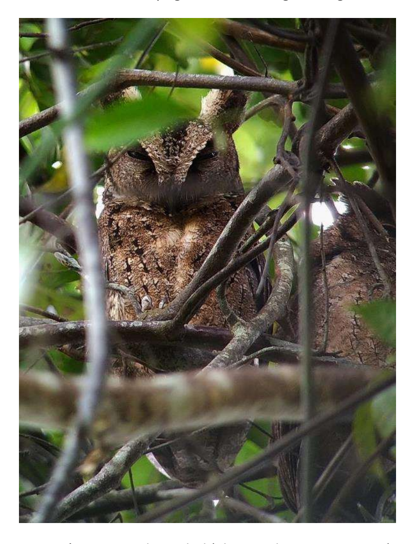
Everett's Scops-Owl in Bohol

on the ferry and disembarked in Dumaguete. In the evening we made a failed attempt to see the Negros Scops-Owl. Well, we could try again the following evening for those who were keen.