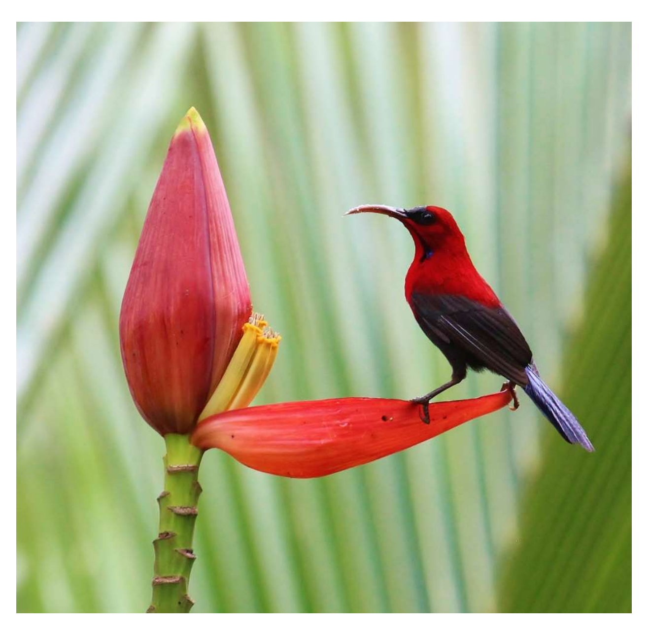
A male Magnificent Sunbird poses beautifully near Twin Lakes National Park, Negros.