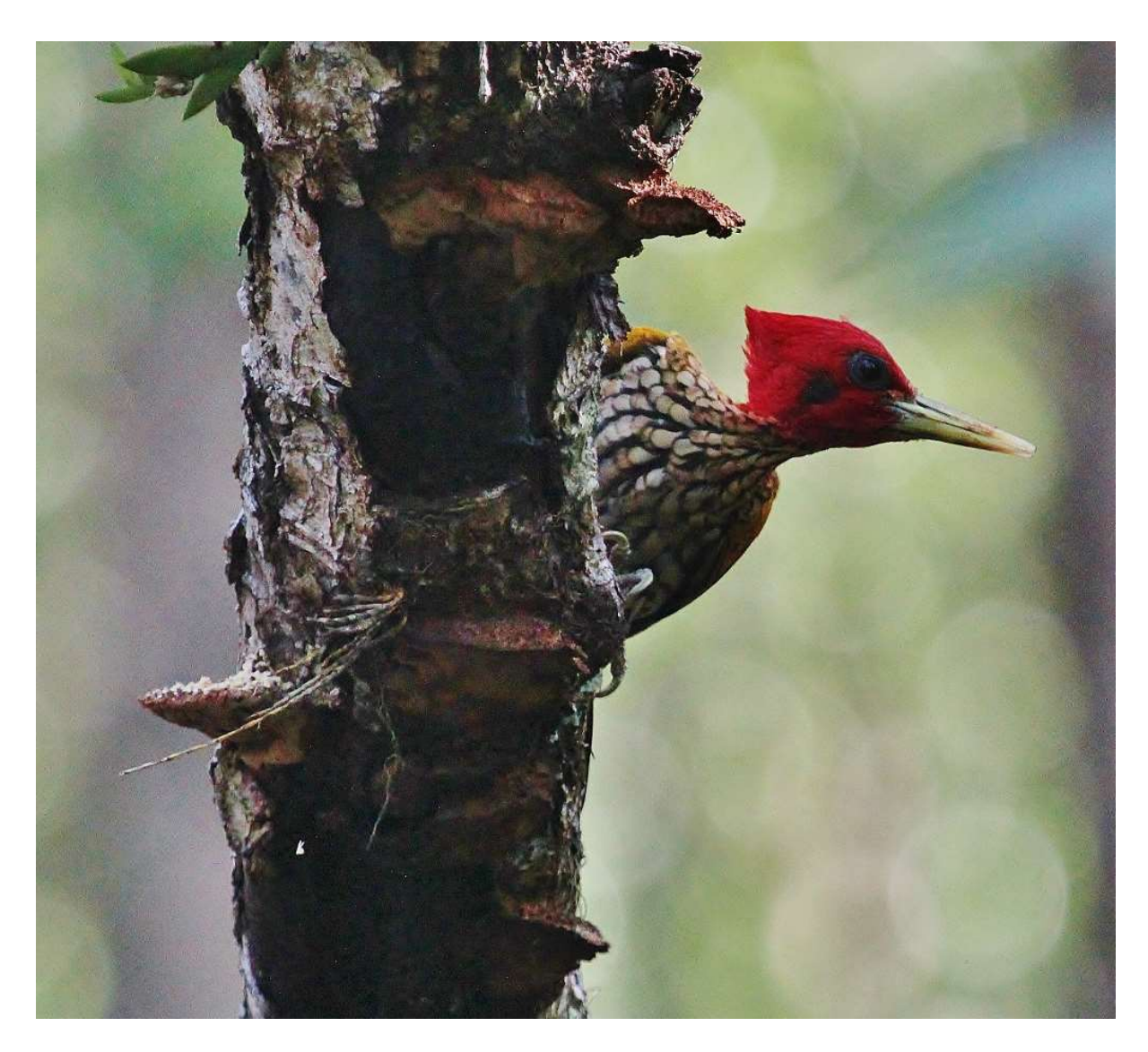
The scarce Red-headed Flameback showed well in Palawan.

We all met up for dinner at the Midas Casino, our full group in good spirits despite the emerging outbreak of "Novel Coronavirus" and the ensuing chaos it caused in some parts of the globe. It was necessary to commence with the obligatory early start to escape the traffic "carmageddon" of Manila and also road works that would make it longer to drive across to the remnant marsh of Candaba. Our timing was good though, and we had a productive morning racking up some fifty species or more in our time here. Best were our only Philippine