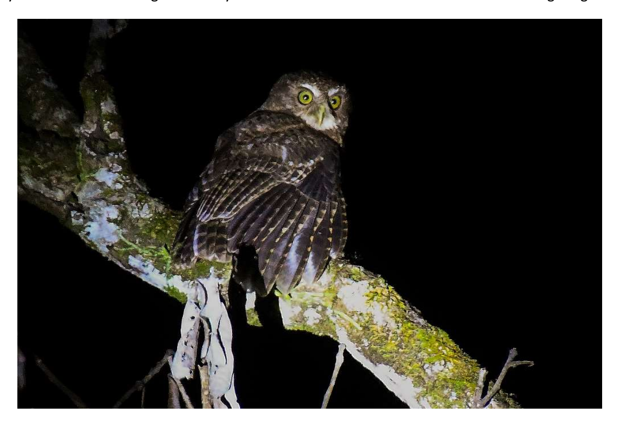
A Cebu Boobook at Tabunan, Cebu.

The next morning we returned, with some participants opting for roadside birding and others returning to the forest. Birding was quite good, although challenging, in the forest interior. We had success with a vocal Blue-breasted Pitta male giving a magical view; a female Black Shama came in to investigate us; a pair of Mangrove Blue Flycatchers showed well and repeatedly; and White-vented Whistler was located after a patient wait, foraging lethargically in canopy thickets. Streak-breasted Bulbul was heard and gave just feeble glimpses. Forest edge produced the red-headed subspecies of Coppersmith Barbet, Magnificent Sunbird, and Everett's White-eye. After lunch we caught the ferry to Bohol where a Common Tern was a notable sighting.