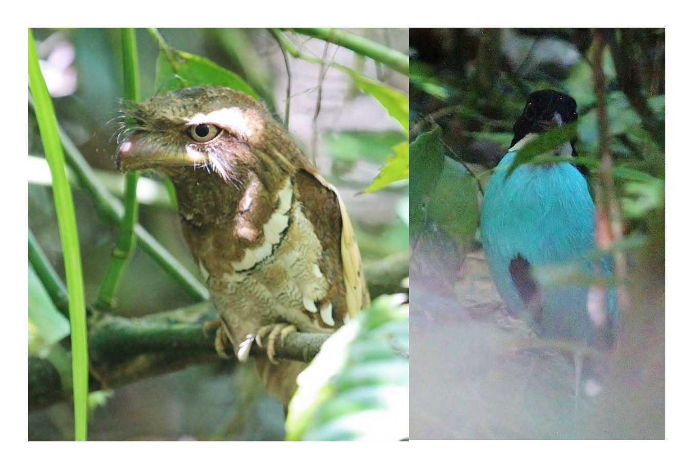
Philippine Frogmouth (above left) and Azure-breasted Pitta (above right) in Bohol.