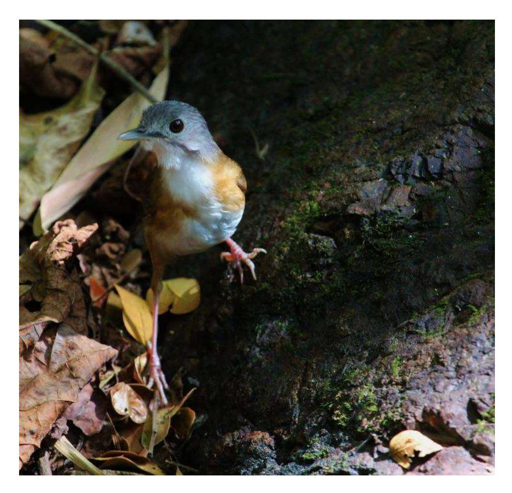
An attractive Ashy-headed Babbler at Irawan, Palawan.

great roll call of birds: Black-faced Coucal, Philippine Frogmouth, Everett's Scops-Owl, Northern Silvery-Kingfisher, Buff-spotted Flameback, a stunning Azure-breasted Pitta, Yellow-wattled Bulbul, Yellow-breasted Tailorbird, amazing Striated Wren-Babbler, a Philippine Fairy-bluebird for some, Bicolored Flowerpecker, Handsome Sunbird, and Bohol Sunbird were all major highlights.