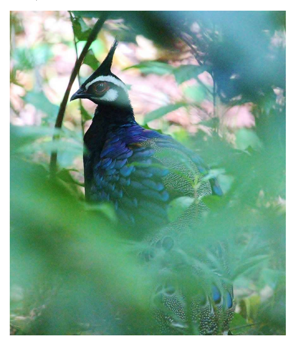
A male Palawan Peacock-Pheasant hides in the rainforest at the Crocodile Park.

undergrowth. The afternoon was highlighted by an incredible flock of fifteen Red-crested Malkohas that while typically shy, by numbers and staging allowed all a decent view. After dark we had a cracking look at a Luzon Boobook, making it two owls in two nights. Our final morning in Subic was positively birdy, and our major highlight was a superb perched Green Racquet-tail that we watched feeding in the scope for a long time. At a giant camp of flying-foxes we had great views and photographic opportunities for both Large and Golden-crowned flying-foxes. Returning to Manila, we squeezed in a strategic twitch that was successful on two counts, with first a perched Philippine Nightjar, followed by a lovely Philippine Scops-Owl. Both would save us some nocturnal perambulations.